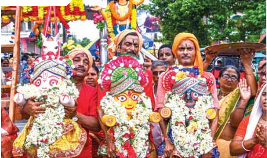
Devotees carry idols of Lord Jagannath, Balabhadra and Subhadra on the occasion of Ulta Rath Yatra in Nadia