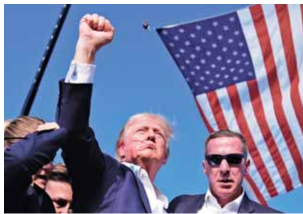
Republican presidential candidate former President Donald Trump reacts as he is surrounded by US Secret Service agents at a campaign rally, in Butler