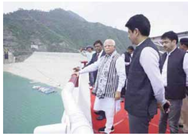
Expressing his appreciation for the ongoing efforts, the minister congratulated the