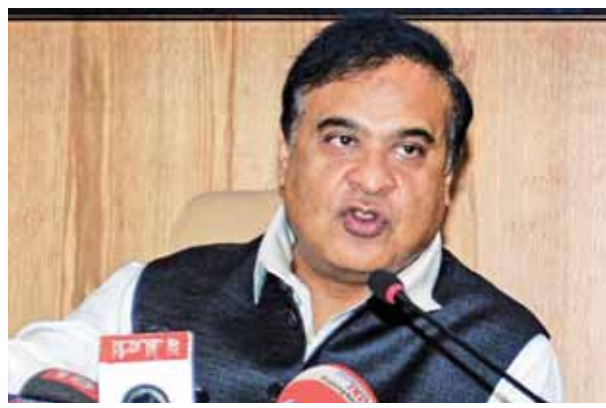
Assam Chief Minister Himanta Biswa Sarma addresses the media, in Guwahati

Assam Chief Minister Himanta Biswa Sarma on Monday said anyone coming to Assam in 2015 or later will be deported back to their country of origin. "We will deport those who have come after 2015. Only eight persons have applied so far who came before 2015 for CAA. Out of these applicants, only two have proceeded to attend interviews with relevant authorities," the CM said at a Press conference in Guwahati to share the insight into the implementation of the Citizens' Act. The Centre on March 11 implemented the Citizenship (Amendment) Act, 2019 CAA by notifying the rules, four years after the law was passed by Parliament to fast-track citizenship for undocumented non-Muslim migrants from Pakistan, Bangladesh and Afghanistan, who came to India before December 31, 2014, and stayed here for five years. "We conducted outreach programmes in the Barak valley and approached many-Hindu Bengali families and asked them to apply for citizenship under CAA. However, they refused to do so. The Assam Chief