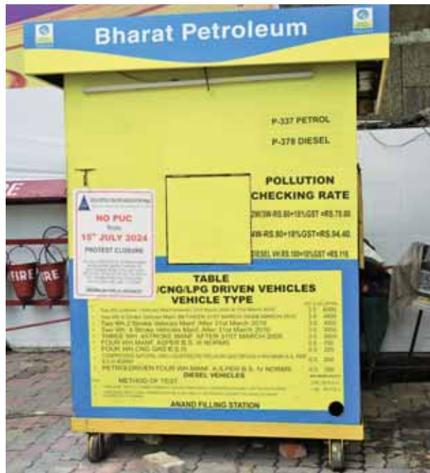
View of a petrol pump, in New Delhi, on Monday. Around 600 Pollution Under Control (PUC) centres across 400 petrol pumps in the national Capital will remain closed from Monday in response to a protest call by petrol dealers and pump owners

Around 600 Pollution Under Control Centres (PUC) across 400 petrol pumps in the national Capital will remain closed starting Monday in response to a protest call by petrol dealers and pump owners following the Delhi Government's proposed hike in pollution certificate charges. The closure call of PUC by the Delhi Petrol Dealers' Association (DPDA) comes amid tussle with the Government for not revising the PUC checking rates according to the demand of the association. The association of petrol dealers claimed that while the rates for PUC certificates were not increased from the last 13 years, last week, there was a very nominal increase in the rates by the Delhi Transport Department. While announcing the decision on Thursday, Delhi Transport Minister Kailash Gahlot said, "In response to the long-pending demands of the Delhi Petrol Dealers Association and to keep up with the rising costs of pollution checking services, we have decided to revise the rates. This revision is necessary to ensure that pollution checking stations can continue to operate efficiently and provide