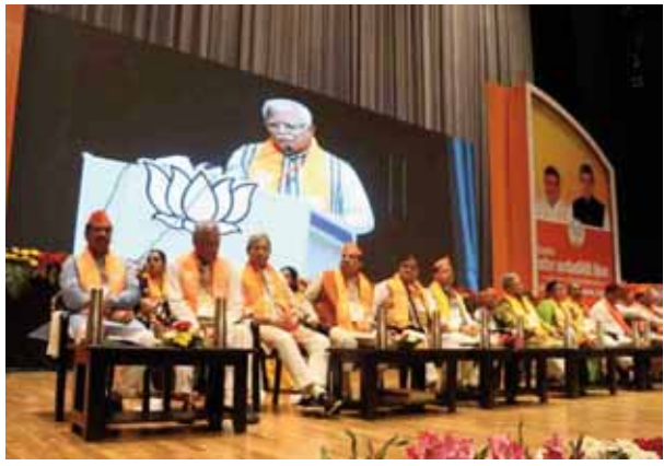
their desired development," Dhami said.

The Bharatiya Janata Party State working committee meeting ended with a focus on efforts for a developed Uttarakhand for a developed nation. Chief minister Pushkar Singh Dhami said that the BJP government had announced that it would implement the Uniform Civil Code before November 9. The UCC draft has been made public and the people will soon benefit from it. Targeting the opposition, Dhami said that there is a segment in the State which is consistently spreading lies and confusion along with rumours to orchestrate its conspiracy. "We have to work for making India a developed nation by 2047 along with making this Uttarakhand's decade. We have to spread the energy and ideas to ensure that this idea of Prime Minister Narendra Modi is fulfilled. We have to carry his legacy forward. PM Modi is the first PM who brought development plans for border regions like Mana and Adi Kailash. We are considering these regions foremost and working on priority to ensure