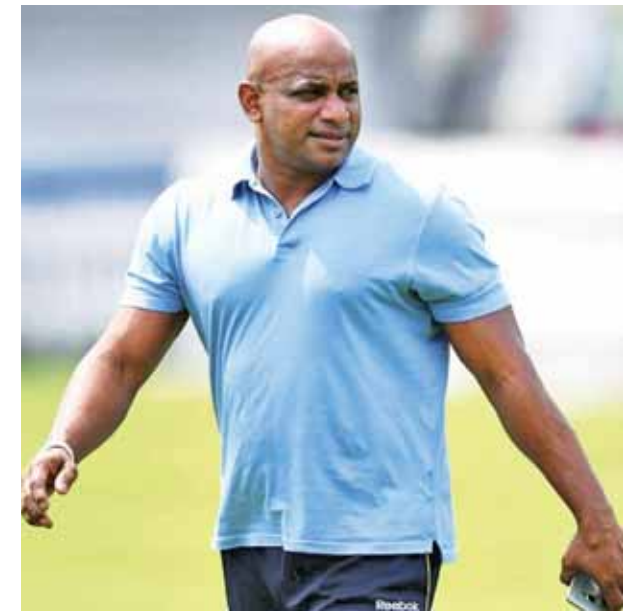
Bumrah posted on X, along with a video of him enjoying dream and it has filled me with happiness and gratitude."

the rapturous homecoming that included a breakfast meet with Prime Minister Narendra Modi and a victory parade attended by lakhs of fans in Mumbai. The 42-second clip featured the audio of Virat Kohli's speech during the felicitation function after the parade last Thursday where the champion batter had lauded Bumrah's contribution. The fast bowler had combined with all-rounder Hardik Pandya to turn it around wonderfully for India in the final. The two were brought in for their second spell in the match at a time when South Africa needed 30 off 30 balls. They wreaked havoc to ensure that the Proteas eventually fell short by seven runs. Kohli had called Bumrah a "once in a generation" player during the speech at the Wankhede Stadium, prompting the assembled crowd to chant the bowler's name in appreciation. "What I would like everyone to do is to applaud a guy who brought us back into games again, and again, and again. It was phenomenal. He is a once in a generation bowler. I am so glad he plays for us," Kohli, who retired from T20 Internationals at the end of the World Cup, had said. Bumrah was welcomed with flower petals after arriving at his Ahmedabad home recently.