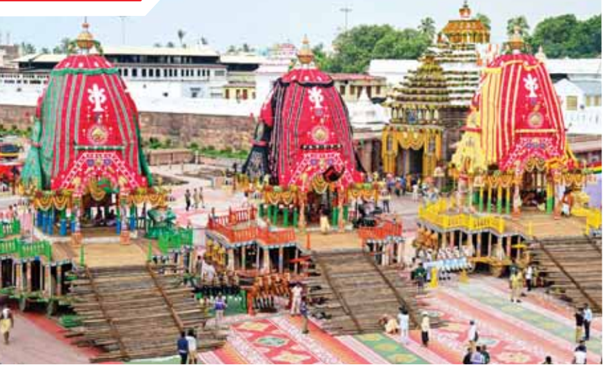
The chariots of Lord Jagannath, Balabhadra and Devi Subhadra prepared for annual Rath Yatra festival, in Puri