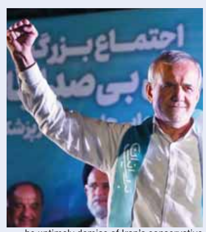
The untimely demise of Iran's conservative President Ebrahim Raisi has necessitated an election amidst regional tensions,