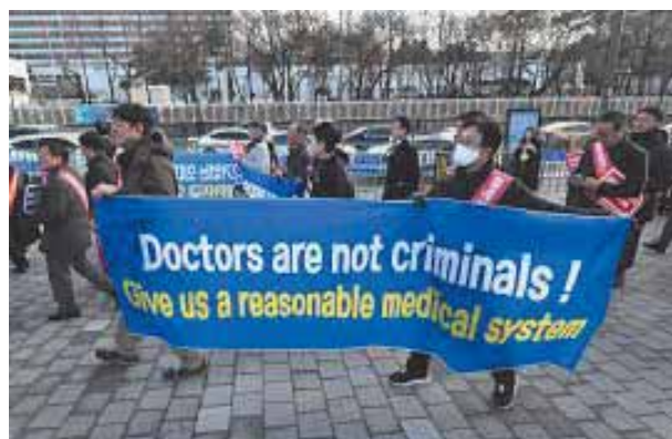
emergency and serious patients and restore a training system to add more professional doctors. More than 13,000 junior doctors, who are medical interns and residents, walked off the job in February in protest of the government's plan to sharply boost school admissions. Their walkouts have significantly burdened operations of university

Seoul (AP): South Korea said Monday it'll withdraw its earlier plan to suspend licenses of striking doctors as part of its efforts to resolve the country's months-long medical impasse. It wasn't immediately known whether and how many of thousands of the striking doctors would return to work in the wake of the government's announcement. Also, the plan could invite criticism that it hurts the principle of fairness over the government's dealing with other previous labour strikes as well as doctors who already returned to work. Health Minister Cho Kyoo-hong said Monday the government has decided not to suspend their licenses of the strikers, regardless of whether they return to their hospitals or not. He said the government's decision is meant to address a shortage of doctors treating