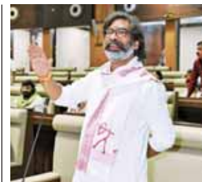
Jharkhand Chief Minister Hemant Soren speaks during a Special Session of the State Legislative Assembly, held in Ranchi on Monday

"There is movement of vehicles on Eastern and Western express highways and all railway lines. NDRF teams have reached all three coastal districts in the state. Army, Navy and Air Force are also on alert," Shinde said.