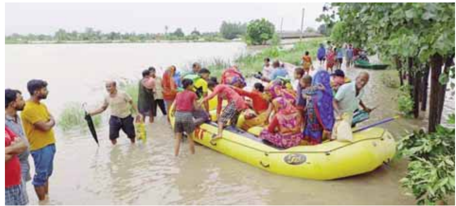
from Rishikesh to rescue the people who got trapped on the roofs of their submerged areas in

Nagar at 4 AM as a backup. The SDRF rescued about 300 people stranded in Chhatarpur in Khatima area through rafts and dropped them to safe places. The backup team from Rishikesh took charge in Arvindnagar and Sitarganj areas and rescued over 170 people who were shifted to safe places by the respective district administration. The SDRF also rescued 30 persons