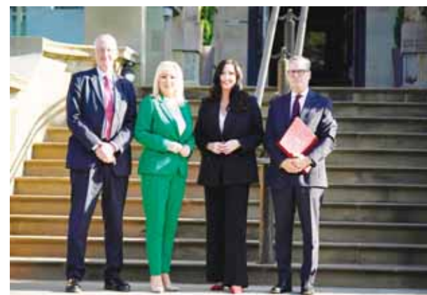
From left, Northern Ireland Secretary Hilary Benn, Northern Ireland's First Minister Michelle O'Neill, deputy First Minister Emma Little-Pengelly and Britain's Prime Minister Keir Starmer pose for a photo, at Stormont Castle, during the Prime Minister's tour of the UK following Labour's victory in the 2024 general election, in Belfast, Monday.

British Prime Minister Keir Starmer is seeking to reset relations at home and abroad. During a visit on Sunday to Edinburgh, that he billed as an "immediate reset" with the regional governments of Scotland, Northern Ireland and Wales, Starmer said he would also seek to improve the UK's "botched" trade deal with the European Union (EU). "I do think that we can get a much better deal than the botched deal that (former prime minister) Boris Johnson saddled the UK with," he said in reference to the pact negotiated after Brexit. Starmer said there were many discussions ahead to strengthen trading, research and defence ties with the EU. But he said those talks had begun as his top diplomat made his first visit abroad to Germany, Poland and Sweden.