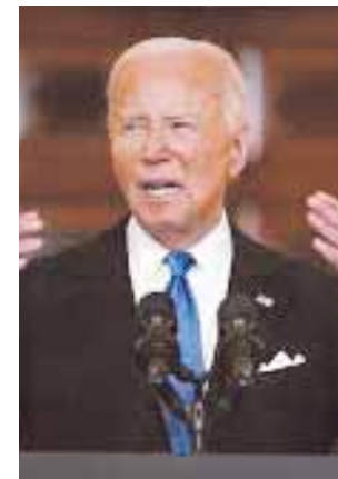
"I'm about to host the NATO nations in Washington. We put them together," Biden said. "The world's looking to us. Not a joke. The world is looking to America not to carry their burden, but to lead their hopes." Being held in the American capital, soon after Prime Minister Narendra Modi had a summit meeting with Russian President Vladimir Putin in Moscow, the NATO summit, officials said "will send a strong signal to Putin that if he thinks he can outlast the coalition of

The NATO summit, being hosted by US President Joe Biden here this week, is likely to show a strong demonstration of America and its allies' support for Ukraine and make significant new announcements to increase military, political and financial support for the war-torn European country, according to administration officials. The three-day NATO summit to be held here from July 9 to 11 will be the first to include Sweden as a member of the alliance. Sweden officially joined the alliance in March. The historic summit would also mark the 75th anniversary of the founding of the North Atlantic Treaty Organisation (NATO), which is now a strong military alliance of 32 countries. "It has been truly indispensable to Euro-Atlantic security, deterring threats to the United States and our allies," a senior administration official told reporters ahead of the summit. On Sunday, President Biden also spoke about the upcoming NATO summit in Washington, DC.