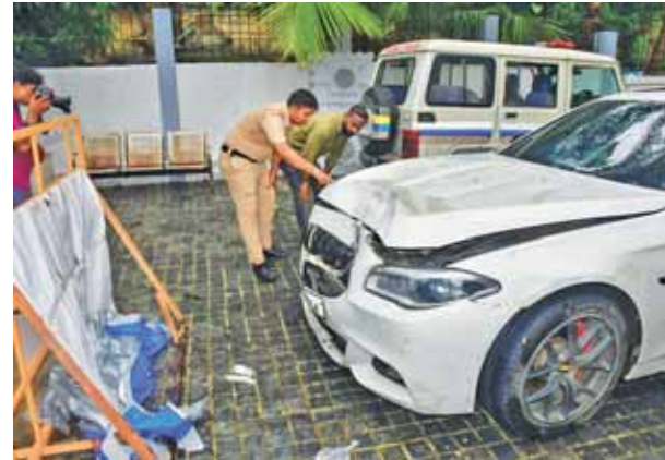
A damaged BMW car that was involved in a hit-and-run case, parked on the premises of Worli police station, in Mumbai, on Sunday