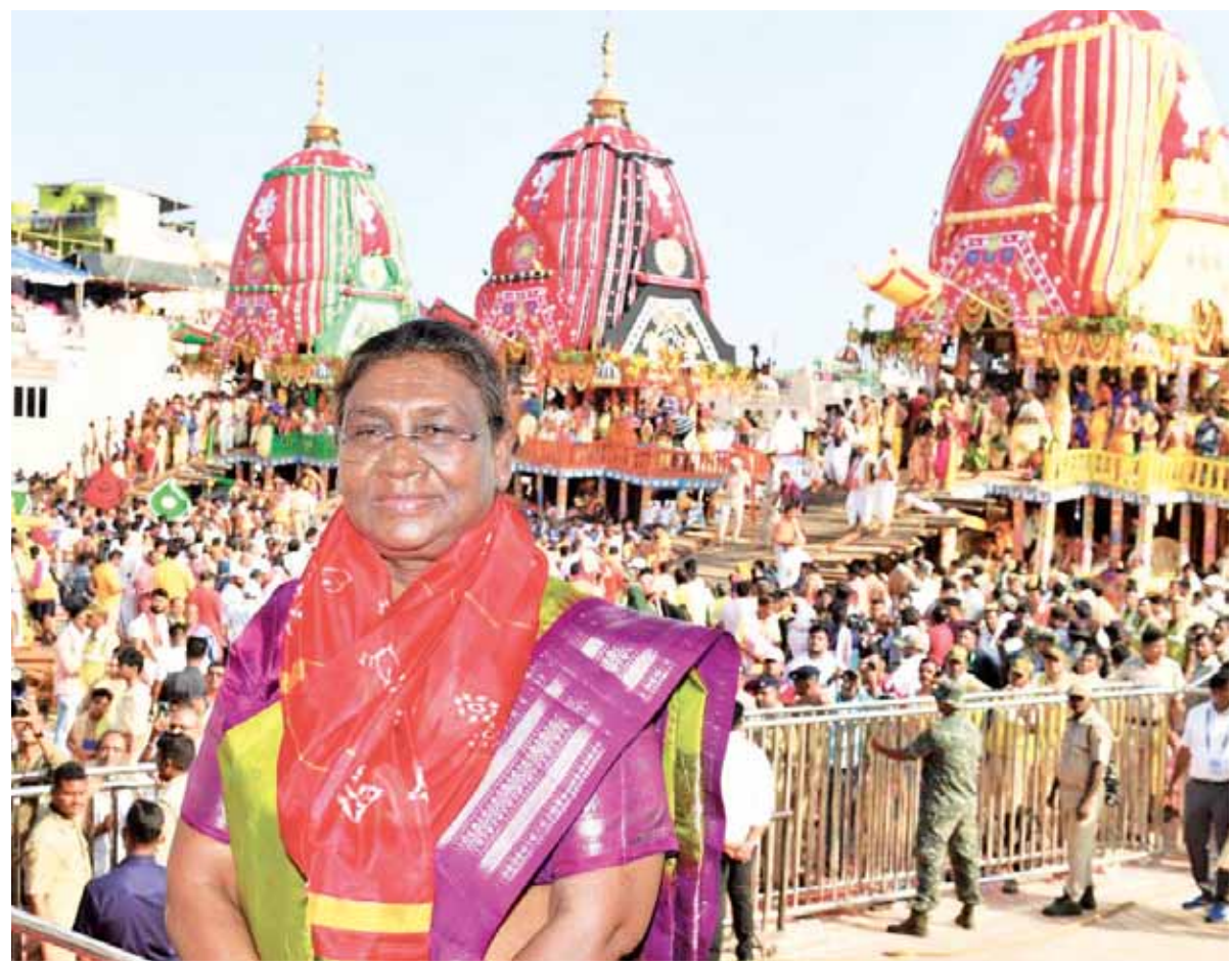
President Droupadi Murmu during the annual Rath Yatra in Puri on Sunday