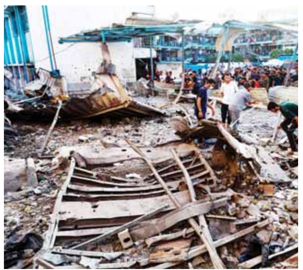
Palestinians look at the aftermath of the Israeli airstrike on a U.N.-run school that killed dozens of people in the Nusseirat refugee camp in the Gaza Strip on Saturday.

Marking nine months since the war in Gaza started, Israeli protesters blocked highways across the country Sunday, calling on Prime Minister Benjamin Netanyahu to step down and pushing for a ceasefire that could bring back the hostages held by Hamas. The demonstrations come as international mediators have renewed efforts to broker a deal. Hamas over the weekend appeared to have dropped a key demand for an Israeli commitment to end the war, according to Egyptian and Hamas officials who spoke to The Associated Press. The war, triggered by the Palestinian militant group following a cross-border attack on October 7, saw 1,200 people killed and 250 others taken hostage. A retaliatory Israeli air and ground offensive has killed over 38,000 Palestinians, according to the territory's Health Ministry, which does not distinguish between combatants and civilians in its count. Sunday's "Day of Disruption"