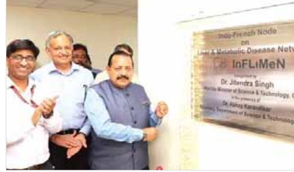
Dr Jitendra Singh launches Indo-French Liver And Metabolic Disease Network (InFLiMeN) at ILBS recently.

There is an urgent need to develop simple, low-cost diagnostic tests for the detection of different stages of fatty liver and their progression to severe, full-blown diseases. The approaches and algorithms should suit the Indian context, low-priced, and have a point of care, said Union Minister Dr Jitendra Singh who is himself a Diabetologist. Every third Indian has fatty liver, which predates Type 2 Diabetes and other metabolic disorders, said Dr Singh after launching an Indo-French Liver and Metabolic Disease Network (InFLiMeN) a virtual node to prevent and cure metabolic liver diseases at Institute of Liver and Biliary Sciences (ILBS) in Delhi recently.