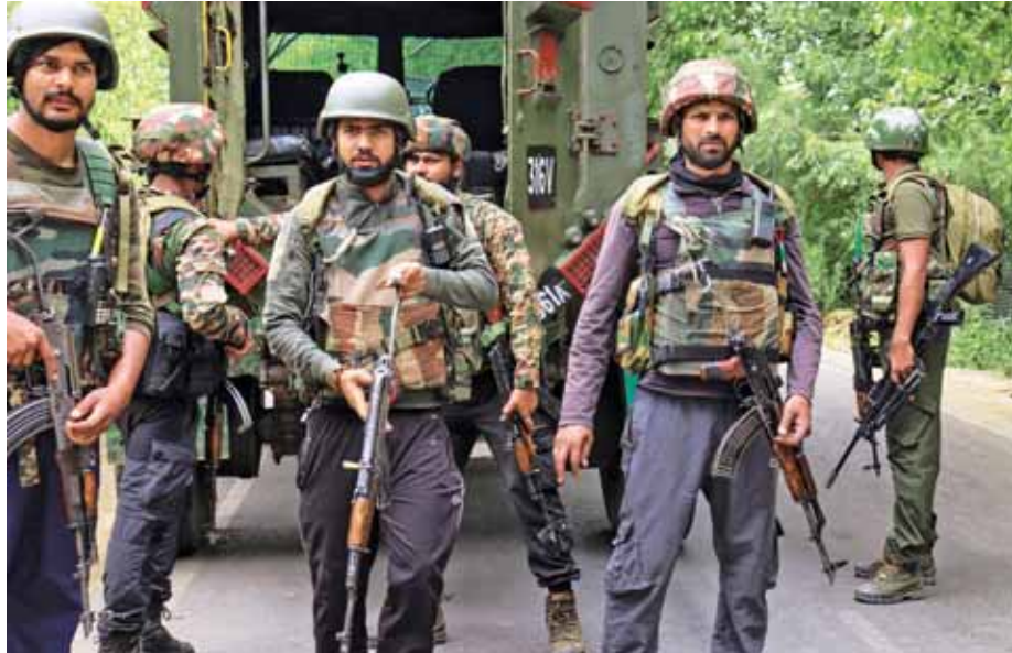
Security personnel stand guard during an encounter with terrorists in Kulgam

Six terrorists have been neutralised in the ongoing operations. DGP maintained this is a big milestone for the security forces and these successes matter in strengthening the security