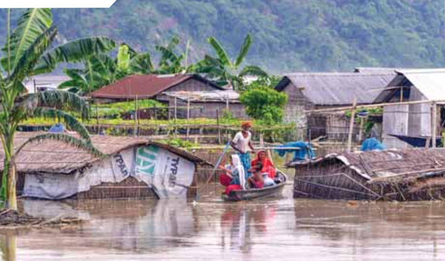
Locals move their belongings on a boat as they move to a safer place during floods, in Darrang district.