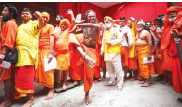
A sadhu poses while waiting to get registered for Amarnath Yatra at Ram Mandir base camp, in Jammu, on Friday