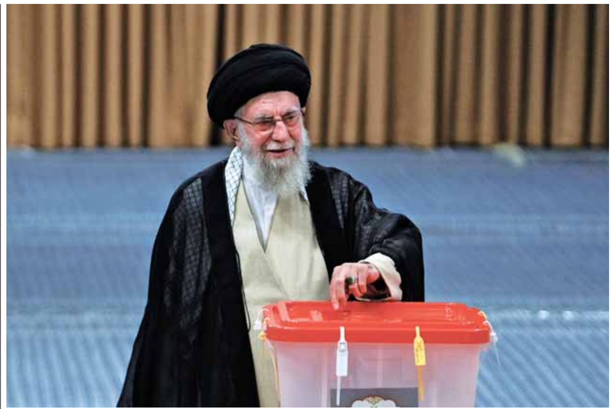
Iranian Supreme Leader Ayatollah Ali Khamenei casts his vote for the presidential runoff election in Tehran, Iran, Friday, July 5, 2024. Iranians began voting Friday in a runoff election to replace the late President Ebrahim Raisi, killed in a helicopter crash last month, as public apathy has become pervasive in the Islamic Republic after years of economic woes, mass protests and tensions in the Middle East

About 98.3 per cent of its 1.34 million population is Catholic, according to the 2022 census, and it's the Asian country with the highest proportion of Catholics after the Philippines.