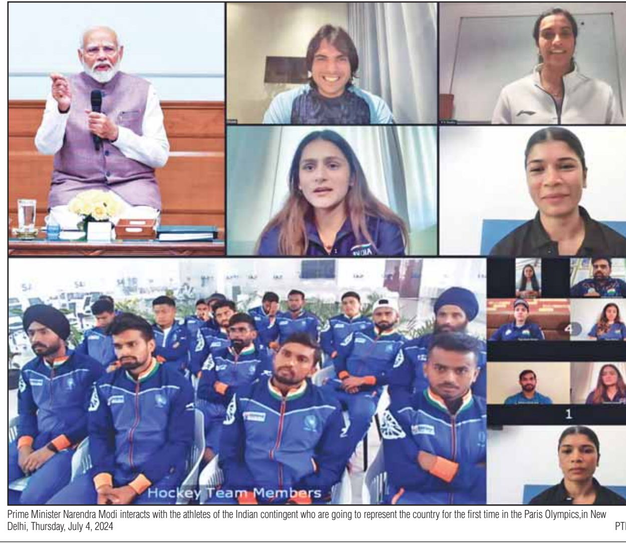
Prime Minister Narendra Modi interacts with the athletes of the Indian contingent who are going to represent the country for the first time in the Paris Olympics, in New Delhi, Thursday, July 4, 2024

PTI ■ NEW DELHI Confident that India's bid to host the 2036 Olympics will be successful, Prime Minister Narendra Modi has urged athletes bound for this month's Paris Games to share their views on the arrangements in the French capital to help his government's ambitious plan to bring the quadrennial showpiece here. In an interaction with Paris-bound athletes, conducted both in person and online on Thursday, Modi said those travelling to the French capital would do the country a huge service by providing inputs from their experience. "We are hoping to host the Olympics in 2036, it will help in creating a sporting atmosphere (in the country). Work is in progress to prepare infrastructure for it," he said in the interaction, which was attended by the national men's hockey team, the shooting contingent, boxers and track-and-field stars such as Neeraj Chopra among others. The complete video of the PM's light-hearted conversation with the athletes was shared by his office on Friday. The meeting with the contingent was also attended by sports minister Mansukh Mandaviya and Indian Olympic Association (IAO)