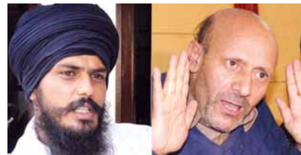
Sikh preacher Amritpal Singh and Kashmiri leader Sheikh Abdul Rashid

Jailed radical Sikh preacher Amritpal Singh and Kashmiri leader Sheikh Abdul Rashid, who were granted parole to take oath as members of the Lok Sabha, were sworn in as MPs on Friday, amid heavy deployment of security personnel in and around the Parliament complex. While Rashid, popularly known as Engineer Rashid, is in Delhi's Tihar jail in a terror-funding case registered under the Unlawful Activities (Prevention) Act, Singh is lodged in a prison in Assam's Dibrugarh district for offences under the National Security Act. They were brought to the Parliament complex by