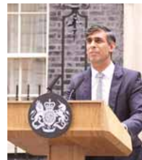
Britain's Labour Party leader Keir Starmer reacts on stage as he is elected for the Holborn and St Pancras constituency, in London (l). Britain's outgoing Conservative Party Prime Minister Rishi Sunak speaking outside 10 Downing Street before going to see King Charles III to tender his resignation in London, on Friday