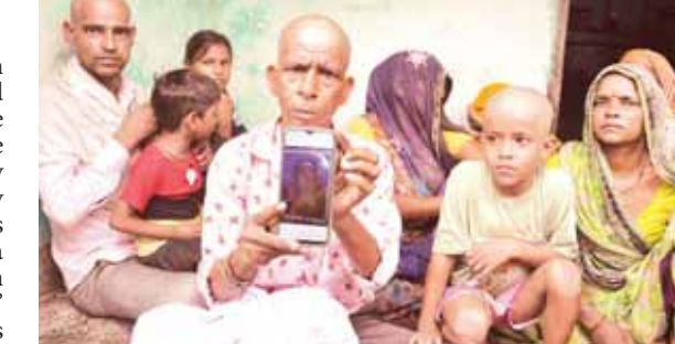
Family members sitting at a house after the Hathras stampede. Over 120 people were killed and several injured in the stampede, according to officials