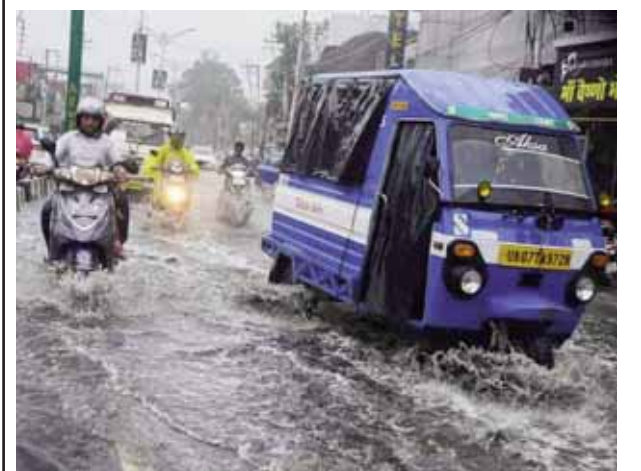
Vehicles pass through waterlogged Prince Chowk in Dehradun on Tuesday

disaster control room of the corporation had also received 10 complaints of waterlogging from areas including Balawala, Dilaram Chowk, Nehrugram