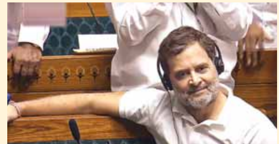
Leader of Opposition in Lok Sabha Rahul Gandhi during Prime Minister Narendra Modi's reply to the Motion of Thanks on the President's Address, in New Delhi on Tuesday

"Whatever I had to say, I have said and that is the truth. They can expunge as much as they want, but the truth will prevail," Rahul told reporters in Parliament