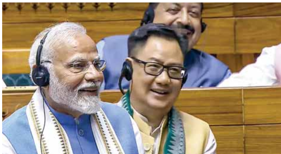
Prime Minister Narendra Modi reacts as he replies to the Motion of Thanks on the President's Address in the Lok Sabha during the ongoing Parliament session, in New Delhi, on Tuesday

"Images of our Gods cannot be used for personal political interests. They coined phrases like 'Hindu terrorism', their ally likened this religion to dengue; country will never forgive them," Modi said taking a swipe on Rahul's