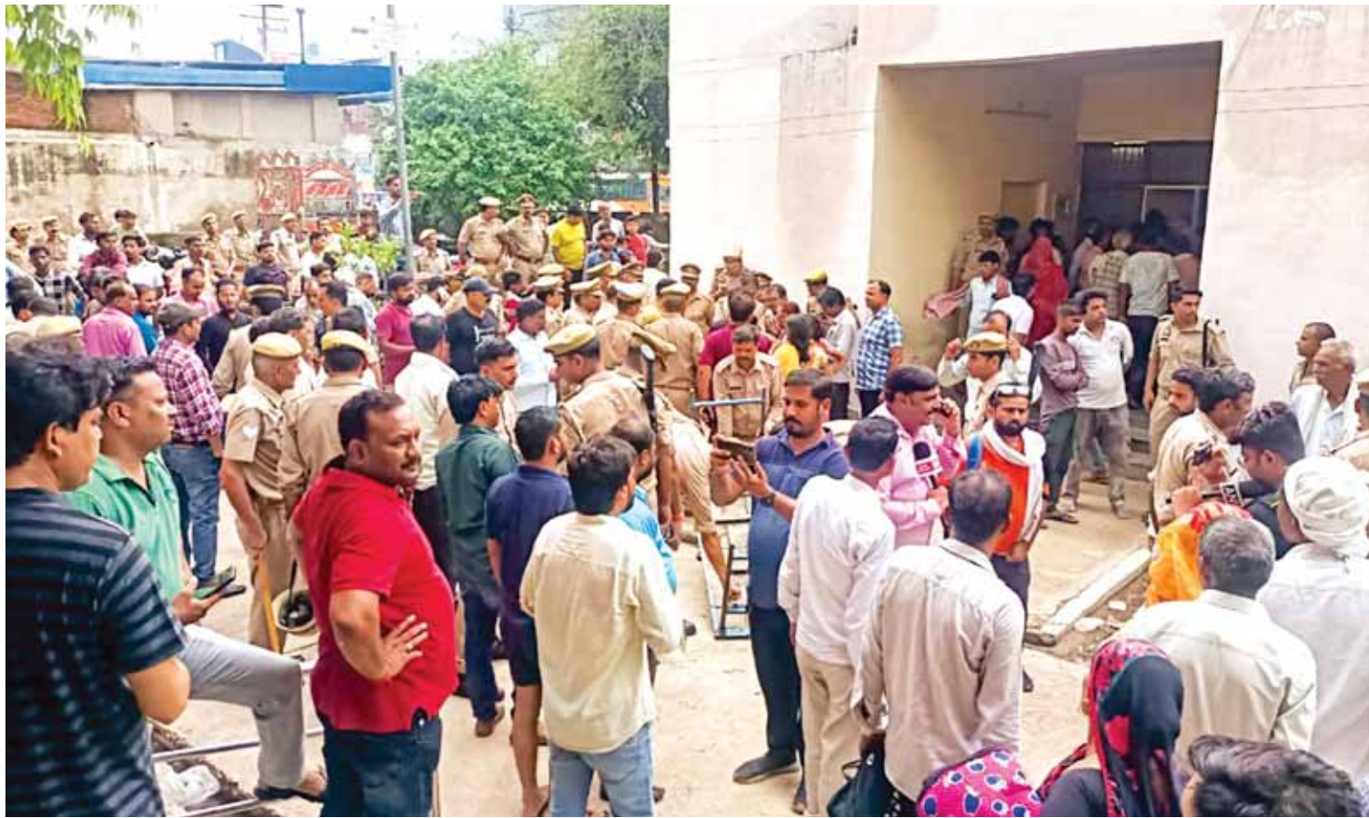
Relatives outside a hospital where victims of the Hathras' stampede are admitted, in Etah, on Tuesday. Many people were killed and several injured in the stampede, according to officials

In a statement from the UP CM Office, Yogi also wished for the speedy recovery of the injured. He directed the district administration officials to ensure that the injured receive proper treatment and to expedite relief efforts on-site. An investigation into the causes of the incident was