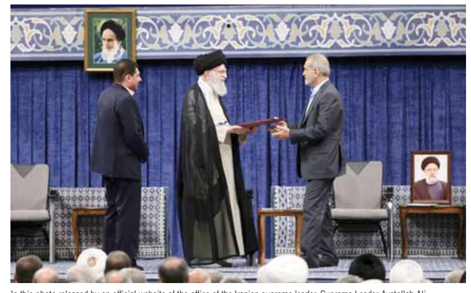
In this photo released by an official website of the office of the Iranian supreme leader, Supreme Leader Ayatollah Ali Khamenei, centre, gives his official seal of approval to newly elected President Masoud Pezeshkian, as acting President Mohammad Mokhber stands at left, in an endorsement ceremony in Tehran, Iran, on Sunday