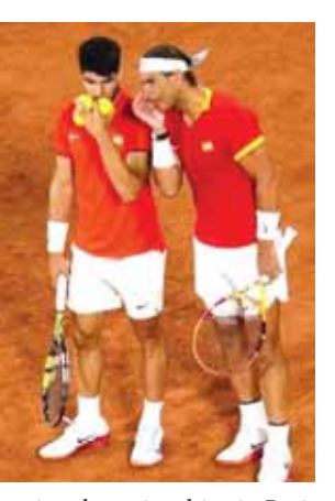
major championships in Paris and grabbed the last four games to beat Romania's Irina-Camelia Begu 6-2, 7-5, while reigning French Open

and owns two Summer Games golds, was a surprise torch carrier during the rain-soaked opening ceremony along the Seine River on Friday night. He won his doubles opener alongside Alcaraz on Saturday night. Nadal has not made entirely clear whether or not these Summer Games will be the final event of his career. He is 38 and has been dealing with injuries for much of the past two seasons. Nadal and Alcaraz never had played doubles together, but they got past the sixth-seeded Argentine duo of Maximo Gonzalez and Andres Molteni 7-6 (4), 6-4. The No. 1-ranked Swiatek claimed four of her five career