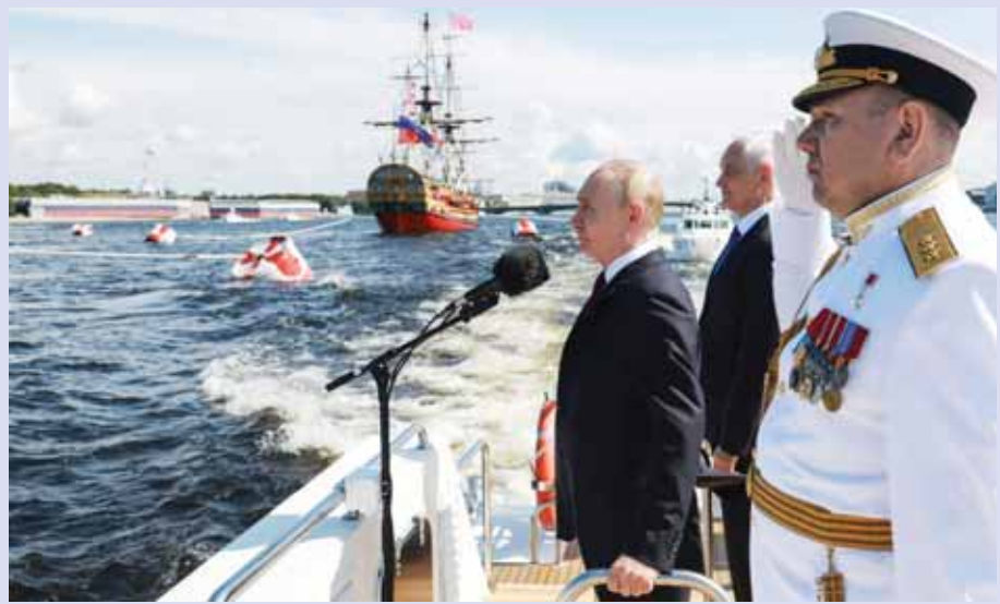
Russian President Vladimir Putin, centre, Russian Defense Minister Andrei Belousov, second right, and Russian Navy Commander-in-Chief Admiral Alexander Moiseyev, right, greet sailors prior to the main naval parade marking Russian Navy Day in St. Petersburg, Russia, on Sunday

tests that violated it. The allegations, which Russia denied, came as tensions mounted between Moscow and the West in the wake of the