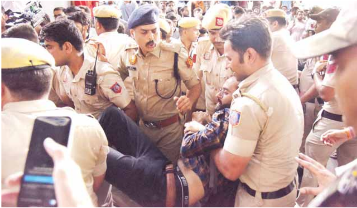
Police detain students protesting outside Karol Bagh metro station after three IAS aspirants died in the basement of Rau's IAS Study Circle at Old Rajinder Nagar area, in New Delhi, on Sunday

Phones kept buzzing with messages on WhatsApp groups with helpless students trying to find where their friends — studying at the Rau's Coaching centre's library on Saturday evening — were following the death of three civil services aspirants due to rain-induced flooding in the basement of the coaching centre. While reports claimed only three lives were lost, students who were witness to the tragic incident unfolding before their eyes claimed a higher number. All the deceased had cleared their preliminary examination, the results of which was declared a few days ago and were burning midnight oil to prepare for the Mains examinations scheduled in October-November which is second stage of Civil Services Examinations to qualify to become an IAS, IPS or allied services officer.