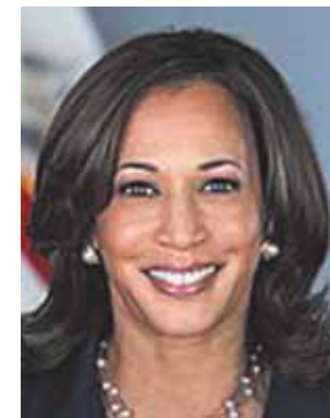
Democrats will officially nominate her for president during a virtual roll call vote early next month.

tial campaign last Sunday, hours after President Joe Biden, 81, withdrew from the race for a second term. She is, however, yet to be officially declared as the presidential candidate by the Democrats.