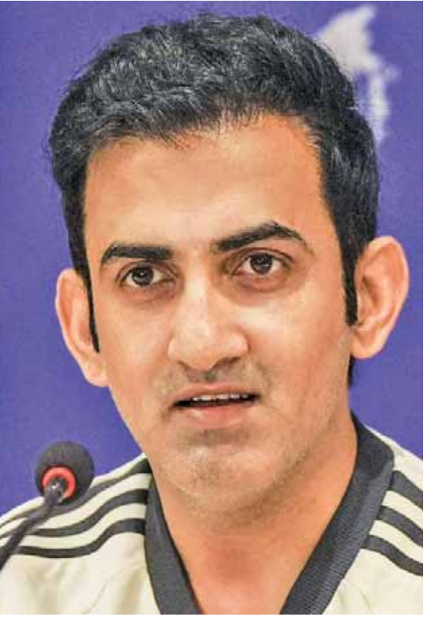
the scrutiny will be intense," he said, also reminding that there will be overwhelming support for him from all quarters. "But even in the worst of times you will never be alone. You will have the support of