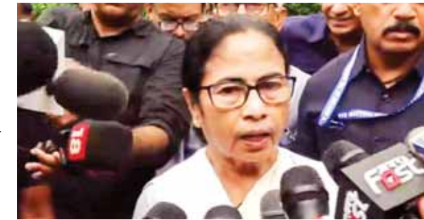
West Bengal Chief Minister Mamata Banerjee interacts with the media after walking out of a NITI Aayog meeting chaired by Prime Minister Narendra Modi, in New Delhi, on Saturday

West Bengal Chief Minister Mamata Banerjee made headlines by walking out of the NITI Aayog meeting. Adding to the political drama was the conspicuous absence of Bihar Chief Minister Nitish Kumar, whose party JD(U) is the second largest in Modi's NDA coalition at the Centre. Intriguingly, Kumar opted to stay in Patna, where he convened a meeting to discuss JD(U)'s prospects for the upcoming Assembly elections in neighbouring Jharkhand, in alliance with the BJP.