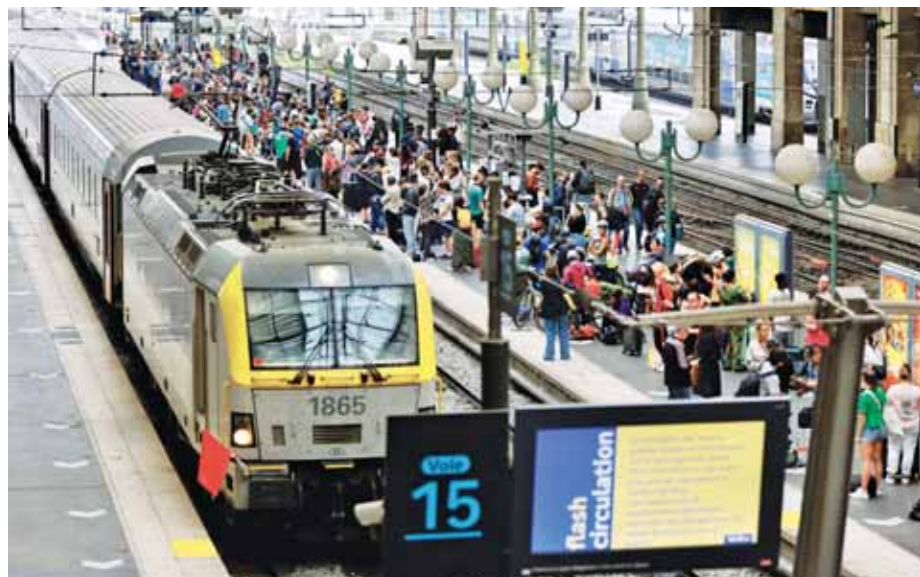
Stranded passengers wait inside Gare du Nord station in Paris, France, on Friday. France's high speed rail network TGV was severely disrupted following a 'massive attack', according to train operator SNCF, just hours before the opening ceremony of the Paris 2024 Olympic games. Around 800,000 passengers are expected to be affected over the weekend

France's high-speed rail network was hit on Friday with widespread and "criminal" acts of vandalism, including arson attacks, paralysing travel to Paris from across the rest of France and Europe only hours before the grand opening ceremony of the Olympics. French officials condemned the attacks as "criminal actions," and prosecutors in Paris opened a national investigation, saying the crimes could carry sentences of 15 to 20 years. As Paris authorities geared up for a spectacular parade on and along the Seine River, three fires were reported near the tracks on the high-speed lines of Atlantique, Nord and Est, causing disruptions that affected hundreds of thousands of travellers.