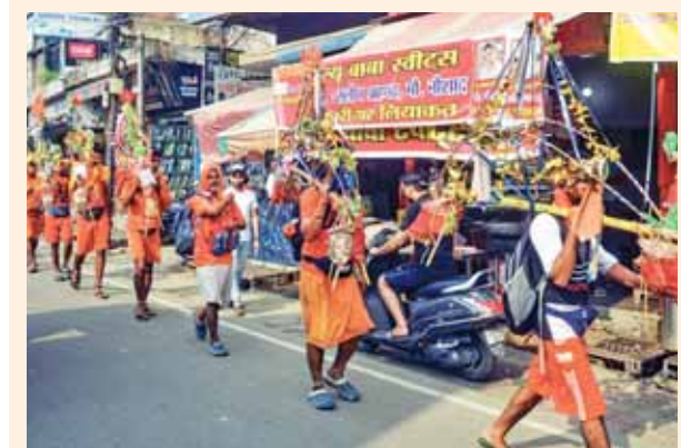
Kanwariyas walk past the shops on which banners with shopkeepers' name were put up on Kanwar Marg after an order issued by Uttar Pradesh Government, in Muzaffarnagar

homage to the bravehearts who made the supreme sacrifice in the line of duty, the Prime Minister said, "Today I am speaking from a place where the masters of terror can hear my voice directly. I want to tell these patrons of terrorism that their nefarious intentions will never succeed. Our soldiers will crush terrorism with full force and the enemy will be given a befitting reply," he added. "India will overcome all challenges that come in the way of development, be it Ladakh or Jammu & Kashmir", the Prime Minister reiterated.