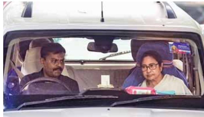
West Bengal Chief Minister Mamata Banerjee arrives at Banga Bhawan, in New Delhi, on Friday

The first meeting of NITI Aayog in the third tenure of Narendra Modi as Prime Minister is to see a "boycott call" by several non-BJP ruled Chief Ministers on Saturday. The meeting to be chaired by Modi will, however, be attended by West Bengal Chief Minister Mamata Banerjee who albeit has called for scrapping of the NITI Aayog and replace it by Planning Commission. Apart from Congress and its alliance-ruled States like Jharkhand, which are part of the INDIA Bloc, declining to attend the crucial meet in the national Capital, Delhi, Punjab, and Kerala have also announced they will not be part of the meeting. Karnataka CM Siddaramaiah, Himachal Pradesh CM Sukhvirinder Singh Sukhu and Telangana's Revanth Reddy have announced they will not attend the meeting over alleged bias against their States in the Union Budget. Tamil Nadu Chief Minister and DMK leader MK Stalin, Kerala's CM and CPI(M) leader Pinarayi Vijayan as well as Aam Aadmi Party (AAP)-led Delhi and Punjab Governments too called to boycott the meeting. "NITI Aayog should be scrapped and Planning Commission should be brought back. Thought it's my duty to raise our voice on common platform even though I know NITI Aayog has no financial power," Mamata said and confirmed to take part in the meeting. She said she will use the opportunity to register her protest against a "discriminatory Budget" and the