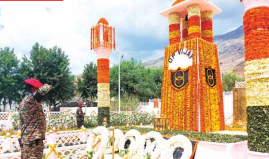
A soldier pays homage at the Kargil War Memorial on the 'Kargil Vijay Diwas', in Drass