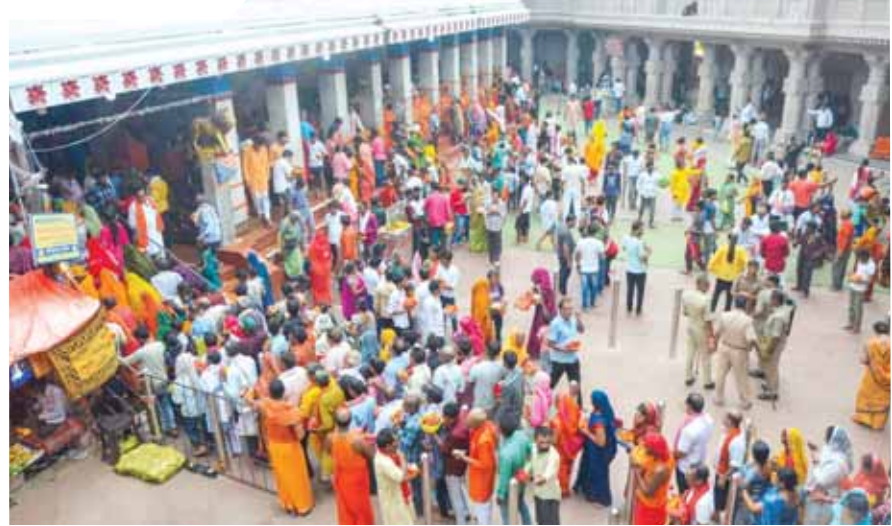
Devotees wait in queues to offer prayers at Vindhyavasini Temple on the occasion of Guru Purnima, in Mirzapur