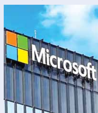
The recent global disaster caused by Microsoft's server outage highlights the need for preparedness against such failures and cyber-attacks. A glitch in the system can play havoc across the world.

The outage disrupted air traffic, banking, TV broadcasting, government and non-government operations, and even emergency services in America. It's ironic that this happened alongside the implementation of new cybersecurity measures, which themselves can jeopardize security. While technology is integral to modern life, the dominance of a few large tech companies poses risks. These firms often impose arbitrary conditions on users and create different rules for different countries. To counteract this, governments must collaborate to curb the monopolies of private digital businesses. Whether major nations can unite against these internet giants is uncertain, but India could take steps in this direction.