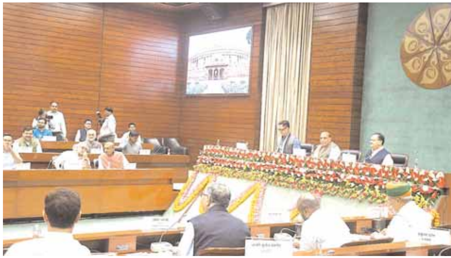
Defence Minister Rajnath Singh, Union Minister for Parliamentary Affairs Kiren Rijiju and Union Minister Jagat Prakash Nadda during the all-party meeting ahead of the Budget session of Parliament, in New Delhi on Sunday

The Monsoon Budget session will have 19 sittings till August 12 when the