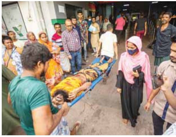
An injured student is carried on a stretcher as students clash with police over the quota system in public service brought to a hospital, in Dhaka, Bangladesh, on Saturday, July 20

Bangladesh's top court on Sunday scaled back a controversial quota system for government job applicants, in a partial victory for student protesters after days of nationwide unrest and deadly clashes between police and demonstrators that have killed scores of people. Students, frustrated by shortages of good jobs, have been demanding an end to a quota that reserved 30% of government jobs for relatives of veterans who fought in Bangladesh's war of independence in 1971. The government previously halted it in 2018 following mass student protests, but in June, Bangladesh's High Court reinstated the quotas and set off a new round of protests.