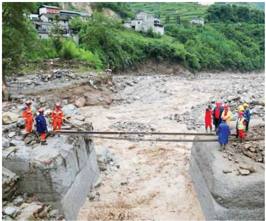
In this image made from video released by Xinhua News Agency, rescue workers set up a temporary crossing in the aftermath of floods in Xinhua Village of Hanyuan County, Ya'an City, southwest China's Sichuan Province, July 20

Department said, adding, "The department allowed for the voluntary departure of non-emergency US government employees and family members." "The Government of Bangladesh has declared a curfew throughout Bangladesh, ordering everyone to stay indoors. The Bangladeshi Army has been deployed throughout the country to reinforce the police. Telecommunications have been interrupted in Dhaka and across the country. Due to the security situation, there may be a delay in provision of routine consular services," the advisory stated. The US State Department said crimes such as muggings, burglaries, assaults, and illegal drug trafficking constitute the majority of criminal activity in Bangladesh's major cities, but there are no indications foreigners are being targeted because of their nationality. These crimes tend to be situational, based on time and location, it said.