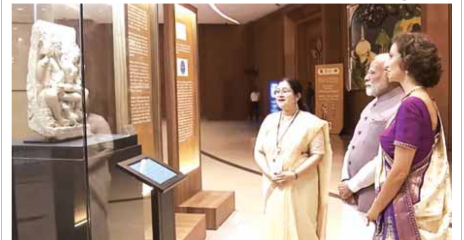
Prime Minister Narendra Modi watches exhibition during the inauguration of the 46th Session of World Heritage Committee, at Bharat Mandapam, in New Delhi, Sunday