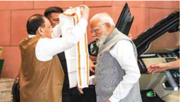
Prime Minister Narendra Modi being welcomed by Union Minister and BJP President JP Nadda as he arrives to meet party workers at the BJP headquarters, in New Delhi,