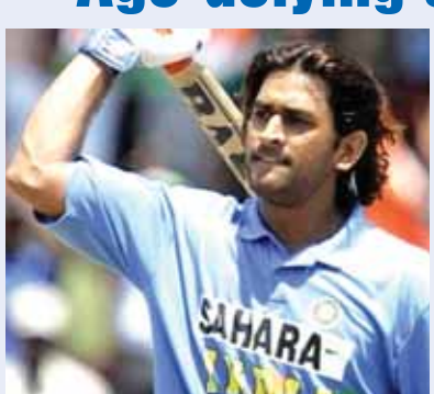
f technology is rapidly transforming our lives, can we overlook the role Lof competitive sports? Uncertainty is the only constant in world-class sporting events. Recent years have shown that age is no barrier to success.

students. Instead, offer alternatives such as arts, computers, and English literature. This approach is especially considerate for students from families frequently relocated due to transfers, sparing them the burden of learning multiple new languages. Prioritizing scientific subjects will benefit both the nation and the world in the future. Moreover, emotional ties to language should not lead to interstate conflicts or frequent changes in the names of streets, villages, towns, cities, and states, as this results in unnecessary expenditures and administrative confusion. Language should serve as a tool for communication, fostering a civilized, scientifically advanced, and happy society characterized by excellent health, peace, prosperity, progress, and success. An inclusive and optimistic outlook, embracing the principle of "live and let live," is essential for universal development. By prioritizing practical education and unity, we can ensure a brighter future for all.