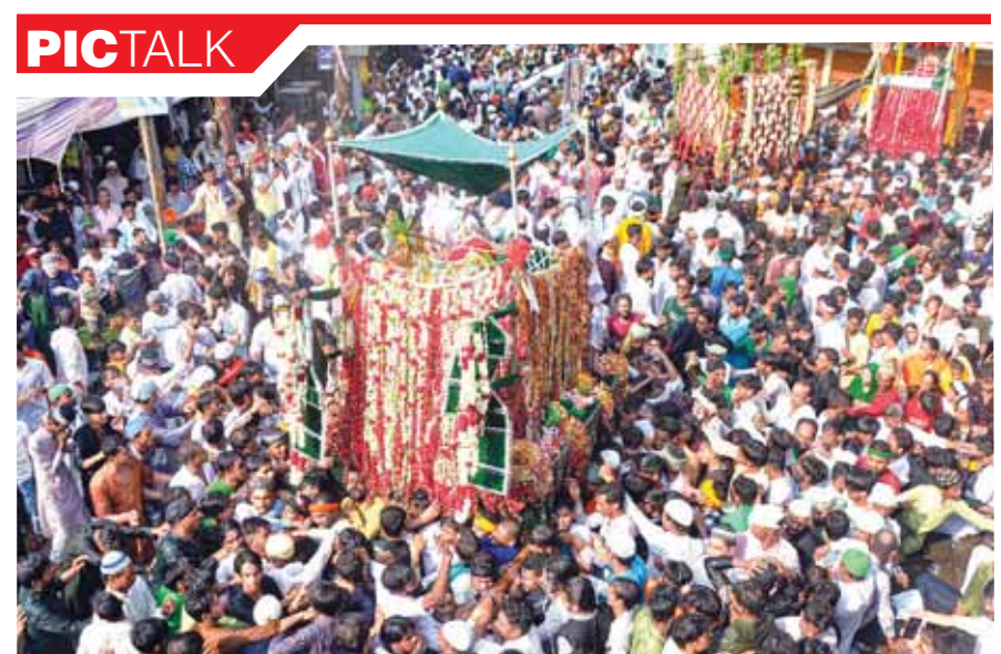
hia Muslim mourners participate in an Ashura (10th Muharram) procession, in Mirzapur

bill raised concerns about increasing regionalism and social tensions. It was feared that such a policy could create divisions between locals and non-locals, leading to a less cohesive society and potential conflicts. According to a report by the Federation of Indian Chambers of Commerce (FICCI), Karnataka's overall unemployment rate is 2.7%, which is lower than the national average of 4.2%. But these figures hide the low employability of the local populace. But to correct it with populist measures is not the best solution. Instead of mandating job reservations, the Government should focus on improving education and skill development programs for locals. Enhancing the quality of education and providing better vocational training could empower local youth to compete effectively in the job market. Now that the bill has been withdrawn it could come back later in a different form. The decision to put the bill on hold has significant political implications. The Karnataka Government has averted a standoff with the IT industry and other businesses but it may disappoint its support base which was expecting job opportunities. Nonetheless, suspending the bill will likely reassure businesses and investors. But the Government will have to focus on providing employable skills to locals, so that they could get employment in Karnataka's IT industry.