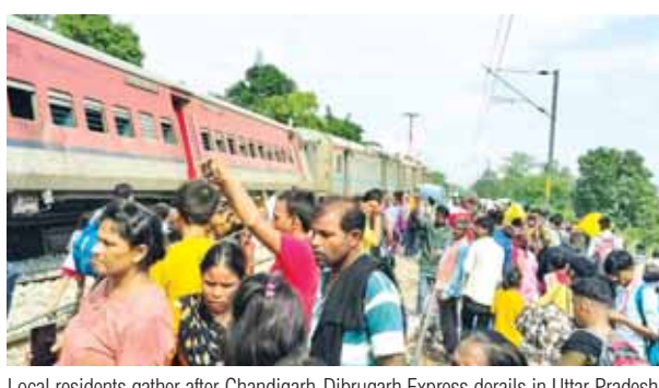
Local residents gather after Chandigarh-Dibrugarh Express derails in Uttar Pradesh

It also said material collected by the Bihar Police and the report of its Economic Offences Wing (EOW), before the investigation was taken over by the CBI, shall be filed in the court by 5 pm on July 20. At the outset, the bench said it has prioritised the hearing on the pleas over other cases as these have 'social ramifications" and lakhs of students are waiting for the outcome.