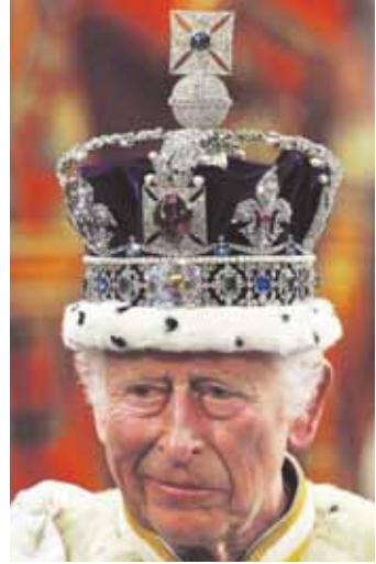
Britain's King Charles wears the Imperial State Crown on the day of the State Opening of Parliament at the Palace of Westminster in London, on Wednesday.

building to nationalising Britain's railways and decarbonizing the nation's power supply with a publicly-owned green energy firm, Great British Energy. The government said it would "get Britain building," setting up a National Wealth Fund and rewriting planning rules that stop new homes and infrastructure being built. Economic measures included tighter rules governing corporations and a law to ensure all government budgets get advance independent scrutiny. That aims to avoid a repetition of the chaos sparked in 2022 by then-Prime Minister Liz Truss, whose package of uncapped tax cuts rocked the British economy and ended her brief term in office. The government promised stronger protections for workers, with a ban on some "zero-hours" contracts and a higher minimum wage for many employees. Also announced were protections for renters against shoddy housing, sudden eviction and landlords who won't let them have a pet. The government promised more