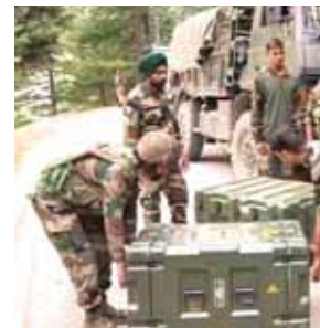
Security personnel amid heavy security near the site of a recent encounter with terrorists at Desa village, in Doda district, on Wednesday

Security forces have mobilised a large number of troops to pin down the foreign terrorists on the prowl in the Doda forest area of Doda. Four Army personnel, including one Captain, were martyred in the fierce gunfight in the same zone late Monday night following which these searches were launched across the hilly areas. It is learnt the terrorists had fled the area after targeting the Army personnel. According to local reports, while the joint teams were combing the area a brief exchange of fire took place on two occasions within a span of three to four hours late Tuesday night. The alert Village Defence Guards (VDGs) reportedly opened fire on observing suspicious movement outside their village, while two explosive shells were recovered from the Gandoh area. The exchange of fire was first reported at Kalaan Bhata at 10.45 pm on Tuesday and then near Panchan Bhata at 2 am during the ongoing anti-terrorist operation in the Desa forest area. Despite the challenging terrain and weather conditions, efforts are underway to track down and neutralise the terrorists who