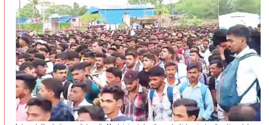
A stampede-like situation prevailed near the Mumbai airport where thousands of job aspirants gathered to apply for a limited number of vacancies for the post of loader though the police on Wednesday claimed they had made adequate arrangements to avoid any untoward incident