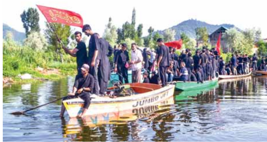
Shia mourners participate in the 9th Muharram procession, on boats, at Dal Lake, in Srinagar