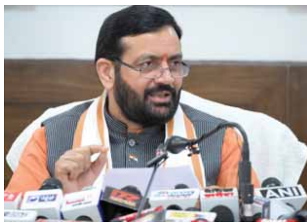
Haryana Chief Minister, Nayab Singh Saini addressing a news conference in Chandigarh on Wednesday.

He also announced sops for industrial units employing Agniveers. "If any industrial unit employs an Agniveer at a salary of more than Rs 30,000 per month, then our government will give that unit an annual subsidy of Rs 60,000," Saini said. Saini also