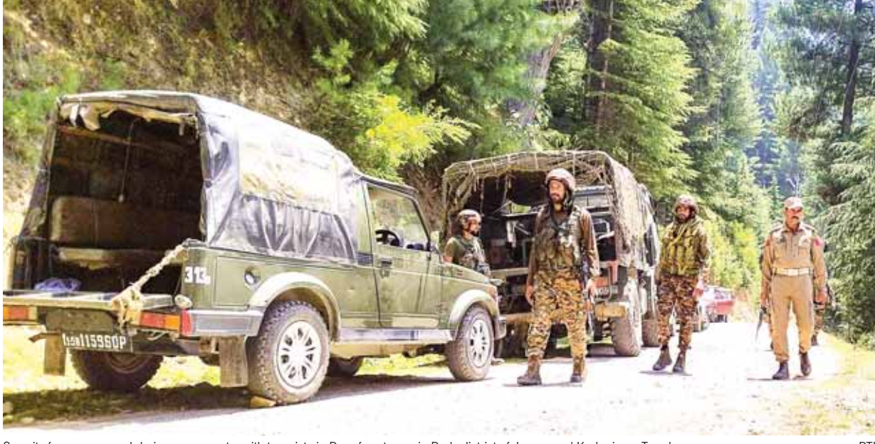
Security forces personnel during an encounter with terrorists in Desa forest area, in Doda district of Jammu and Kashmir, on Tuesday

The Indian Army, however, maintained that a joint operation with J&K Police was launched in the general area of Urarbaggi, 10 km North of Doda. At about 8.40 pm on Monday, the search party was able to establish