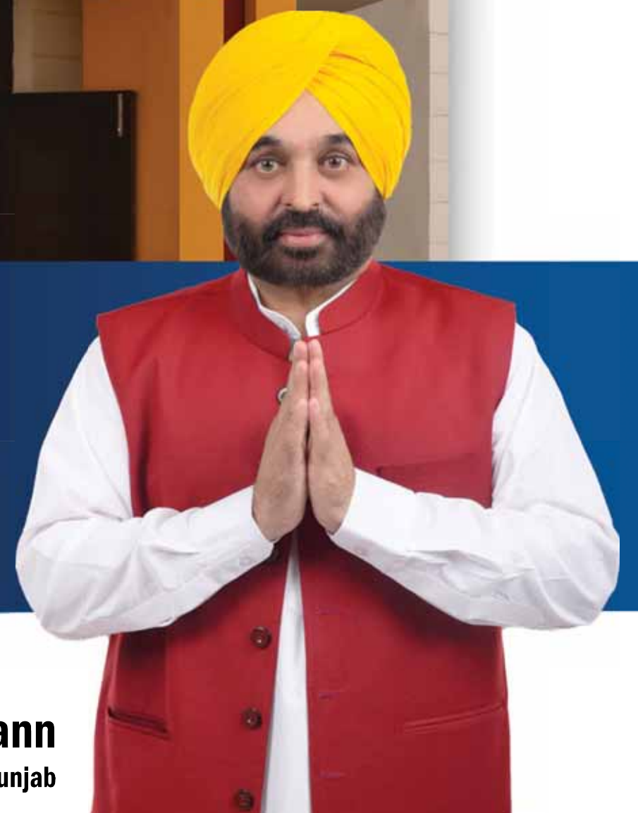
Bhagwant Singh Mann Chief Minister, Punjab