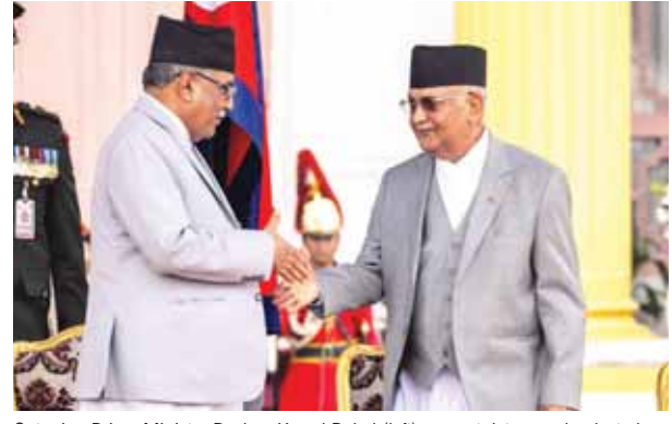
Outgoing Prime Minister Pushpa Kamal Dahal (left) congratulates newly-elected Prime Minister Khadga Prasad Oli (right) after the oath of office at the Presidential residence in Kathmandu on Monday.

KP Sharma Oli on Monday was sworn in as Nepal's Prime Minister for the fourth time to lead a new coalition government that faces the daunting challenge of providing political stability in the Himalayan nation. The leader of Nepal's largest communist party was appointed as prime minister on Sunday by President Ram Chandra Paudel to lead the coalition government with the Nepali Congress (NC), the largest party in Parliament, apart from other smaller parties.