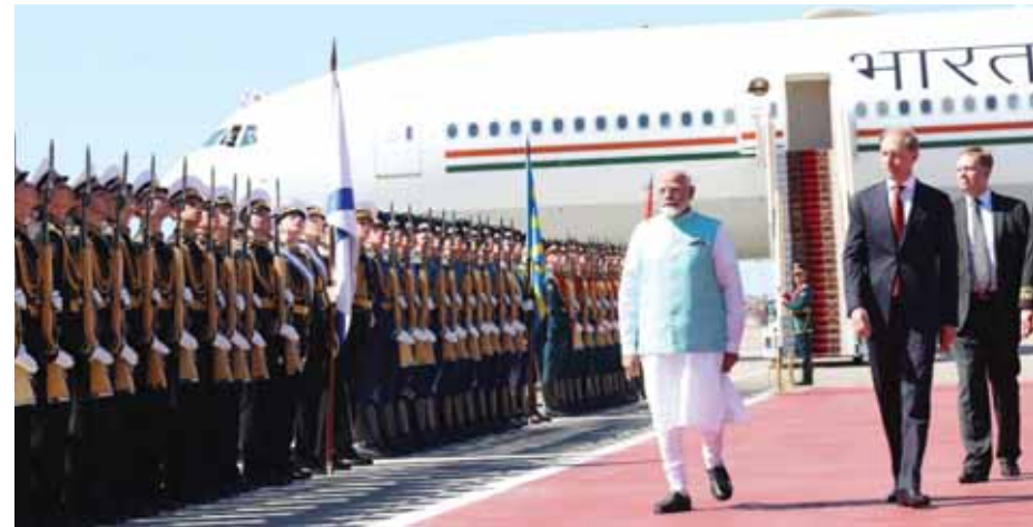
Prime Minister Narendra Modi receives a guard of honour upon his arrival at the airport in Moscow on Monday

the untainted students". "In a situation where breach affects the entirety of process and it is not possible to segregate the beneficiaries from others, it may be necessary to order a re-test," the bench said. The court said if the sanctity of NEET-UG 2024 is "lost" and if the leak of its question paper has been propagated through social media, then a re-test has to be ordered. The bench said the extent of question paper leak and the beneficiaries across geographical boundaries have to be ascertained before the top court may order a re-test in the controversy-ridden exam which was taken up by 23.33 lakh students at 4,750 centres in 571 cities including in 14 cities overseas.