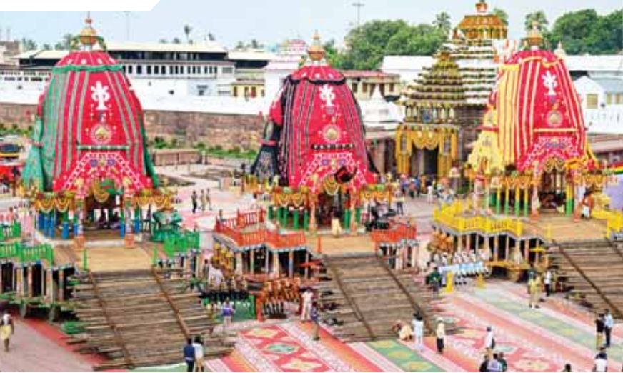
The chariots of Lord Jagannath, Balabhadra and Devi Subhadra prepared for annual Rath Yatra festival, in Puri