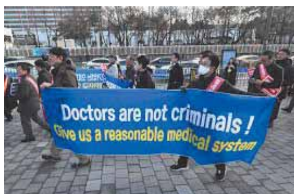
emergency and serious patients and restore a training system to add more professional doctors. More than 13,000 junior doctors, who are medical interns and residents, walked off the job in February in protest of the government's plan to sharply boost school admissions. Their walkouts have significantly burdened operations of university

Seoul (AP): South Korea said Monday it'll withdraw its earlier plan to suspend licenses of striking doctors as part of its efforts to resolve the country's months-long medical impasse. It wasn't immediately known whether and how many of thousands of the striking doctors would return to work in the wake of the government's announcement. Also, the plan could invite criticism that it hurts the principle of fairness over the government's dealing with other previous labour strikes as well as doctors who already returned to work. Health Minister Cho Kyoo-hong said Monday the government has decided not to suspend their licenses of the strikers, regardless of whether they return to their hospitals or not. He said the government's decision is meant to address a shortage of doctors treating