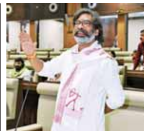
Jharkhand Chief Minister Hemant Soren speaks during a Special Session of the State Legislative Assembly, held in Ranchi on Monday

"There is movement of vehicles on Eastern and Western express highways and all railway lines. NDRF teams have reached all three coastal districts in the state. Army, Navy and Air Force are also on alert," Shinde said.