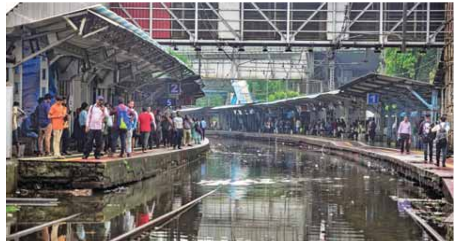
Passengers wait for trains at a waterlogged railway station during rain in Mumbai on Monday

The Powai Lake — one of the major water-supplying lakes of Mumbai — started overflowing during the day. Considered the lifelines of Mumbai, the suburban train services of Central Railway (CR) and Western Railway (WR) were badly hit as the railway track remained thick sheets of water, affecting the operation for the better part of the day. The BrihanMumbai Municipal Corporation (BMC) deployed pumps at several places to clear flood water in low-lying areas in the metropolis. More than 50 flights were cancelled, while 27 were