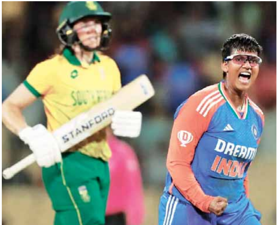
PTI ■ CHENNAI

Desperate to level the three-match series after washed out, India would hope weather doesn't play spoilsport, besides eyeing a much-improved bowling effort in the final women's T20I against South Africa here on Tuesday. India are trailing the three-match series 0-1 after losing the opener by 12 runs. Their problems compounded after the second game here on Sunday was washed out midway due to persistent drizzle. And with 30 to 40 per cent of rain forecast for Tuesday, the Indians are left on the mercy of weather gods.