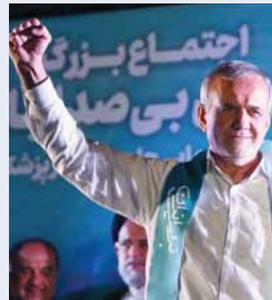
The untimely demise of Iran's conservative President Ebrahim Raisi has necessitated an election amidst regional tensions,