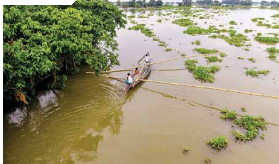
Locals cross a flooded area on a boat, in Balimuk village of Morigaon district