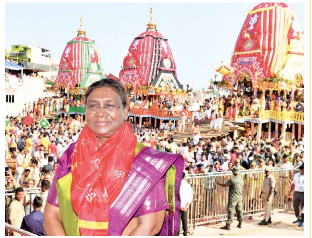
President Droupadi Murmu during the annual Rath Yatra in Puri on Sunday