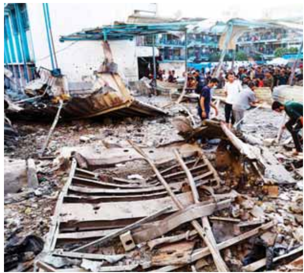
Palestinians look at the aftermath of the Israeli airstrike on a U.N.-run school that killed dozens of people in the Nusseirat refugee camp in the Gaza Strip on Saturday.

Marking nine months since the war in Gaza started, Israeli protesters blocked highways across the country Sunday, calling on Prime Minister Benjamin Netanyahu to step down and pushing for a ceasefire that could bring back the hostages held by Hamas. The demonstrations come as international mediators have renewed efforts to broker a deal. Hamas over the weekend appeared to have dropped a key demand for an Israeli commitment to end the war, according to Egyptian and Hamas officials who spoke to The Associated Press. The war, triggered by the Palestinian militant group following a cross-border attack on October 7, saw 1,200 people killed and 250 others taken hostage. A retaliatory Israeli air and ground offensive has killed over 38,000 Palestinians, according to the territory's Health Ministry, which does not distinguish between combatants and civilians in its count. Sunday's "Day of Disruption"