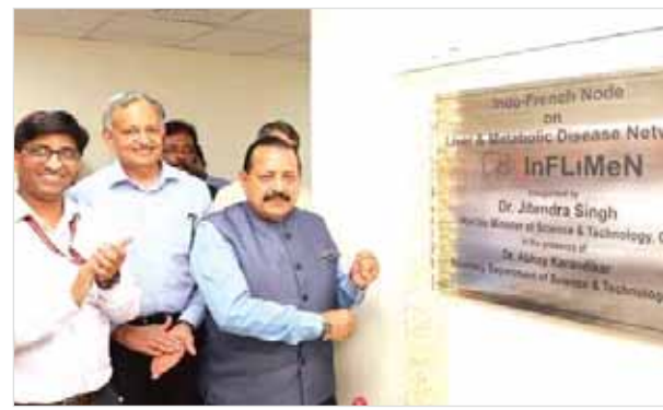
Dr Jitendra Singh launches Indo-French Liver And Metabolic Disease Network (InFLiMeN) at ILBS recently.

There is an urgent need to develop simple, low-cost diagnostic tests for the detection of different stages of fatty liver and their progression to severe, full-blown diseases. The approaches and algorithms should suit the Indian context, low-priced, and have a point of care, said Union Minister Dr Jitendra Singh who is himself a Diabetologist. Every third Indian has fatty liver, which predates Type 2 Diabetes and other metabolic disorders, said Dr Singh after launching an Indo-French Liver and Metabolic Disease Network (InFLiMeN) a virtual node to prevent and cure metabolic liver diseases at Institute of Liver and Biliary Sciences (ILBS) in Delhi recently.