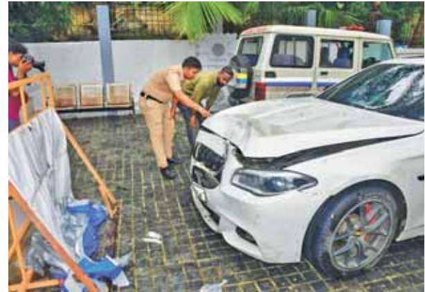
A damaged BMW car that was involved in a hit-and-run case, parked on the premises of Worli police station, in Mumbai, on Sunday