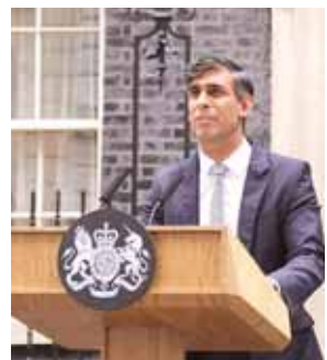
Britain's Labour Party leader Keir Starmer reacts on stage as he is elected for the Holborn and St Pancras constituency, in London (l). Britain's outgoing Conservative Party Prime Minister Rishi Sunak speaking outside 10 Downing Street before going to see King Charles III to tender his resignation in London, on Friday PTI