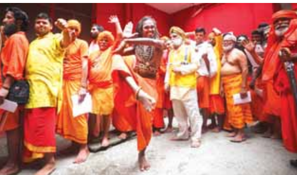
A sadhu poses while waiting to get registered for Amarnath Yatra at Ram Mandir base camp, in Jammu, on Friday