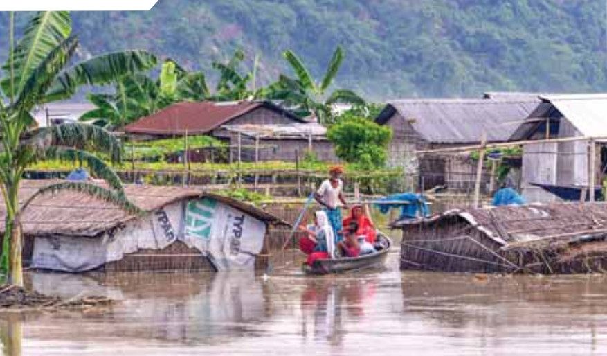
Locals move their belongings on a boat as they move to a safer place during floods, in Darrang district