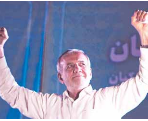
Reformist candidate for the Iran's presidential election Masoud Pezeshkian clenches his fists during a campaign rally in Tehran, Iran

subsidies in 2022, according to the Paris-based International Energy Agency, the most of any country in the world. Iran spent 36 per cent of its overall gross domestic product, or USD 127 billion, that year on oil, electricity and natural gas