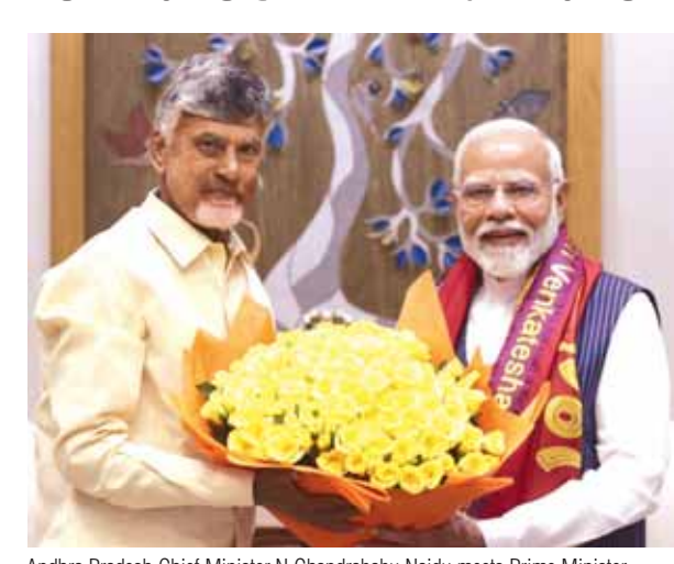
Andhra Pradesh Chief Minister N Chandrababu Naidu meets Prime Minister Narendra Modi in New Delhi on Thursday

"constructive". Naidu's assertion has come a after another significant ally of the NDA, Bihar Chief Minister Nitish Kumar-led JD(U) had pressed for special package and grants for Bihar during the meeting of party's national executive. Sources said during the