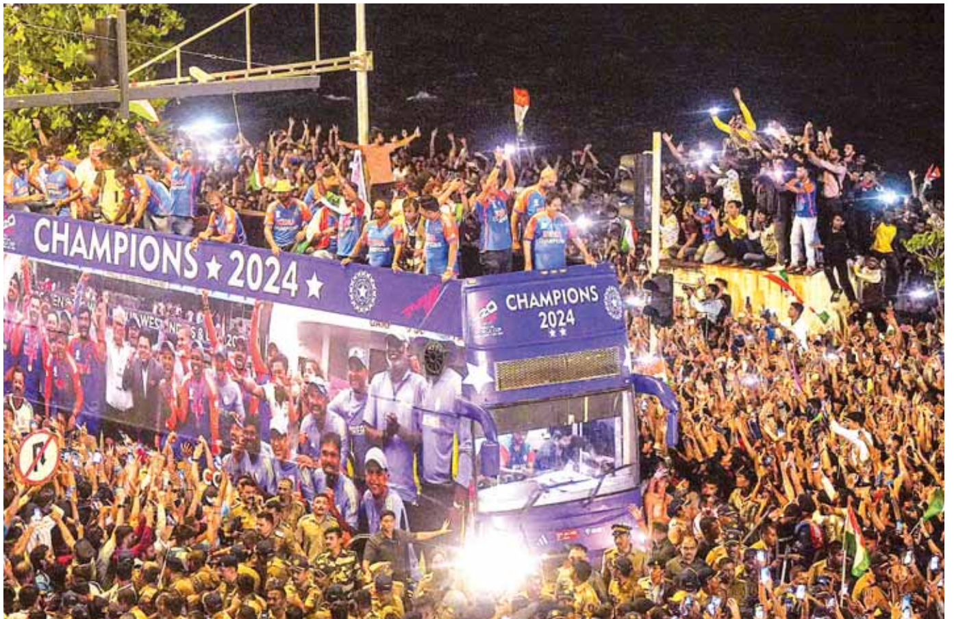
Players of the T20 World Cup-winning Indian cricket team with the championship trophy acknowledge fans during their open bus victory parade, in Mumbai, on Thursday

The Wankhede Stadium here was thrown open to fans, who filled up the stands within minutes to celebrate the Indian