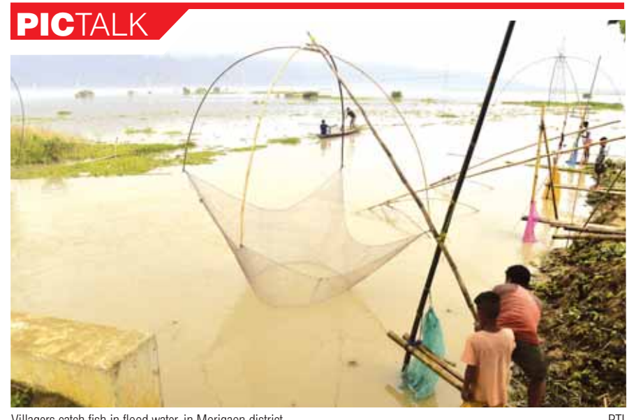
Villagers catch fish in flood water, in Morigaon district

al security. Sunak's message to voters is: build a stronger, more prosperous Britain together. Sunak has vehemently criticised Labour's policies, which left the country vulnerable and economically fragile. He has positioned himself as the leader capable of delivering a balanced approach that protects jobs, supports businesses, and ensures a sustainable path to growth. The Conservative manifesto promises tax cuts, increased investment in infrastructure, and a commitment to maintaining a firm stance on immigration and national security. This of course is a litmus test for Rishi Sunak himself. He became the first Prime Minister of colour itself speaks volumes about his calibre as a politician. But right now the biggest challenge for him is to manage the economy and relieve people of tax burden. On the other side, Keir Starmer's Labour Party is campaigned for change and renewal. Starmer has highlighted the need for comprehensive reform of the welfare system and has promised to tackle the cost-of-living crisis through targeted support for low-income families and significant public sector pay rises. For Rishi Sunak, the election is a chance to solidify his leadership and set a course for a post-Brexit Britain that he believes can thrive globally. The results of this election will not only determine the next government but will also shape the trajectory of the UK for years to come.