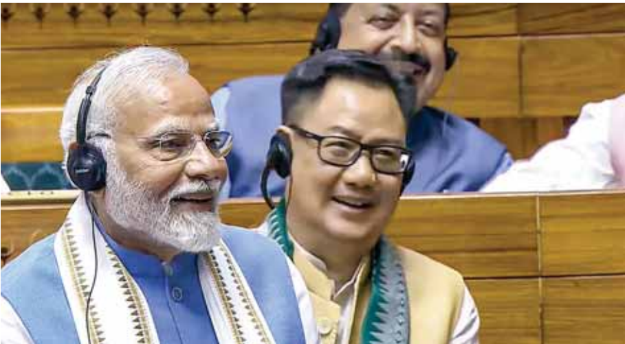
Prime Minister Narendra Modi reacts as he replies to the Motion of Thanks on the President's Address in the Lok Sabha during the ongoing Parliament session, in New Delhi, on Tuesday

"Images of our Gods cannot be used for personal political interests. They coined phrases like 'Hindu terrorism', their ally likened this religion to dengue; country will never forgive them," Modi said taking a swipe on Rahul's