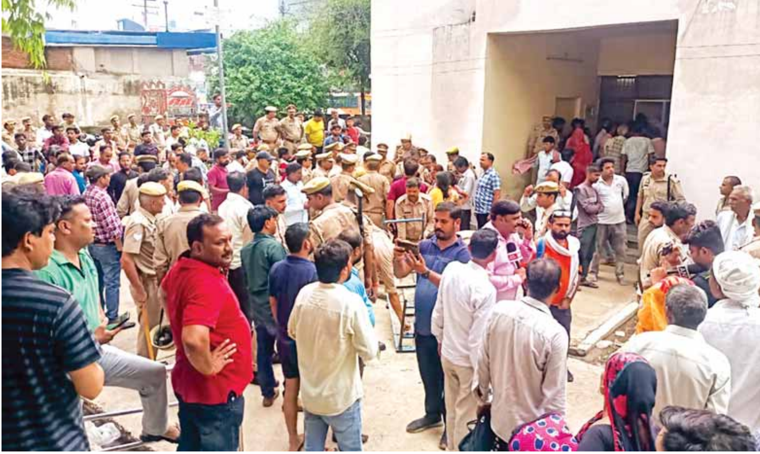
Relatives outside a hospital where victims of the Hathras' stampede are admitted, in Etah, on Tuesday. Many people were killed and several injured in the stampede, according to officials

In a statement from the UP CM Office, Yogi also wished for the speedy recovery of the injured. He directed the district administration officials to ensure that the injured receive proper treatment and to expedite relief efforts on-site. An investigation into the causes of the incident was