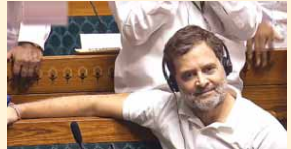
Leader of Opposition in Lok Sabha Rahul Gandhi during Prime Minister Narendra Modi's reply to the Motion of Thanks on the President's Address, in New Delhi on Tuesday

"Whatever I had to say, I have said and that is the truth. They can expunge as much as they want, but the truth will prevail," Rahul told reporters in Parliament