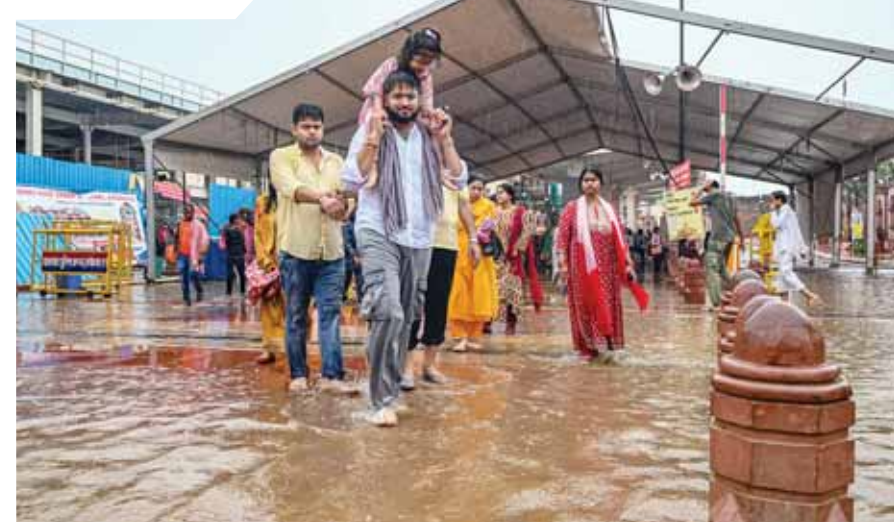
Devotees wade through a waterlogged area at Dharm Path in Ayodhya