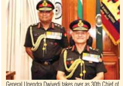
General Upendra Dwivedi takes over as 30th Chief of Army Staff from General Manoj Pande

final and final, 2016 Semi Final, and the clash against Pakistan in Melbourne Cricket Ground (MCG 2022), to which Virat rated his biggest T20 innings of his career. Rohit whose debut for India was in the inaugural T20 World Cup in 2007 under the leadership of MS Dhoni, from being the middle order batsman to being the opening batsman his journey has been remarkable. He appeared in nine World Cup Campaigns (2007-2024).