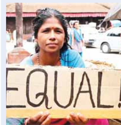
In response to the news report "25% of new hires are married women, nearly 70% of the workforce are women: Foxconn," published on

June 28, I would like to express my views. As India strives to replace China in the global supply chain, incidents like the alleged discrimination against married women at Foxconn's manufacturing plant are highly concerning. Although Foxconn has denied these allegations and stated that 70% of its workforce comprises women, a thorough and impartial investigation is necessary to dispel any doubts. There is a significant disparity in the ratio of men to women in the workforce, and companies like Foxconn can set a positive example by employing more women. This should be encouraged as we work to close this gap. Apple has consistently enforced strict policies with its manufacturing suppliers, and Foxconn should not be an exception. Ensuring gender equality in the workforce is crucial for our progress and competitiveness on the global stage.