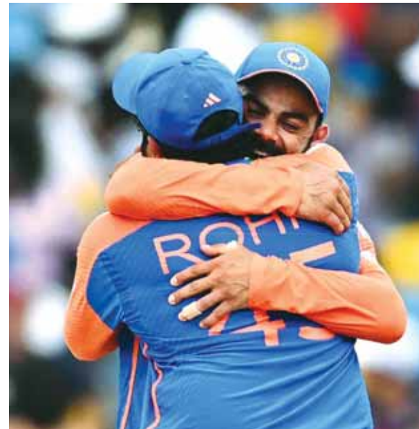
Rohit Sharma embraces Virat Kohli after India's T20 World Cup 2024 win

The confetti shimmered like a thousand dreams realized, raining down on Virat Kohli and Rohit Sharma as they held aloft the T20 World Cup trophy gleaming under the floodlights of Kensington Oval in Barbados. Virat and Rohit walked up to the microphone to give their victory speeches and a different kind of farewell on a night where billions of emotions were high after the triumph final. While receiving the Man of the Match award for his crucial innings of 76 of 39 balls, Virat said, "This was my last T20 World Cup, this is exactly what we (Indian Cricket Team) wanted to achieve, now it's time for the next generation to take over." After receiving the medals and awards, Rohit Sharma also announced his retirement officially. While addressing the post match conference Sharma said, "That was my last game as well. Honestly I have enjoyed it since the time I started playing this format. There's no better time to say good bye to this format, winning the World Cup is what I wanted." India's star all-rounder Ravindra Jadeja also hung up his boots from T20 Internationals. Kohli has always been the star performer for India from his debut 2012 World Cup. Over