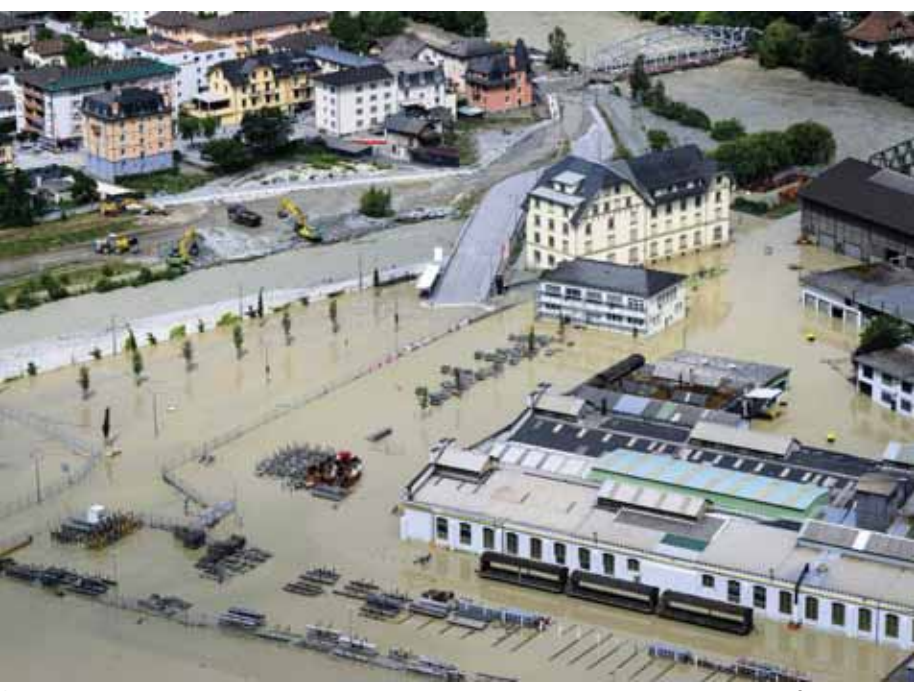
A view of the Rhone river, at right, and the Navignone river, following the storms that caused major flooding, in Chippis, Switzerland, on Sunday

Berlin (AP) — Storms in southern Switzerland caused a landslide that left two people dead and one missing, and a bridge over a small river collapsed, police said on Sunday. Storms and heavy rain affected southern and western Switzerland on Saturday and overnight, with the worst-hit areas in the Italian-speaking Ticino canton (state), on the southern side of the Alps. Police said there was a significant landslide in the Fontana area of the Maggia valley, which is near the city of Locarno. They said in a statement that the bodies of two people were recovered and were being identified, while rescuers were searching for another person who remained missing.