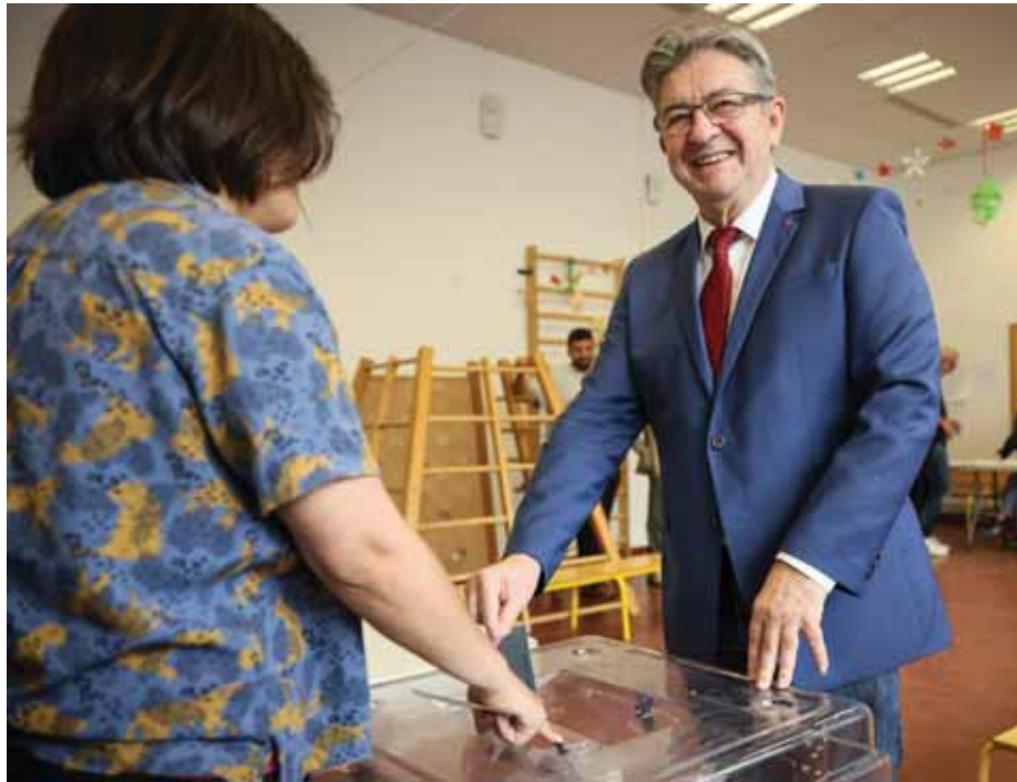
Far left leader Jean-Luc Melenchon casts his ballot, Sunday in Paris. France is holding the first round of an early parliamentary election that could bring the country's first far-right government since Nazi occupation during World War II. The second round is on July 7, and the outcome of the vote remains highly uncertain.

Voters across mainland France were casting ballots Sunday in the first round of exceptional parliamentary elections that could put the government in the hands of nationalist, far-right parties for the first time since the Nazi era.