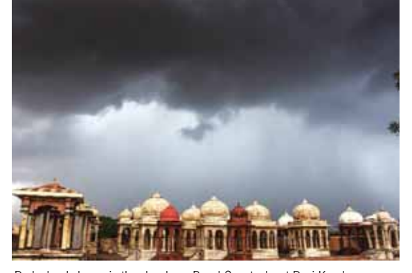
Dark clouds hover in the sky above Royal Cenotaphs at Devi Kund Sagar, in Bikaner