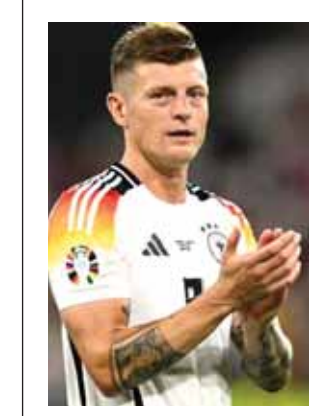
AP ■ DORTMUND

Toni Kroos gets another game before he retires. Germany's Euro 2024 title challenge looks more real than ever. One of the most decorated players in modern soccer with six Champions League titles and a World Cup, Kroos wasn't flashy as Germany beat Denmark 2-0 on Saturday, but he was a calm, assured presence holding the midfield together. Kroos already won the Champions League with Real Madrid this season. Now he's three games away from one final trophy and could face his Madrid teammate, Spain's Dani Carvajal, in his next game. Some fans already have their eyes on the final in the German capital and sang about heading to Berlin as Germany saw out the win.