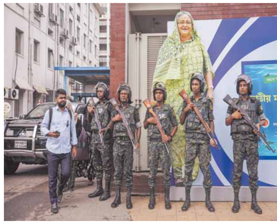
Military personnel stand guard in front of a large cutout portrait of Prime Minister Sheikh Hasina during the national mourning day, declared by the Bangladesh government to remember victims of the recent countrywide deadly clashes, in Dhaka, Bangladesh, on Tuesday, July 30

Prime Minister Sheikh Hasina's ruling Awami League's (AL) general secretary Obaidul Quader, meanwhile, said the government would thoroughly examine legal aspects before banning Jamaat-Shibir to block any possible legal loophole, which could be exploited by "this extremist group" to engage in politics in Bangladesh. For the sake of the country, the 14-party alliance has decided to ban Jamaat-Shibir to eliminate anti-national evil forces, Quader said. Quader, also the Road Transport Minister, said that Jamaat and BNP used students as "shields" during the movement while "the government is aware of the sources of their instructions, incitements, and funding." Violence gripped Bangladesh for almost the entire of July when the protests that had started in universities and colleges earlier this month, quickly turned into a widespread agitation against Prime Minister Sheikh Hasina and her government's policies. The government called in the army to quell protests against job quotas after the unrest left at least 150 dead and several thousand people, including policemen, wounded and major government installations damaged. Meanwhile, the ruling Prime Minister Sheikh Hasina's Awami League-led 14-party alliance leaders held a meeting with Hasina in the chair and