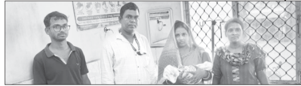
PNS ■ PARADIP

A newborn baby boy was rescued from the Sandhakud slum by a fisherman. The baby was taken to a medical center and later, transferred to the District Child Protection Unit.