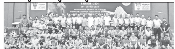
BALANGIR