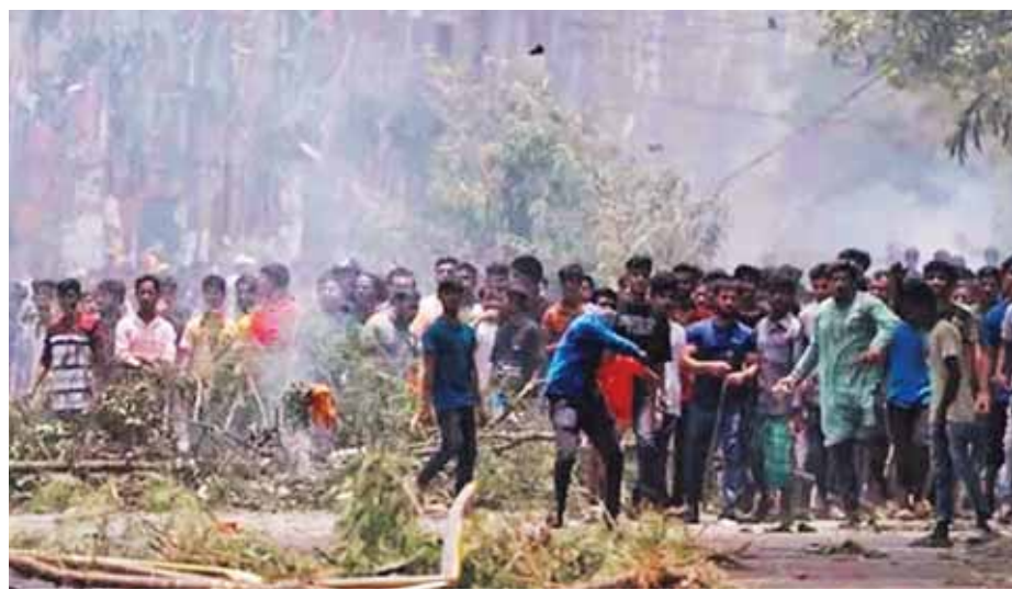
Deaths in clashes across the country.

He said mosques, temples, pagodas and churches across the country were also urged to offer prayers for the departed souls and the wounded people. The top bureaucrat said Home Minister Asaduzzaman Khan Kamal presented a report at the meeting about the overall situation and confirmed 150