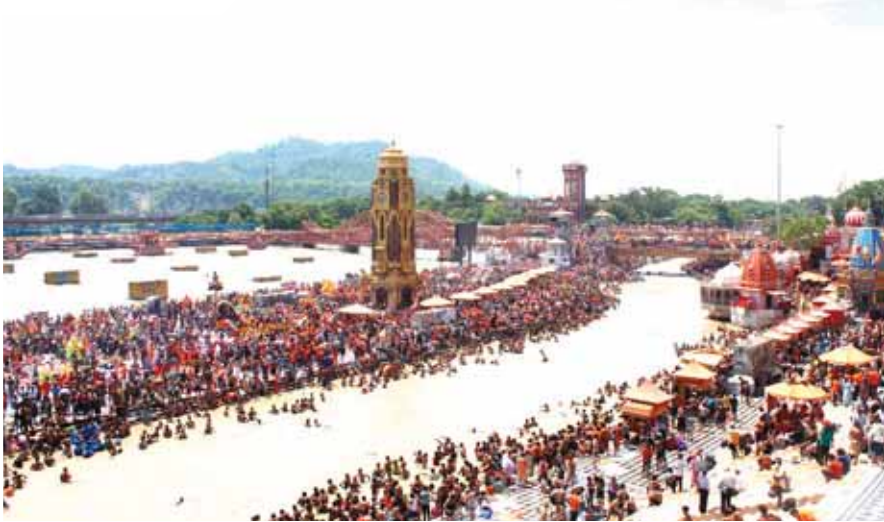
'Kanwariyas' gather at Har Ki Pauri ghat to collect 'Ganga jal', in Haridwar