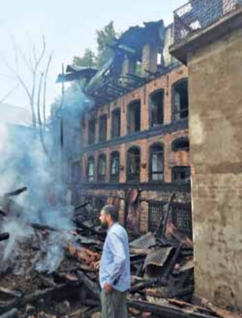
At least four houses belonging to Kashmiri Pandits were gutted under mysterious circumstances in the Mattan area of Anantnag district.

A late-night fire incident, in which at least four houses belonging to Kashmiri Pandits were gutted under mysterious circumstances in the Mattan area of Anantnag district on Sunday, has once again sparked a debate and raised serious security concerns among the Kashmiri Pandit community living in exile since 1990. The houses stood tall and witnessed over three-decade-long struggle before they were gutted under mysterious circumstances late last night. "We received this news early in the morning. The fire incident took place around 2.30 am. We demand a high-level probe into the fire," a close relative of the family living in Jammu told reporters. The multi-floor building was considered heritage site in the area. Most visitors reaching Mattan to fulfil their religious obligations used to pay a visit to the area and soak themselves in the glorious history of their forefathers who had constructed these architecturally rich structures. A prominent Kashmiri Pandit activist Ravinder Padita, associated with the Save Sharda in a post on X commented, "Is it sabotage or natural causes? One needs to know".