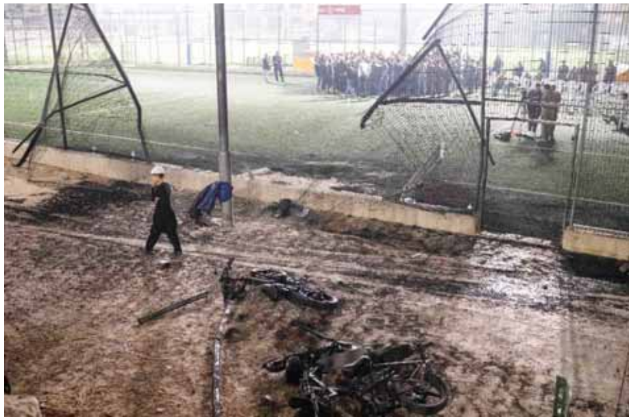
A boy walks past bicycles left next to the area that was hit by a rocket on a soccer field in the Druze town of Majdal Shams, in the Israeli-annexed Golan Heights, Saturday, July 27, 2024. A rocket strike Saturday at a soccer field killed at least 11 children and teens, Israeli authorities said, in the deadliest strike on an Israeli target along the country's northern border since the fighting between Israel and the Lebanese militant group Hezbollah began. It raised fears of a broader regional war.

A rocket strike on Saturday at a soccer field killed at least 12 children and teens, Israeli authorities said, in the deadliest strike on an Israeli target along the country's northern border since the fighting between Israel and the Lebanese militant group Hezbollah began. It raised fears of a broader regional war. Israel blamed Hezbollah for the strike in the Israeli-controlled Golan Heights, but Hezbollah rushed to deny any role. Israeli Prime Minister Benjamin Netanyahu warned that Hezbollah "will pay a heavy price for this attack, one that it has not paid so far". The Israeli military's chief spokesman, Rear Adm. Daniel Hagari, called it the deadliest attack on Israeli civilians since the Hamas attack on October 7 that sparked the war in Gaza. He said 20 others were wounded. "There is no doubt that Hezbollah has crossed all the red lines here, and the