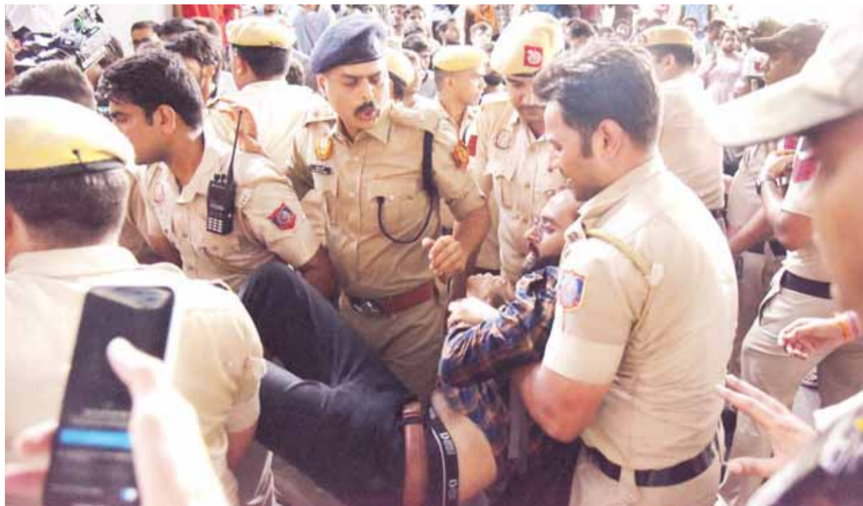
Police detain students protesting outside Karol Bagh metro station after three IAS aspirants died in the basement of Rau's IAS Study Circle at Old Rajinder Nagar area, in New Delhi, on Sunday

Thousands like the ones who fell prey to lackadaisical civic amenities make national Capital their karambhooni for a few years to get into elite Government services. "We have WhatsApp groups of UPSC aspirants. Those groups are full with students asking about the whereabouts of their friends. I am sure that the numbers