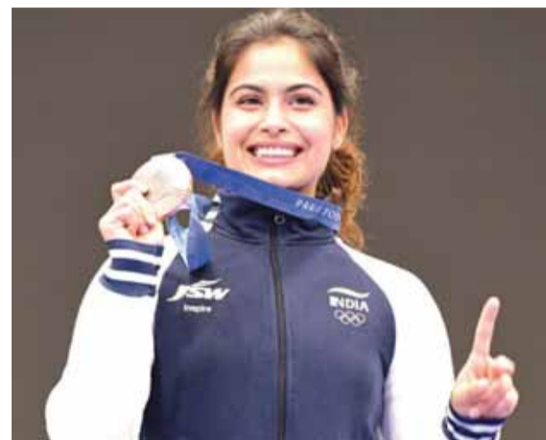
Manu Bhaker poses for a photograph with her bronze medal after finishing third in the 10m air pistol women's final round at the 2024 Summer Olympics, France, on Sunday

"We can't fight destiny," said Bhaker who appeared in her second Olympic stint. Previously she couldn't make it to the final and registered a bronze in this 2024 Olympic ending a drought in Olympic event.