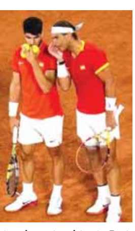
major championships in Paris and grabbed the last four games to beat Romania's Irina-Camelia Begu 6-2, 7-5, while reigning French Open

and owns two Summer Games golds, was a surprise torch carrier during the rain-soaked opening ceremony along the Seine River on Friday night. He won his doubles opener alongside Alcaraz on Saturday night. Nadal has not made entirely clear whether or not these Summer Games will be the final event of his career. He is 38 and has been dealing with injuries for much of the past two seasons. Nadal and Alcaraz never had played doubles together, but they got past the sixth-seeded Argentine duo of Maximo Gonzalez and Andres Molteni 7-6 (4), 6-4. The No. 1-ranked Swiatek claimed four of her five career