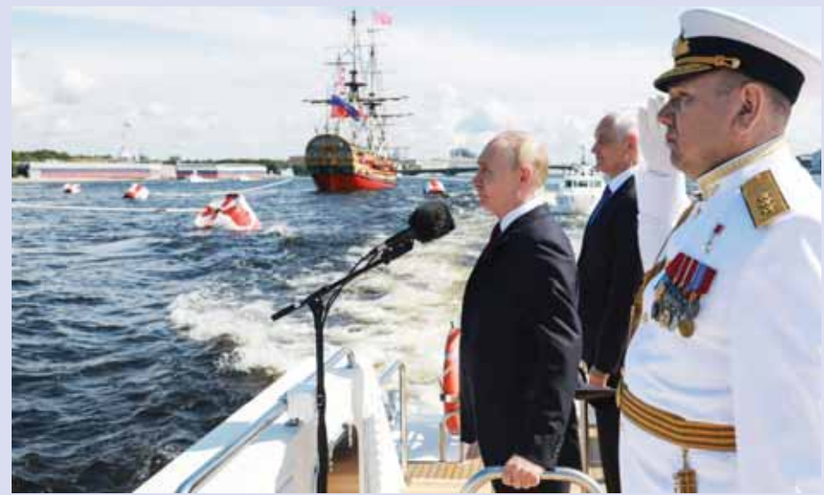
Russian President Vladimir Putin, centre, Russian Defense Minister Andrei Belousov, second right, and Russian Navy Commander-in-Chief Admiral Alexander Moiseyev, right, greet sailors prior to the main naval parade marking Russian Navy Day in St. Petersburg, Russia, on Sunday

tests that violated it. The allegations, which Russia denied, came as tensions mounted between Moscow and the West in the wake of the