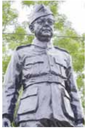
"We have been writing to the prime minister for the last three-and-a-half years, that in order to honour the liberator of India, his remains must touch Indian soil," he said.