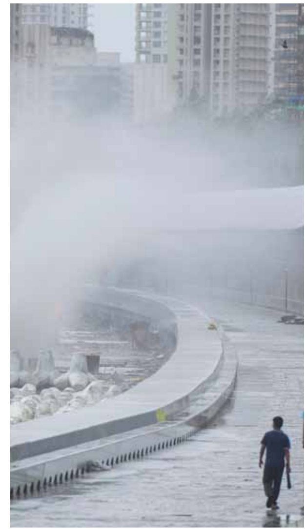
People walk past as sea waves crash against the promenade during high tide, at Marine drive, in Mumbai, on Wednesday

issues such as import duties on automobiles and scotch whisky and visas for business people. The British readout said Lammy will highlight the importance of a new partnership with India that focuses on economic, domestic and global security. Economic, domestic and global security will be at the heart of the Foreign Secretary's first visit to India as he travels to New Delhi to unlock the full potential of the UK-India partnership. He will tell his Indian counterpart that he wants to drive forward greater growth for both countries, it said. The Foreign Secretary will underscore the importance of the "living bridge" between the UK and India. It represents the 1.7 million people with Indian heritage that have made their home in the UK and make an exceptional contribution to British life, the readout released by the UK high commission in New Delhi said. "In a visit to India's third largest technology company, the Foreign Secretary will meet business leaders to highlight how the UK and India are working together on shared ambitions such as cutting-edge science to encourage innovation, boost trade, and improve the livelihoods of working people in both countries," it said.