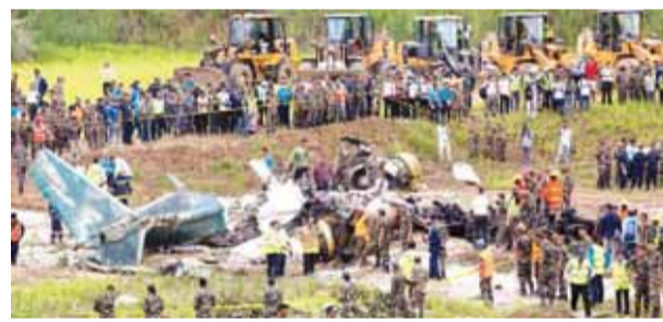
Rescue operations are underway at the site of a plane crash at Tribhuvan International Airport in Kathmandu, Nepal, on Wednesday

trust deficit," the bench also comprising Justices Dipankar Datta and Ujjal Bhuyan said. "Let appropriate instructions be taken within a week. Till then let parties maintain status quo at the site to prevent flaring up of the situation at the Shambhu border," the bench said while posting the matter after a week.