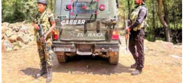
Security personnel stand guard during an encounter with terrorists in Trimukha area of Sopore in North Kashmir, on Wednesday