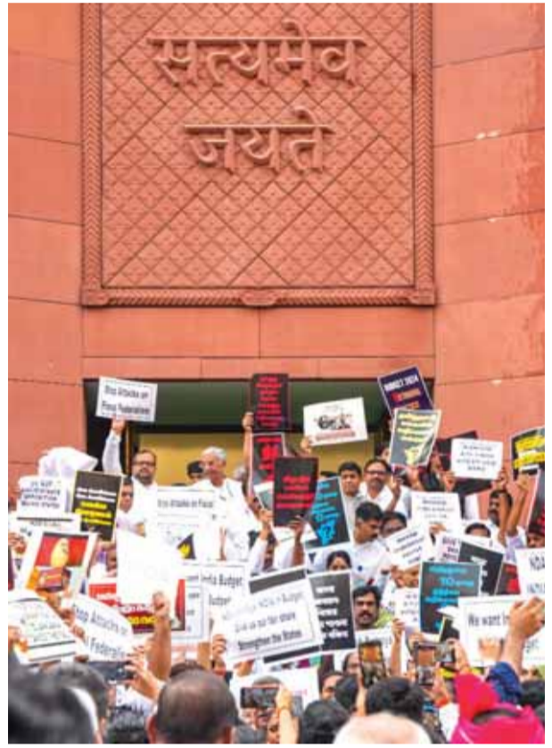
INDIA Bloc MPs stage a protest in Parliament premises over alleged discrimination in the Union Budget 2024, during the Monsoon Session, in New Delhi, on Wednesday

Opposition parties resorted to vehement protest in and out of Parliament on Wednesday over the alleged discrimination against Opposition-ruled States in the Union Budget.