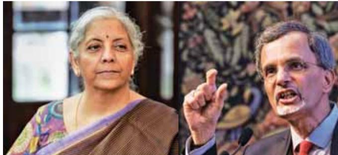
Chief Economic Advisor V Anantha Nageswaran addresses a Press conference after tabling of the Economic Survey 2023-24 in Parliament by Union Finance Minister Nirmala Sitharaman, in New Delhi, on Monday

uncertain global economic performance. Improved balance sheets will help the private sector cater to strong investment demand. The Survey also added a note of caution saying "private capital formation after good growth in the last three years may turn slightly more cautious because of fears of cheaper imports from countries that have excess capacity".