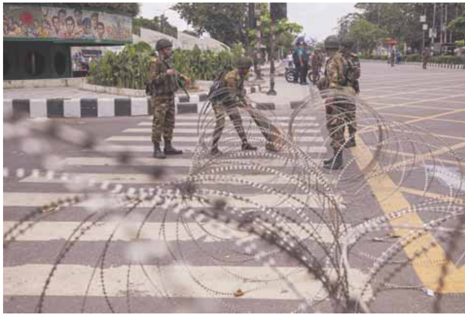
Bangladeshi military forces soldiers put up barbed wires on a main street in Dhaka, Bangladesh, Monday, July 22

Bangladesh remained without internet for a fifth day and the government declared a public holiday Monday, as authorities maintained tight control despite apparent calm following a court order that scaled back a controversial system for allocating government jobs that sparked violent protests. This comes after a curfew with a shoot-on-sight order was installed days earlier and military personnel could be seen patrolling the capital and other areas. The South Asian country witnessed clashes between the police and mainly student protesters demanding an end to a quota that reserved 30% of government jobs for relatives of veterans who fought in Bangladesh's war of independence in 1971. The violence has killed more than a hundred people, according to at least four local newspapers. Authorities have not so far shared official figures for deaths. There was no immediate violence reported on Monday morning after the Supreme Court ordered, the day before, the veterans' quota to be cut to 5%. Thus, 93% of civil service jobs will be merit-based while the remaining 2% reserved for members of ethnic minorities as well as transgender and disabled people. On Sunday night, some student protesters urged the govern-