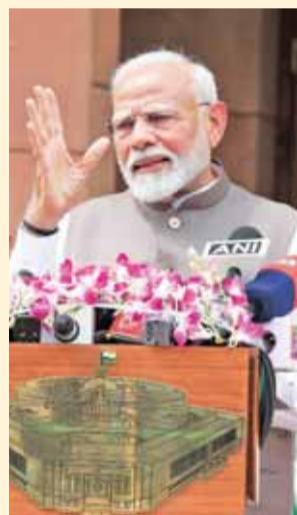
Prime Minister Narendra Modi addresses the media on the first day of the Parliament Session, in New Delhi, on Monday

A day before his Government is to present its first Budget in the third term, Prime Minister Narendra Modi outlined the agenda for this Session with an appeal to the Opposition to be constructive and a combative message saying some parties have practised "negative politics" and "misused" Parliament to hide their political failures.