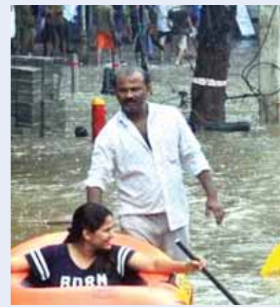
Despite the BMC's tall claims of rain readiness, waterlogging has been a persistent issue at focal points in Mumbai.

Initial rains inundate low-lying areas and block vehicular traffic, creating chaos on the roads. The widespread presence of potholes on Mumbai roads and highways exacerbates the problem, keeping road users on edge.