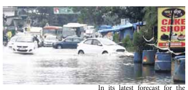
PTI ■ MUMBAI

Several locations in Mumbai received over 200 mm of rainfall in the 24 hours leading up to 8 AM on Monday, with the intense rain in the morning briefly disrupting local train services during the rush hour between Kalyan and Thakurli stations, causing delays. Some areas received up to 34 mm of rainfall in just one hour between 6 AM and 7 AM. The civic body claimed its Automatic Weather Stations (AWS) located across the city recorded more than 200 mm of rainfall at multiple locations in the last 24 hours ending at 8 AM. Three teams of the National Disaster Response Force (NDRF) have been deployed in Mumbai to tackle any situation amid the forecast of a high tide and moderate to heavy rains in the city and its suburbs, officials said.