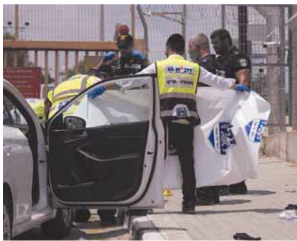
Israeli Police and ZAKA emergency service work at the scene of an attempted stabbing attack at the entrance to Netiv HaAsara, near the Gaza border in southern Israel on Monday.