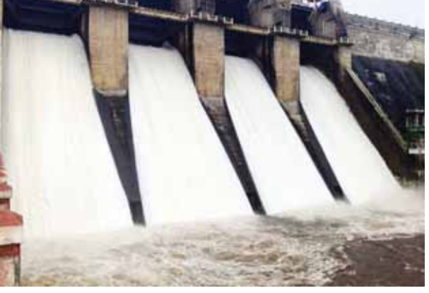
one TMC ft water to neighbouring Tamil Nadu till July-end.

Most of the dams in Karnataka are filled to the brim, thanks to the torrential rains in the catchment areas of the major rivers for the past few days. The coastal and Malnad region in the Western Ghats have been receiving incessant rains for the past 15 days due to which many rivers originating from here are in spate. According to the Karnataka State Natural Disaster Monitoring Centre (KSNDMC), the inflow of water in the Cauvery basin was 98,577 cusecs while the outflow was 70,645 cusecs. The KSNDMC said the cumulative outflow since June 1, was 118.25 thousand million cubic (TMC) feet, while the outflow was 41.52 TMC ft. The Krishna Raja Sagar (KRS) dam with a reservoir level of 124 ft presently has 123.2 ft water. As on Monday, the inflow was 60,016 cusecs and outflow 52,020 cusecs. Other dams in the Cauvery basin namely Harangi, Hemavathi and Kabini are also filled to the brim. The rains in the Cauvery basin have been received at a time when Karnataka was worried with the scanty rainfall and was gearing up for a legal battle with neighbouring Tamil Nadu. The Cauvery Water Regulation Committee had directed Karnataka to release