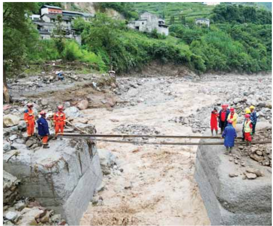
rescue workers set up a temporary crossing in the aftermath of floods in Xinhua Village of Hanyuan County, Ya'an City, southwest China's Sichuan Province, July 20

Department said, adding, "The department allowed for the voluntary departure of non-emergency US government employees and family members." "The Government of Bangladesh has declared a curfew throughout Bangladesh, ordering everyone to stay indoors. The Bangladeshi Army has been deployed throughout the country to reinforce the police. Telecommunications have been interrupted in Dhaka and across the country. Due to the security situation, there may be a delay in provision of routine consular services," the advisory stated. The US State Department said crimes such as muggings, burglaries, assaults, and illegal drug trafficking constitute the majority of criminal activity in Bangladesh's major cities, but there are no indications foreigners are being targeted because of their nationality. These crimes tend to be situational, based on time and location, it said.