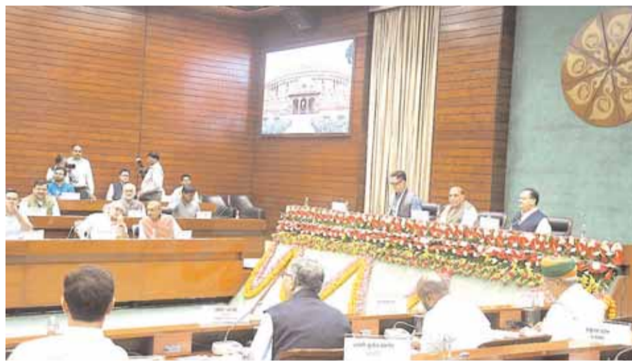
Defence Minister Rajnath Singh, Union Minister for Parliamentary Affairs Kiren Rijiju and Union Minister Jagat Prakash Nadda during the all-party meeting ahead of the Budget session of Parliament, in New Delhi on Sunday.

The Monsoon Budget session will have 19 sittings till August 12 when the