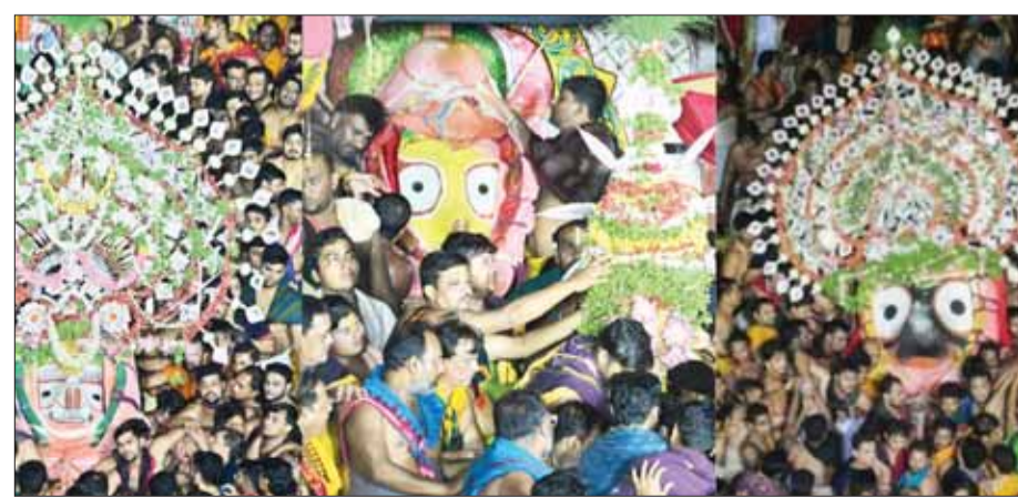
Niladri Bij: The Holy Trinity, Lord Jagannath, Lord Balabhadra and Devi Subhadra, return to the Shreemandir in Puri on Friday on conclusion of the 12-day annual Rath Yatra.

of Article 361 of the Constitution," the bench said in its order of issuing notice to the State Government and others. The Article deals with the protection of President and the Governors and its clause 2 reads, "No criminal proceedings whatsoever shall be instituted or continued against the President, or the Governor of a State, in any court during his term of office." The woman petitioner has also sought directions to frame specific guidelines under which Governors enjoy immunity from criminal prosecution. "This court has to decide whether a victim like the petitioner can be rendered remediless, with the only option being to wait for the accused to demit his office, which delay will then be inexplicable during the trial, and render the entire procedure a mere lip service, without any justice to the victim herein," the plea said.