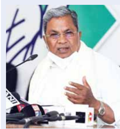
The criticism from business and industry forced the Karnataka government to put the contentious reservation bill for

Kannadigas in private firms on hold. The Karnataka State Employment of Local Candidates in the Industries, Factories, and Other Establishments Bill, 2024, was cleared by the state cabinet. According to the bill, "any industry, factory, or other establishment shall appoint 50 percent of local candidates in management categories and 70 percent in non-management categories."