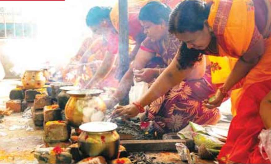
Devotees perform rituals at Amman temple during the Tamil month of 'Aadi', in Chennai