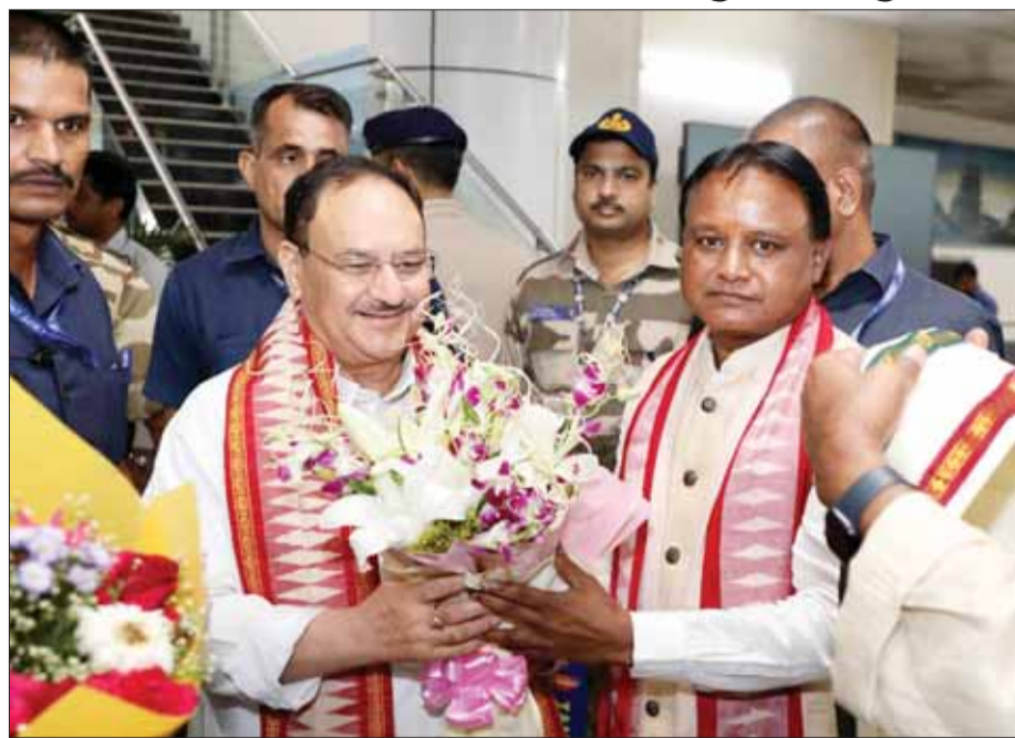
adopted a political resolution declaring "clean," "transparent" and "efficient governance." Union Minister