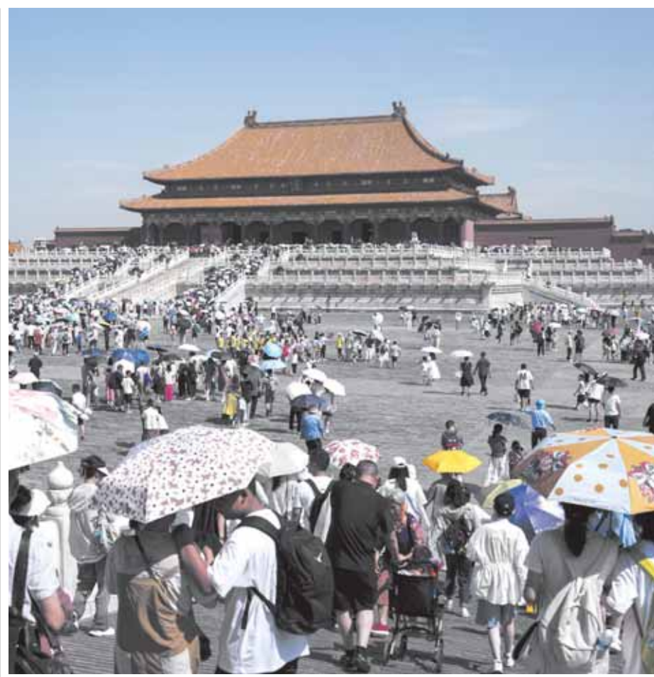
Chinese tourists visit the Forbidden City with cap and umbrella during a hot summer day in Beijing on Friday.