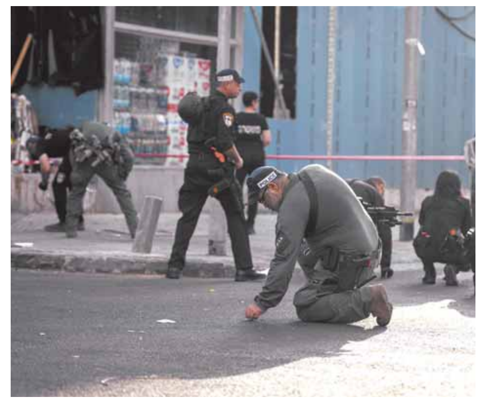
Israeli police investigate the scene of an explosive drone attack in Tel Aviv, Israel, Friday. Yemen's Houthi rebels claimed responsibility for a drone believed to have exploded above Tel Aviv early Friday morning, leaving one dead and at least 10 injured.

Every day, I will strive to honor the trust you have placed in me, and I will never let you down," Trump said. "To all of the forgotten men and women who have been neglected, abandoned, and left behind, you will be forgotten no longer. We will press forward, and together, we will win, win, win," he said. In his first speech after the assassination bid on him on Saturday in Pennsylvania, Trump said he stands before Americans with a message of confidence, strength, and hope. "Four months from now, we will have an incredible victory, and we will begin the four greatest years in the history of our country," Trump said. "In an age when our politics too often divide us, now is the time to remember that we are all fellow citizens. We are one nation under God, indivisible, with liberty and justice for all," he said. The former president basked in the adoring cheers of thousands as he called for unity behind his effort to return to the White House after the attack.