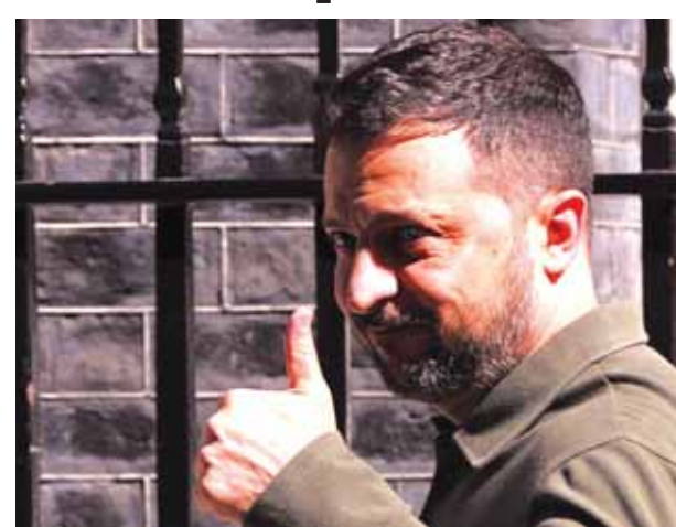
Ukraine's President Volodymyr Zelensky leaves Downing Street after meeting with Britain's Prime Minister Keir Starmer in London on Friday.

weapons to strike Russian territory because of concerns that the West could be drawn into direct conflict with Russia. The British government has said its up to Ukraine how to use missiles supplied by the UK, as long as international law is upheld. In an interview with the BBC, Zelensky said he was seeking clarification about Ukraine's ability to use Storm Shadow missiles supplied by Britain against targets in Russia. The Storm Shadow is an air-launched cruise missile with a range of more than 250 kilometres. "We need a decision about long-distance weapons, long range, to use it," Zelensky said. "We need it very much. They're targeting our hospitals, schools. We just want to answer exactly to the point where they target us." UK Defence Secretary John Healey said Ukraine already has permission to use the missiles against Russia, but the rules for exactly what can be targeted and under what circumstances are "complex ques-