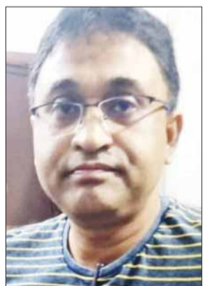
officials planned and trapped the doctor while he was accepting the bribe money from complainant," the release said.

"Finding no other option, he reported the matter and harassment by the doctor on toll-free No 1064 of Odisha Vigilance and the same was registered. Accordingly, Vigilance