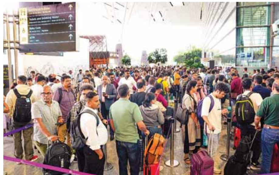
Stranded passengers at the Kempegowda International Airport Bengaluru amid Microsoft outage, in Bengaluru, on Friday. IndiGo, Air India Express, SpiceJet and Akasa at the Bengaluru airport began checking in passengers manually on Friday, issuing handwritten boarding passes, after a global Microsoft outage led to the Navitaire Departure Control System stalling

said his Ministry and Airports Authority of India (AAI) are actively managing the situation arising out of a global Microsoft outage, which severely impacted airport and airline operations in the country. The Civil Aviation Ministry in collaboration with AAI has implemented manual backup systems to maintain operational continuity, Naidu said in a statement.