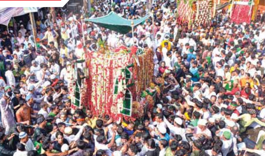
Shia Muslim mourners participate in an Ashura (10th Muharram) procession, in Mirzapur