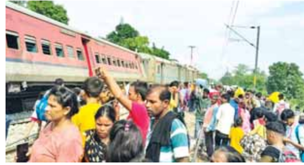
Local residents gather after Chandigarh-Dibrugarh Express derails in Uttar Pradesh on Thursday

It also said material collected by the Bihar Police and the report of its Economic Offences Wing (EOW), before the investigation was taken over by the CBI, shall be filed in the court by 5 pm on July 20. At the outset, the bench said it has prioritised the hearing on the pleas over other cases as these have "social ramifications" and lakhs of students are waiting for the outcome.