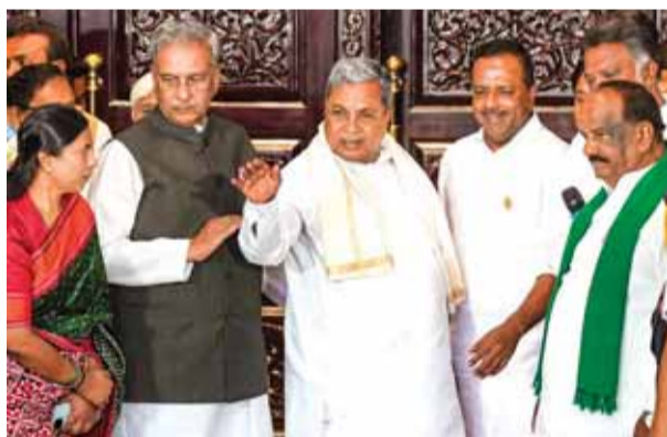
Chief Minister Siddaramaiah with leaders

The move, however, did not go down well with industry leaders and late evening Government sources said the Bill which was to be tabled in the Karnataka Assembly on Thursday has been put on hold now. Sources said the Congress high command from New Delhi had to