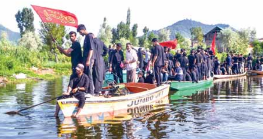
Shia mourners participate in the 9th Muharram procession, on boats, at Dal Lake, in Srinagar