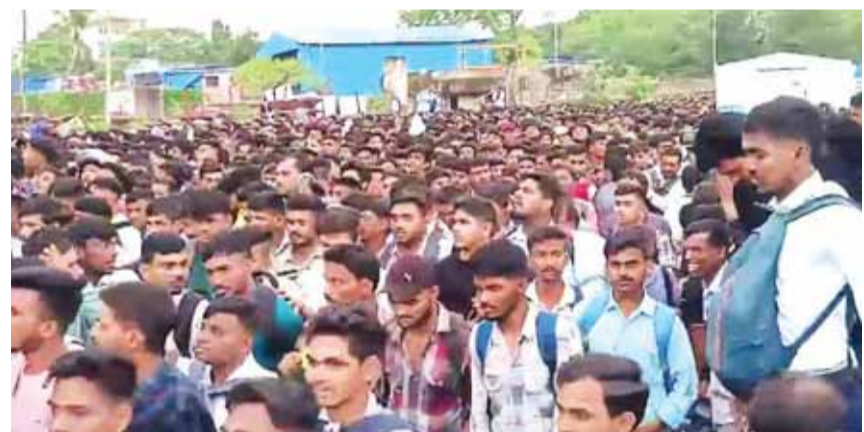
A stampede-like situation prevailed near the Mumbai airport where thousands of job aspirants gathered to apply for a limited number of vacancies for the post of loader though the police on Wednesday claimed they had made adequate arrangements to avoid any untoward incident