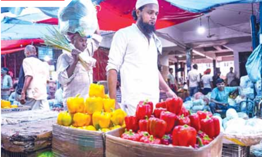
A vendor sells Capsicum at Azadpur Mandi, in New Delhi