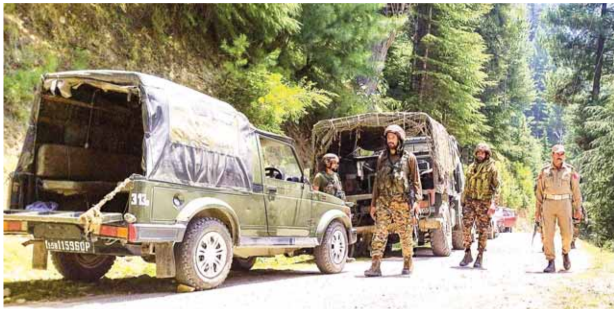
Security forces personnel during an encounter with terrorists in Doda forest area, in Doda district of Jammu and Kashmir, on Tuesday

A Captain of the Indian Army, along with three other soldiers, was martyred during a fierce gunfight with a group of suspected foreign terrorists in Jammu Dessa forest area, which shares its boundaries with Basantgarh in Udhampur, Anantnag, Keshwan in Kishtwar, and Pogal Paristan in Ramban district, late Monday night. It is suspected the joint team of security forces was lured into the deep forest area where they were ambushed by the well-entrenched group of the foreign terrorists. Kashmir Tigers, a proxy outfit of the Jaish-e-Mohammad, has claimed responsibility for the attack. The gruesome attack comes close on the heels of another deadly ambush on the soldiers near Badnota village of Machhedi in the Billaigar tehsil of Kathua district on July 8 in which five soldiers were martyred and five others were injured. The Indian Army, however, maintained that a joint operation with J&K Police was launched in the general area of Urabaggi, 10 km North of Doda. At about 8.40 pm on Monday, the search party was able to establish