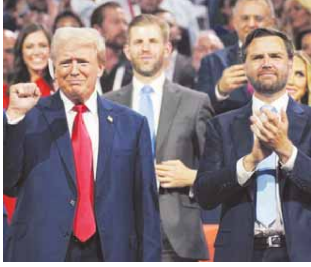
Republican presidential candidate former President Donald Trump and Republican vice presidential candidate Sen. JD Vance, R-Ohio, attend the first day of the Republican National Convention, Monday.

Donald Trump, wearing a white bandage partially covering his injured right ear, stole the show when he made his first public appearance on the opening night of the Republican National Convention here, days after surviving an assassination attempt. Trump on Monday entered the convention hall to roaring applause from thousands of delegates and holding his fist aloft towards the end of the first day of the four-day convention being held at the Fiserv Forum in Milwaukee, a city in the US state of Wisconsin. The former president entered the convention arena here with a fist raised and to the strains of a live performance of "God Bless the USA". He then slowly walked through cheering delegates who pumped their fists and called out "Fight! Fight! Fight!" He then greeted key political allies and members of his fam-