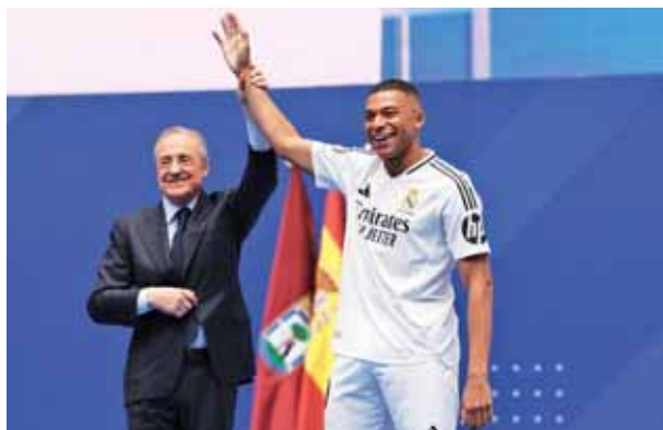
Bernabeu, which had its roof closed for the midday ceremony in the Spanish capital. Kids linked to

cheers by the Madrid fans. Wearing the No. 9 jersey, Mbappé smiled broadly and waved to the fans who chanted his name, then embraced Pérez and former Madrid player and coach Zinedine Zidane, who invited Mbappé to visit the Spanish club for the first time when he was just a teenager. "It's incredible day for me," Mbappé told the crowd, in Spanish. "Since being a kid I dreamed about playing for Madrid and today I'm here. It means a lot to me." Mbappé's relatives, club officials and several former players were by the stage at the