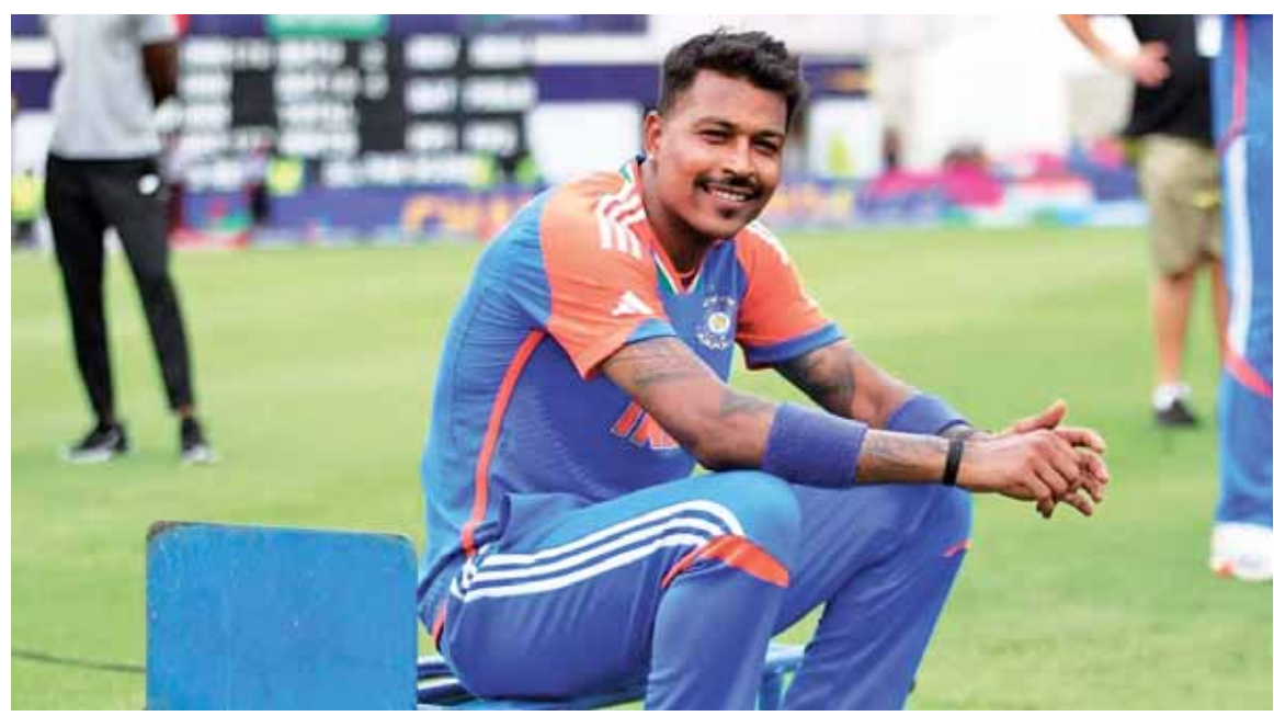
PTI ■ NEW DELHI

Star all-rounder Hardik Pandya is all set to lead India in the three-match T20 International series against Sri Lanka starting July 27. However, one of the heroes of India's T20 World Cup victory last month will take a break during the three-match ODI series, which is scheduled in