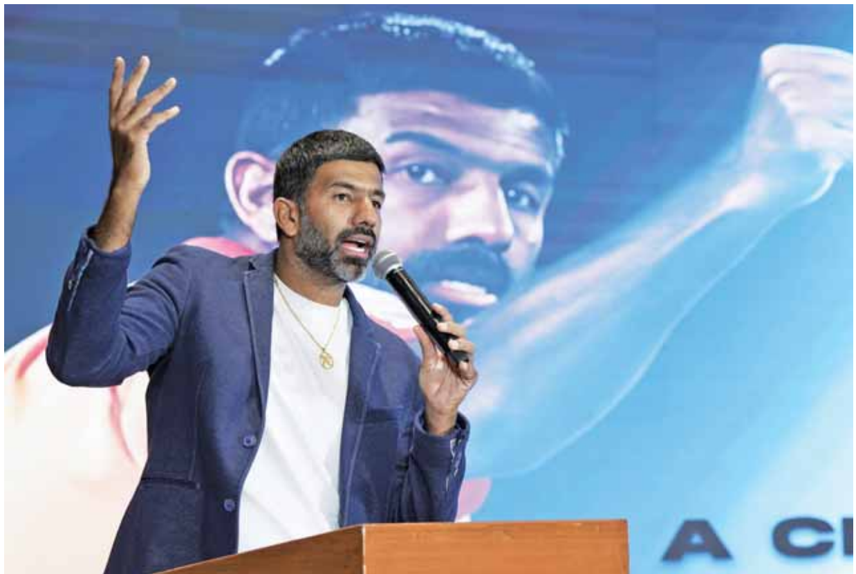
(Matthew) Ebden, who I'm playing with, he's somebody who's more agile, more explosive on that surface. "And for clay, especially, I need a partner who would suit me

the French Open where Bopanna was pushed along with Matthew Ebden by the Tamil Nadu player and his Mexican partner Miguel Reyes-Varela. Not only this, Balaji had a consistent run on the ATP Tour where he scalped a few big names such as Americans Rajeev Ram and Austin Krajicek -- both top-10 players -- at the Houston ATP 250 event on clay. With his German partner Andre Begemann, Balaji also defeated Austria's top-50 players Alexander Erler and Lucas Miedler. Balaji also showed that he can quickly adapt to conditions when he was asked to do the singles duty during the Davis Cup tie against Pakistan on grass. The rival was not of the highest quality but Balaji showed that he was willing to come out of his comfort zone if the team demands. "The idea is to go prepared, at least believe in as a team. That is what we're trying to do. With Bala, he definitely has the firepower to do well," Bopanna said. He also gave his reason for picking Balaji over Bhambri. "I felt Balaji, depending on the surface we're playing with, which is the clay, would have been the ideal partner. Currently, even if you look at