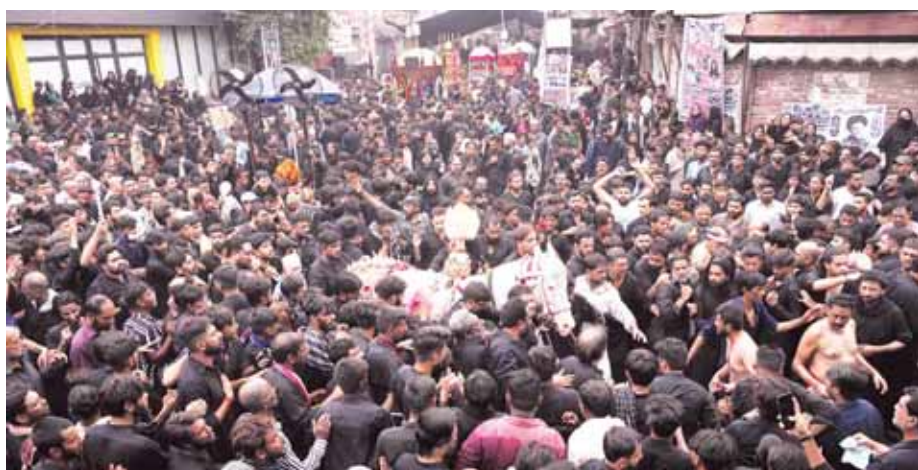
Shiite Muslims touch a horse, that symbolizes the horse that carried Imam Hussein during the battle of Karbala, during a Muharram procession, in Lahore, Pakistan, Tuesday.

Tehran (AP): Iranian Shiite Muslims on Tuesday commemorated Ashura, a remembrance of the seventh century martyrdom of the Prophet Muhammad's grandson, Hussein, that gave birth to their faith. Over 1,340 years after Hussein's death, Tehran and other cities across the country were adorned with symbols of Shiite piety and repentance. Red flags represented Hussein's blood, black funeral tents and clothes indicated mourning, and processions of chest-beating and self-flagellating men expressed fervour. Some sprayed water over the mourners in the intense heat. Many Iranian people also travelled to the Iraqi city of Karbala, where Hussein is entombed in a gold-domed shrine, to mourn there. Iranian state TV broadcast live from there, showing people at the shrine. Shiites represent over 10 per cent of the world's 1.8