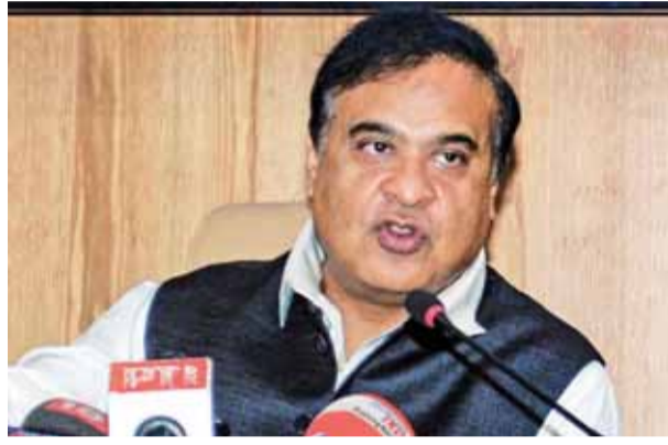
Assam Chief Minister Himanta Biswa Sarma addresses the media, in Guwahati

"We conducted outreach programmes in the Barak valley and approached many Hindu Bengali families and asked them to apply for citizenship under CAA. However, they refused to do so. The Assam Chief