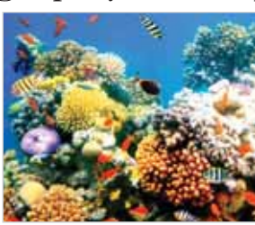
These regions offer invaluable benefits to humanity, including ecological, economic, social, cultural, scientific, and food security advantages. However, they are vulnerable to significant threats such as pollution, overexploitation, and the escalating impacts of climate change. The anticipated rise in human demand for marine resources in the coming decades—for food, minerals, and biotechnology—poses a risk of worsening these issues. These areas cover nearly half of the Earth's surface, yet they lack comprehensive legal frameworks to regulate human activities, leaving them vulnerable to overfishing, habitat destruction, pollution, and the impacts of climate change.

The world's oceans, vast and mysterious, are crucial to the health of our planet. They regulate the climate, produce half of the oxygen we breathe, and support a rich tapestry of life that is vital to global biodiversity. Marine ecosystems are incredibly diverse, hosting countless species, many of which remain undiscovered. Protecting this biodiversity is not just an ethical obligation but a practical necessity. Healthy marine ecosystems provide essential services, such as carbon sequestration, which helps mitigate climate change.