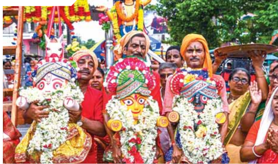
Devotees carry idols of Lord Jagannath, Balabhadra and Subhadra on the occasion of Ulta Rath Yatra in Nadia