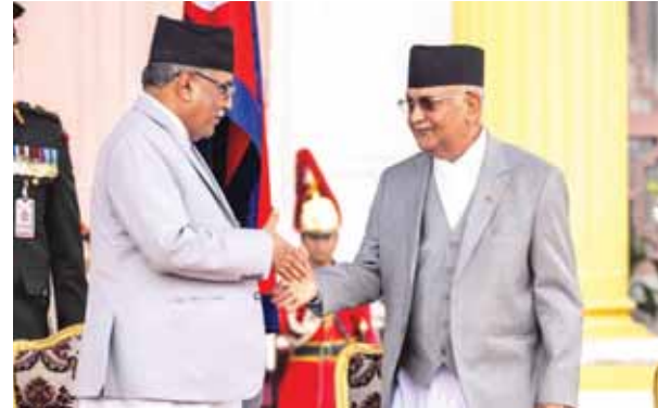
Outgoing Prime Minister Pushpa Kamal Dahal (left) congratulates newly-elected Prime Minister Khadga Prasad Oli (right) after the oath of office at the Presidential residence in Kathmandu on Monday.

KP Sharma Oli on Monday was sworn in as Nepal's Prime Minister for the fourth time to lead a new coalition government that faces the daunting challenge of providing political stability in the Himalayan nation. The leader of Nepal's largest communist party was appointed as prime minister on Sunday by President Ram Chandra Poudel to lead the coalition government with the Nepali Congress (NC), the largest party in Parliament, apart from other smaller parties. Oli, 72, succeeds Pushpa Kamal Dahal 'Prachanda', who lost the vote of confidence in the House of Representatives (HoR) on Friday, leading to the formation of the new government. Chairman of the Communist Party of Nepal-Unified Marxist Leninist (CPN-UML), Oli was sworn in by President Poudel at Shital Niwas, the main building of Rashtrapati Bhawan at a ceremony that was delayed by more than half an hour. According to the news portal MyRepublica, the swearing-in ceremony was delayed due to the failure of the Nepali Congress to finalise the names