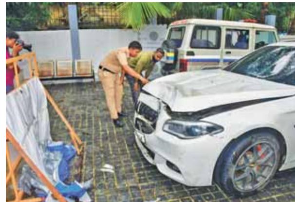
A damaged BMW car that was involved in a hit-and-run case, parked on the premises of Worli police station, in Mumbai, on Sunday