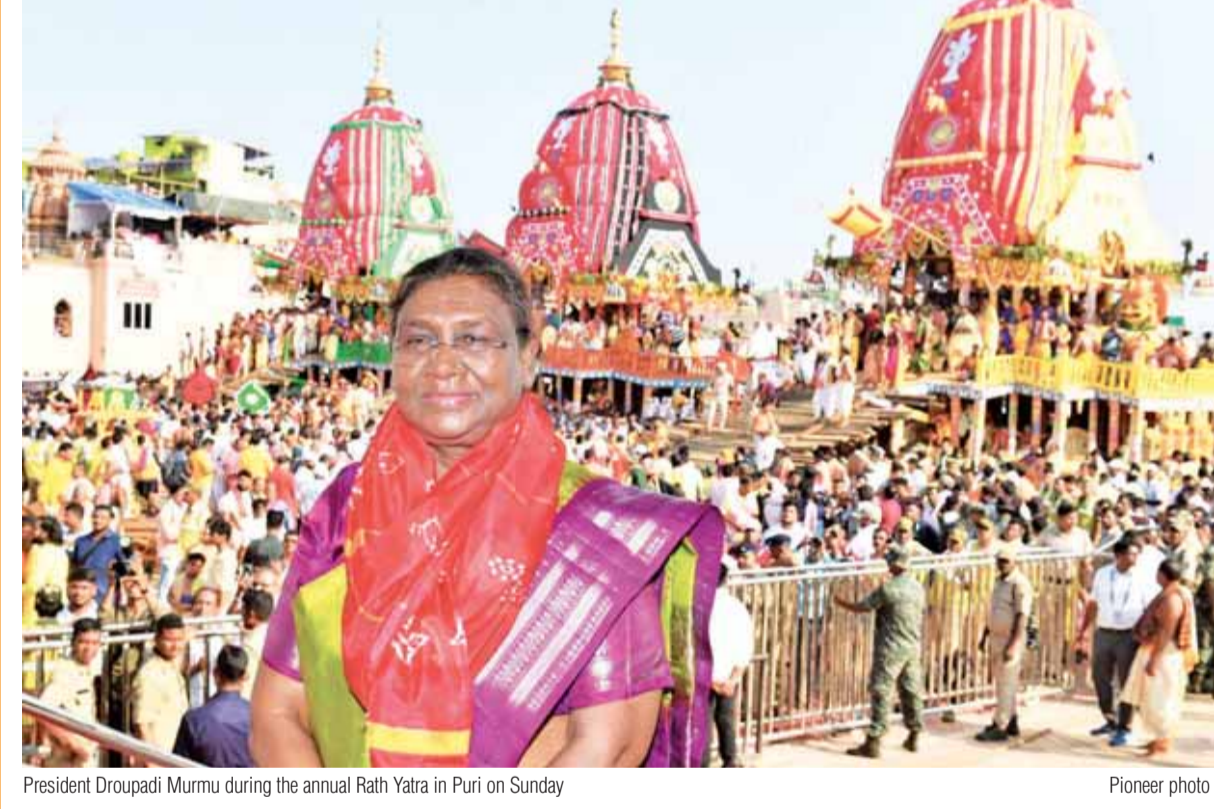
President Droupadi Murmu during the annual Rath Yatra in Puri on Sunday