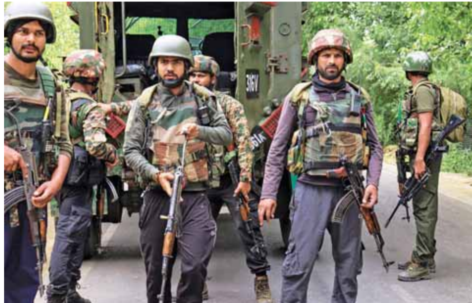
Security personnel stand guard during an encounter with terrorists in Kulgam