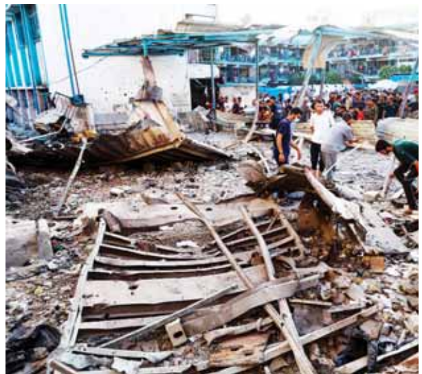
Palestinians look at the aftermath of the Israeli airstrike on a U.N.-run school that killed dozens of people in the Nusseirat refugee camp in the Gaza Strip on Saturday.

Marking nine months since the war in Gaza started, Israeli protesters blocked highways across the country Sunday, calling on Prime Minister Benjamin Netanyahu to step down and pushing for a ceasefire that could bring back the hostages held by Hamas. The demonstrations come as international mediators have renewed efforts to broker a deal. Hamas over the weekend appeared to have dropped a key demand for an Israeli commitment to end the war, according to Egyptian and Hamas officials who spoke to The Associated Press. The war, triggered by the Palestinian militant group following a cross-border attack on October 7, saw 1,200 people killed and 250 others taken hostage. A retaliatory Israeli air and ground offensive has killed over 38,000 Palestinians, according to the territory's Health Ministry, which does not distinguish between combatants and civilians in its count. Sunday's "Day of Disruption"