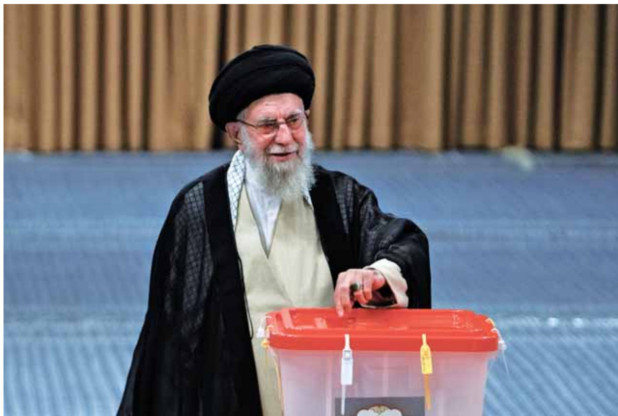
Iranian Supreme Leader Ayatollah Ali Khamenei casts his vote for the presidential runoff election in Tehran, Iran, Friday, July 5, 2024. Iranians began voting Friday in a runoff election to replace the late President Ebrahim Raisi, killed in a helicopter crash last month, as public apathy has become pervasive in the Islamic Republic after years of economic woes, mass protests and tensions in the Middle East.

his foreign visits, especially to the Gulf and other Muslim majority nations. Sprinkled in the mix in all four countries are encounters with young people, poor and disabled people, elderly people and Francis' regular meetings with his Jesuit confreres. The trip was originally planned for 2020 but was called off because of the COVID-19 pandemic. At 11 full days, it's the longest of Francis' 11-year papacy, outpacing by a few days some of his long trips to the Americas and recalling some of the strenuous, globe-hopping trips of St. John Paul II. It will bring the Argentine Jesuit to the world's most populous predominantly Muslim nation, Indonesia, as well as one of the world's newest countries, the former Portuguese colony of East Timor, where the Catholic Church wields enormous influence. About 98.3 per cent of its 1.34 million population is Catholic, according to the 2022 census, and it's the Asian country with the highest proportion of Catholics after the Philippines.