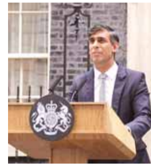
Britain's Labour Party leader Keir Starmer reacts on stage as he is elected for the Holborn and St Pancras constituency, in London (l). Britain's outgoing Conservative Party Prime Minister Rishi Sunak speaking outside 10 Downing Street before going to see King Charles III to tender his resignation in London, on Friday