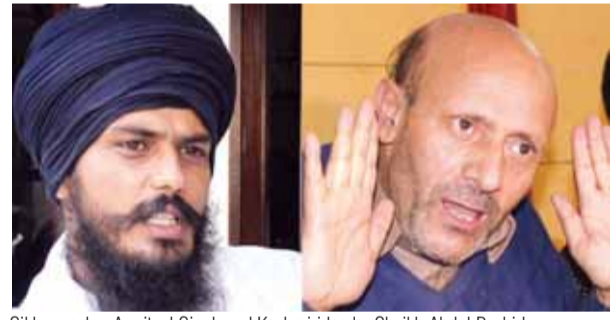
Sikh preacher Amritpal Singh and Kashmiri leader Sheikh Abdul Rashid

Jailed radical Sikh preacher Amritpal Singh and Kashmiri leader Sheikh Abdul Rashid, who were granted parole to take oath as members of the Lok Sabha, were sworn in as MPs on Friday, amid heavy deployment of security personnel in and around the Parliament complex. While Rashid, popularly known as Engineer Rashid, is in Delhi's Tihar jail in a terror-funding case registered under the Unlawful Activities (Prevention) Act, Singh is lodged in a prison in Assam's Dibrugarh district for offences under the National Security Act. They were brought to the Parliament complex by