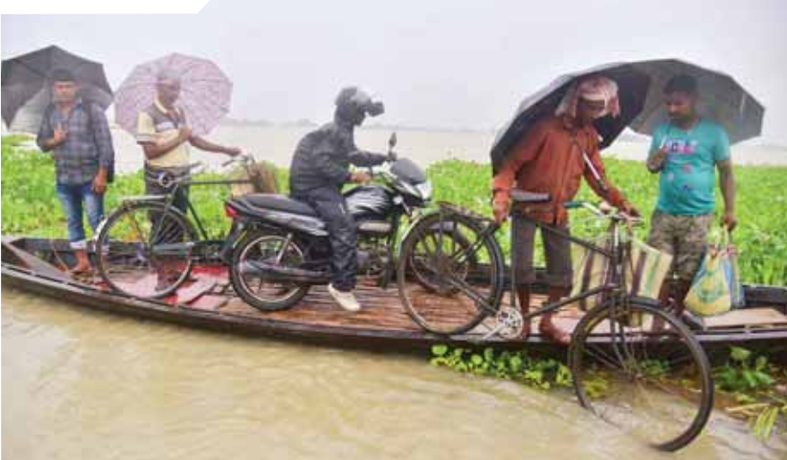
Villagers use a boat to travel across a flood affected area after heavy rainfall, in Morigaon district