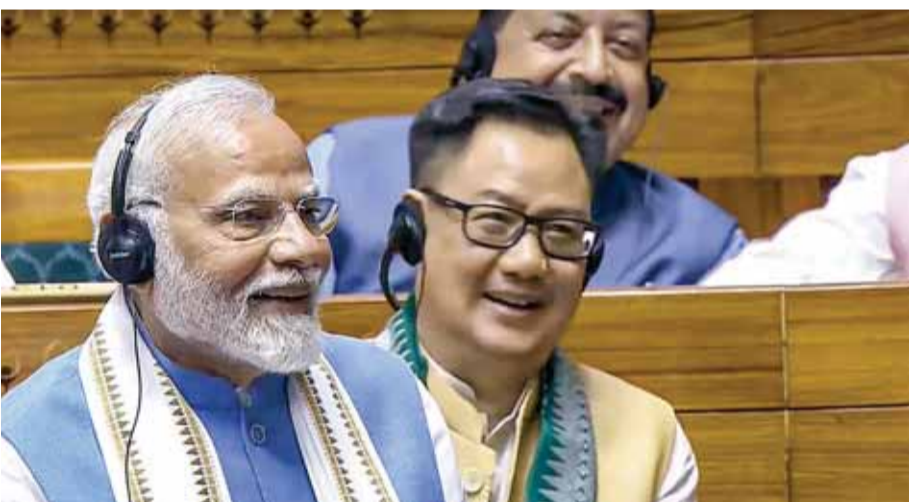
Prime Minister Narendra Modi reacts as he replies to the Motion of Thanks on the President's Address in the Lok Sabha during the ongoing Parliament session, in New Delhi, on Tuesday

Prime Minister Narendra Modi on Tuesday said people have given his Government a mandate for stability and continuity for the third consecutive term after seeing its work of 10 years and accused the Congress of trying to build a narrative that it has defeated the BJP-led NDA in the Lok Sabha polls. Replying to a two-day debate on the President's address to both Houses of Parliament, he also accused the Congress of working towards creating economic anarchy in the country. Modi also condoled the loss of lives in Hathras in between his speech. Modi singled out Leader of the Opposition in the Lok Sabha Rahul Gandhi, saying the House witnessed the wailing of a person with "balak buddhi (childish behaviour)" who tried to gain sympathy without disclosing the wrongs he had committed. "Images of our Gods cannot be used for personal political interests. They coined phrases like 'Hindu terrorism', their ally likened this religion to dengue; country will never forgive them," Modi said taking a swipe on Rahul's