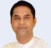
RAJYOGI BRAHMAKUMAR NIKUNJ JI

True peace and creativity flourish when we fully engage with the present