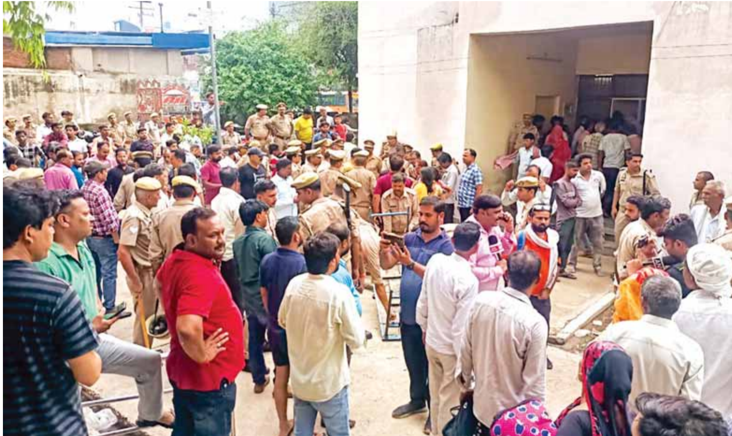
Relatives outside a hospital where victims of the Hathras' stampede are admitted, in Etah, on Tuesday. Many people were killed and several injured in the stampede, according to officials

Over 100 people were feared dead and several others injured as tragedy struck Hathras when a stampede broke out among devotees attending a 'satsang' on Tuesday. The deceased included mostly women and children. Though the district magistrate of Hathras officially reported around 60 casualties, sources claimed that over 100 devotees died in the accident. Bereaved family members and local residents staged demonstrations in front of many hospitals, protesting delays in treatment. Senior officers, along with police forces from all districts of the Aligarh range, were summoned to manage the demonstrators. Uttar Pradesh Chief Minister Yogi Adityanath expressed his condolences to the families of those killed in the stampede. In a statement from the UP CM Office, Yogi also wished for the speedy recovery of the injured. He directed the district administration officials to ensure that the injured receive proper treatment and to expedite relief efforts on-site. An investigation into the causes of the incident was