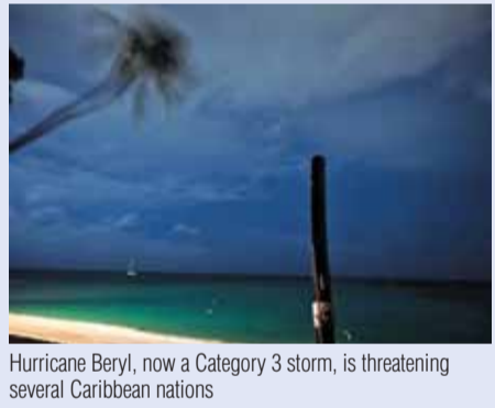
Hurricane Beryl, now a Category 3 storm, is threatening several Caribbean nations

for the residents of Ayodhya during development projects there. BJP Rajya Sabha member Sudhanshu Trivedi said the Congress has a history of insulting Hindus, as he cited former home ministers P Chidambaram and Sushil Kumar Shinde's alleged terrorism barbs for the religion. Union Health Minister and BJP president JP Nadda also lambasted Rahul, accusing him of combining lies and hatred in his speech. "It was a worst show by Rahul on his first day. Third time fail LoP has a knack for agitated, flawed logic. His speech today has shown that neither has he understood the mandate of 2024 (his third successive loss) nor does he have any humility," Nadda said. Slamming Rahul for his remarks, Union Minister G Kishan Reddy said democracy will remain intact and there will also be peace "so long as Hindus are in majority" in the country. Union Minister Krishan Pal Gurjar flayed Rahul for his remarks and said the Leader of Opposition only made "baseless remarks" in his speech and did not give any "positive suggestion" in the House.