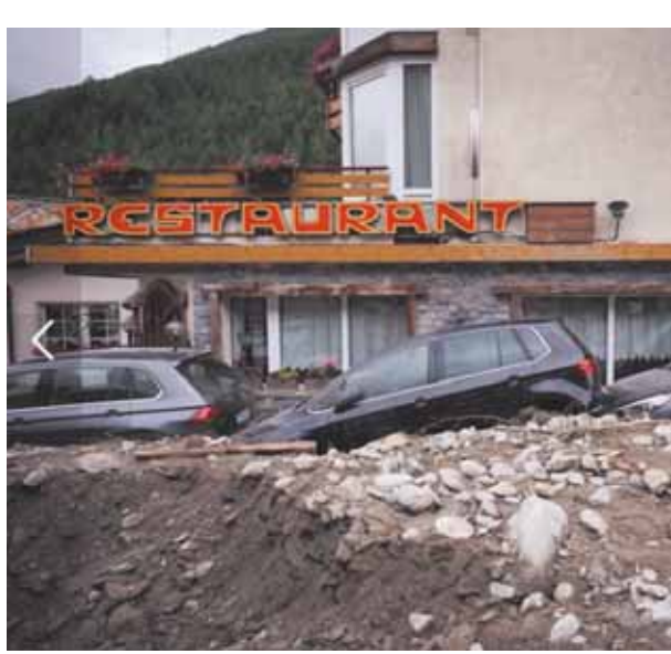
Police said that side valleys south of the Rhone saw particularly heavy rain, and the body of a man whose partner had reported him missing was found early Sunday at a hotel

Storms in Switzerland and northern Italy caused extensive flooding and landslides, leaving at least four people dead, authorities said Sunday. The bodies of three people were recovered following a landslide in the Fontana area of the Maggia valley in the Italian-speaking Ticino canton (state) on the southern side of the Alps. Storms and heavy rain pounded southern and western Switzerland on Saturday and overnight. Camping sites along the Maggia River were evacuated, and part of the small Visletto road bridge collapsed. One person was missing in the nearby Lavazzara valley. Further north, the Rhone River burst its banks in several areas of Valais canton, flooding a highway and a railway line.