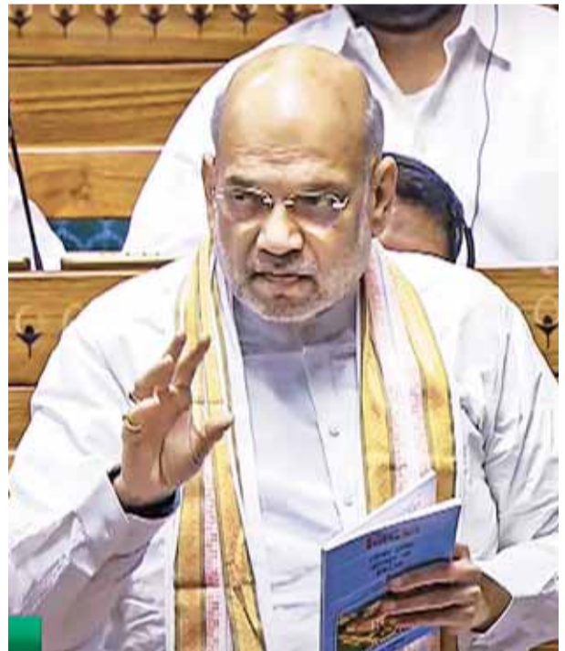
Union Home Minister Amit Shah speaks in the Lok Sabha during ongoing Parliament session, in New Delhi, on Monday

ethos. After 75 years, these laws were contemplated upon and as these laws have gone into effect from today, colonial laws stand scrapped, and laws made in the Indian Parliament are being brought into practice," he said. The Home Minister said justice would be delivered up to the level of the Supreme Court in all cases within three years of the registration of an FIR under the new criminal laws. "The new laws brought in a modern justice system, incorporating provisions such as Zero FIR, online registration of police complaints, summons served through electronic modes such as SMS and mandatory videography of crime scenes for all heinous crimes," he said. He said the new statutes were made more sensitive by adding a chapter on crimes against children and women and the inquiry report in such cases were to be filed within seven days. Shah said, according to the new laws, judgment in criminal cases had to be delivered within 45 days of completion of trial and charges must be framed within 60 days of first hearing. The Home Minister said the laws would be applicable to cases occurring on or after July 1, 2024. Shah said the first case under the new laws was about a motorcycle theft registered in Madhya Pradesh's Gwalior at 10