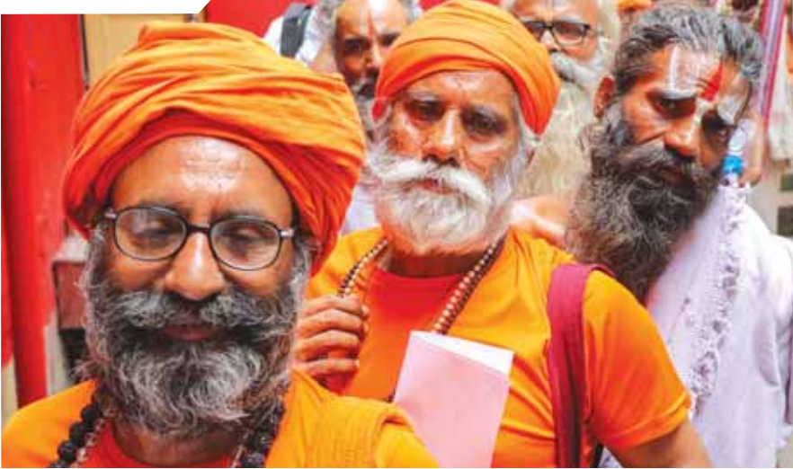
Pilgrims wait in a queue to get themselves registered for the annual Amarnath Yatra, in Jammu