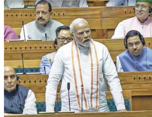
Prime Minister Narendra Modi speaks in the Lok Sabha during ongoing Parliament Session, in New Delhi, on Monday

Prime Minister Narendra Modi termed "serious" the remarks made by Leader of Opposition in Lok Sabha, Rahul Gandhi, by calling the entire Hindu society violent and he, along with Home Minister Amit Shah and other Ministers, demanded an apology from the Congress leader. Intervening during Rahul's speech, Modi said, "This issue is very serious. Calling the entire Hindu community violent is a serious issue." Besides Modi, who intervened twice, at least five Cabinet Ministers also interjected during Rahul's speech with Shah demanding his apology for painting the Hindu community as violent. The second intervention by Modi came when Rahul alleged that Ministers do not greet him due to the fear of Modi, the Prime Minister said democracy and the Constitution have taught him to take the Leader of Opposition seriously. Shah said the ruckus created by the Opposition cannot drown the fact that the words — "those who call themselves Hindus indulge in violence" — were used in the House. Shah spoke of the