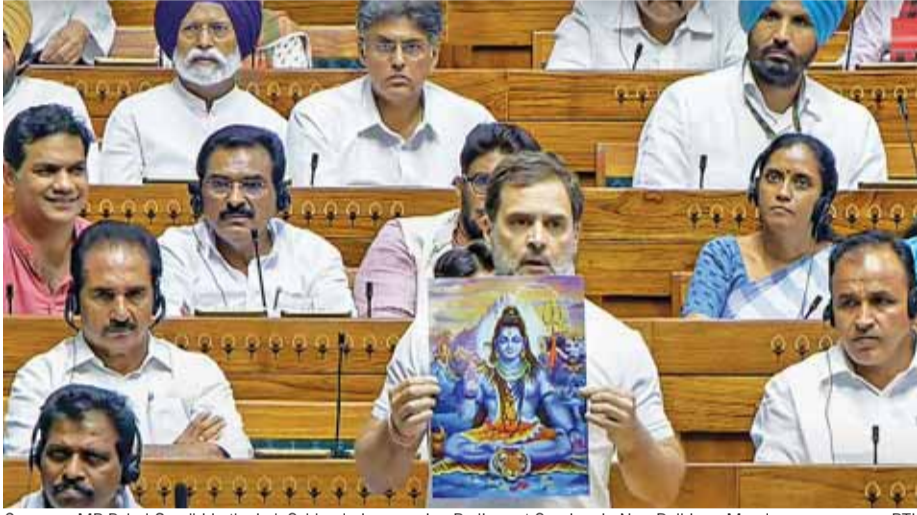
Congress MP Rahul Gandhi in the Lok Sabha during ongoing Parliament Session, in New Delhi, on Monday

In his maiden speech as LoP in Lok Sabha, Rahul triggered a row when he said those who call themselves Hindus are engaged in "violence and hate" round the clock. Rahul said leaders of the ruling party are not Hindus as they engage in "violence and hate" round the clock, drawing massive protests from the Treasury Benches. He, however, hit back at