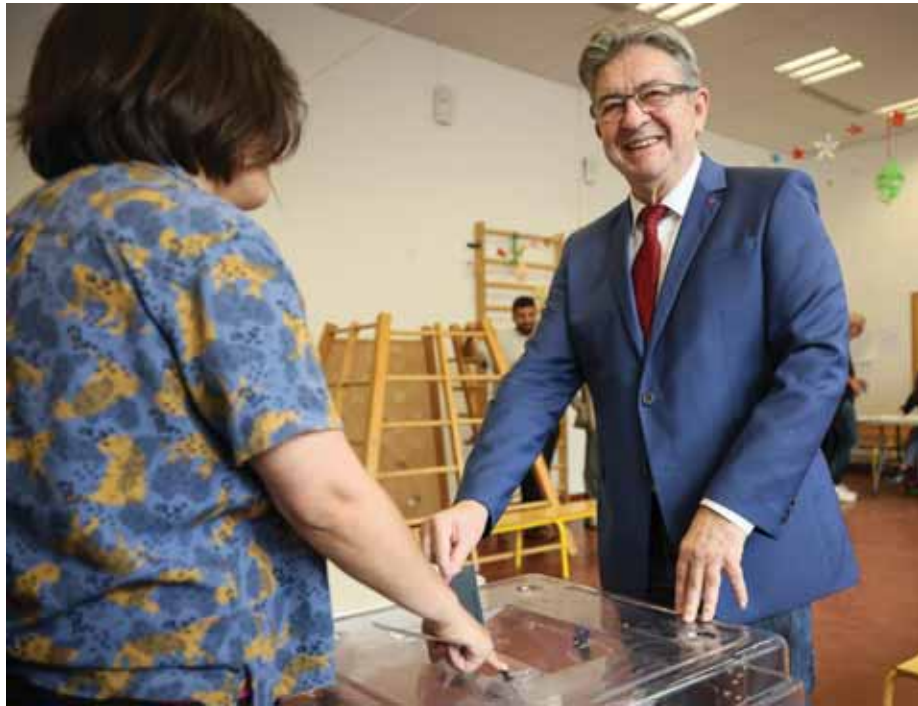
Far left leader Jean-Luc Melenchon casts his ballot, Sunday in Paris. France is holding the first round of an early parliamentary election that could bring the country's first far-right government since Nazi occupation during World War II. The second round is on July 7, and the outcome of the vote remains highly uncertain.

A new coalition on the left, the New Popular Front, also poses a challenge to the pro-business Macron and his centrist alliance Together for the Republic. It includes the French Socialists and Communists and the hard-left France Unbowed party and