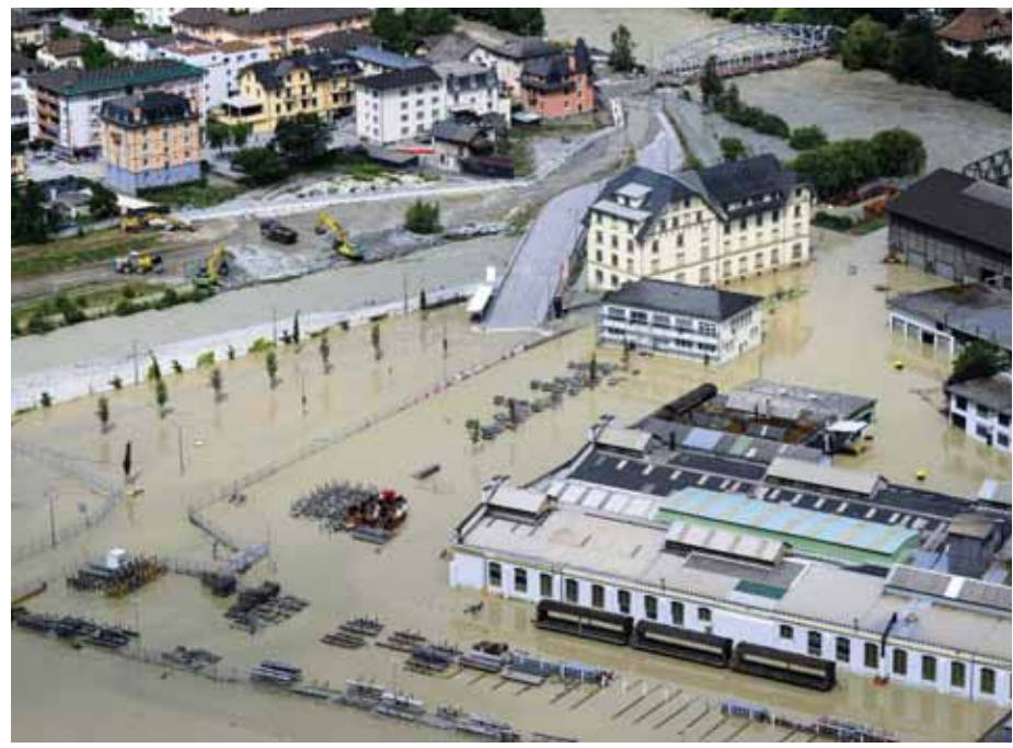
A view of the Rhone river, at right, and the Navignone river, following the storms that caused major flooding, in Chippis, Switzerland, on Sunday

Between Montanaro and San Benigno Canaveze, two adults and a 3-month-old girl were rescued after the rising waters of the Orco torrent left them stuck in their car, firefighters said. Several villages were isolated due to overflowing streams, storms and landslides in the Valle D'Aosta region.