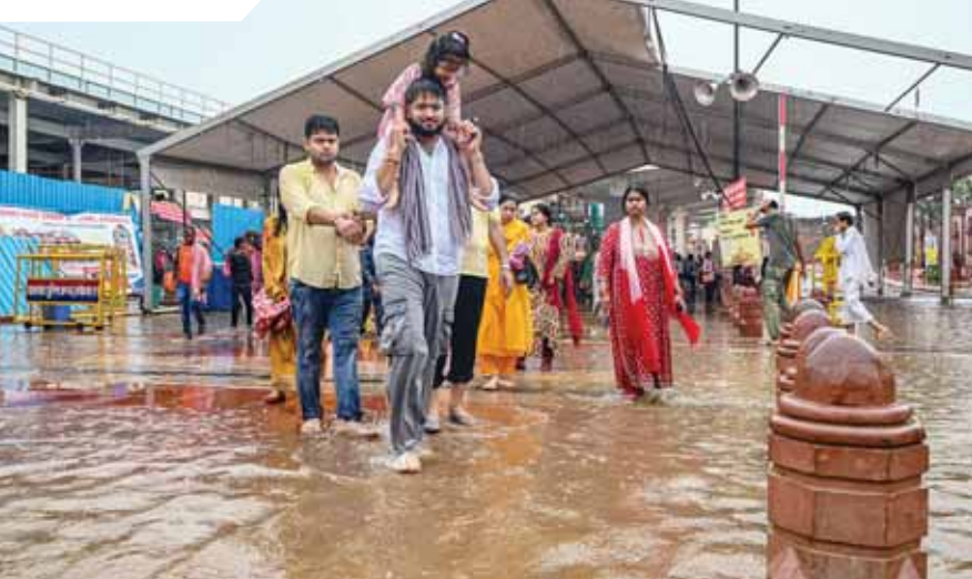
Devotees wade through a waterlogged area at Dharm Path in Ayodhya