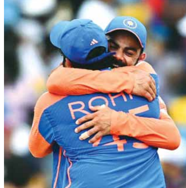
Rohit Sharma embraces Virat Kohli after India's T20 World Cup 2024 win

The confetti shimmered like a thousand dreams realized, raining down on Virat Kohli and Rohit Sharma as they held aloft the T20 World Cup trophy gleaming under the floodlights of Kensington Oval in Barbados. Virat and Rohit walked up to the microphone to give their victory speeches and a different kind of farewell on a night where billions of emotions were high after the triumph final.