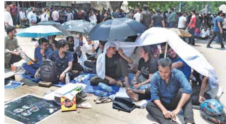
Students stage a protest after three civil services aspirants died due to drowning at a coaching centre in Old Rajinder Nagar area, in New Delhi on Tuesday

Days after three IAS aspirants died in rain-induced flood in the basement of Rau's coaching centre, an enquiry report by the Delhi Chief Secretary on Tuesday highlighted that the institute had completely blocked the drainage system and, unlike other similarly placed properties, had not constructed a barrier wall to prevent water from entering the building. Meanwhile, students continued to protest for the third consecutive day against the Municipal Corporation of Delhi (MCD) and Rau's management. One of the protesting students said ten IAS aspirants have started an indefinite hunger strike demanding compensation of ₹five crore to the victims' families. In his report to the Delhi Minister Atishi, Naresh Kumar has mentioned that the property users in the area have constructed ramps over the entire width of the plot, thereby blocking the entry of storm water during heavy rain into the existing drainage system for the sake of convenience. "The opening in the shape of the manhole over the drainage system has also been covered with finishing items, thus leaving no scope for cleaning of the drains. They have covered the existing, built up section