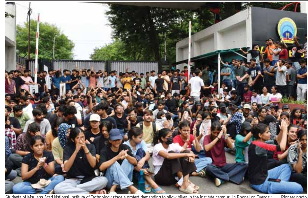
Students of Maulana Azad National Institute of Technology stage a protest demanding to allow bikes in the institute campus, in Bhopal on Tuesday.