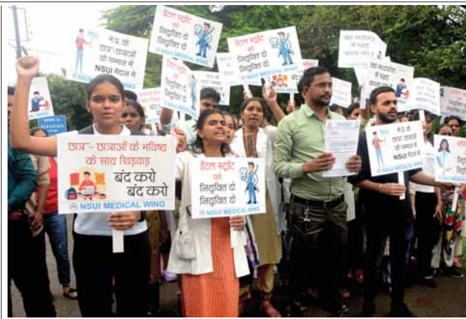
Nursing and Dental students under the banner of NSUI medical wing stage a protest demanding posting in Government service, at the residence of Minister for Health and Family Welfare Rajendra Shukla, in Bhopal on Tuesday.