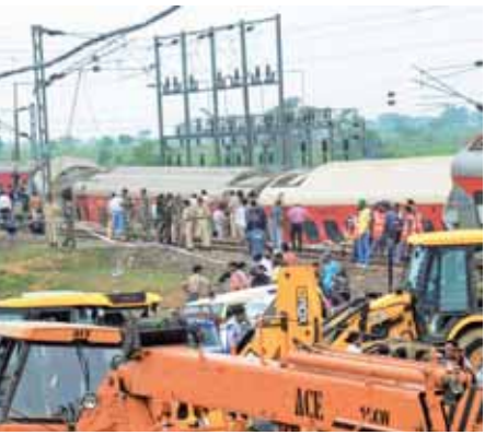
Rescue work underway after the Howrah-Mumbai Mail derailed near Badabamboo, in Seraikela-Kharsawan district of Jharkhand, early Tuesday. At least two people were killed in the accident, according to officials

district. According to environmentalists, Tuesday's disaster is yet another proof that the State administration has not learnt anything from past mistakes. Wayanad has no representative in Parliament as Rahul Gandhi, the Leader of Opposition who was elected from the constituency, gave it up immediately after the 2024 Lok Sabha poll to retain Rae Bareilly. Besides the dead bodies, the rescue teams came across mutilated parts of human bodies which were crushed by huge rocks and stones spewed with force by the landslides. At the time of going to the Press, only less than half of the dead bodies have been identified.