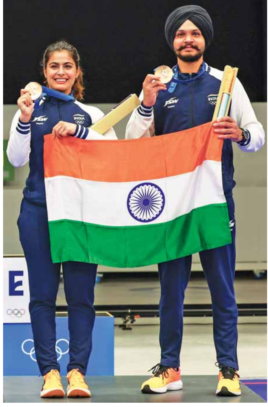
Manu Bhaker and Sarabjot Singh celebrating their bronze medal win in the 10m air pistol mixed team event at the Paris 2024 Olympics.

Manu Bhaker scripted history to become the first Indian athlete in post-independence era to win two Olympic medals in a single edition of the Games as she combined with an equally unruffled Sarabjot Singh to clinch the 10m air pistol mixed team bronze here on Tuesday.