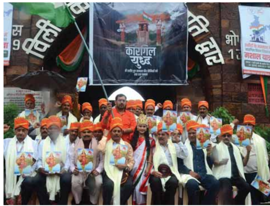
Ex-army men with a girl child dressed as Bharat Mata during 25th anniversary celebration programme of Kargil Vijay Divas, organised by BJP Guru Nanak Mandal workers at Shaheed Gate in Bhopal on Friday.

sive rainfall, low-lying settlements were flooded at some places in Katni and Sagar districts. Relief camps have been set up at these places. Similarly, there was heavy rainfall in Ratlam and Sheopur districts yesterday. Provision of relief amount on loss Chief Minister Yadav said there is no news of crop damage due to the monsoon rain in the state. Some cases of loss of life and animals have come to light, and instructions have been given to the districts to provide financial assistance as per the provision. Information about damage to about 150 houses has also been received. Assistance is also being provided in such cases. For this, an adequate budget has been made available in the districts.