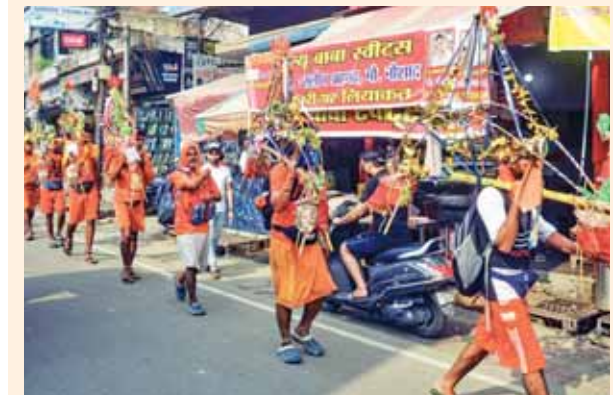
Kanwariyas walk past the shops on which banners with shopkeepers' name were put up on Kanwar Marg after an order issued by Uttar Pradesh Government, in Muzaffarnagar

to converge on the capital for the opening ceremony, and many vacationers were also in transit. French authorities have foiled several plots to disrupt the Olympics, including arresting a Russian man on suspicion of planning to destabilise the games. Also Friday, the French airport of Basel-Mulhouse on the border with Germany and Switzerland was evacuated in the morning and remained temporarily closed "for safety reasons," the airport said. It wasn't clear whether there was a connection to the rail attacks.