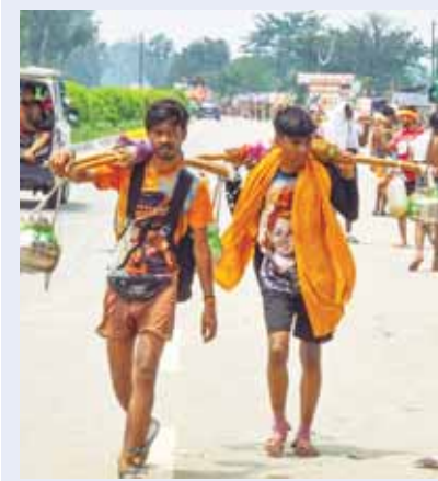
This refers to the news article, "SC Stays Nameplate Diktat on Kanwar Yatra Path" (July 23).