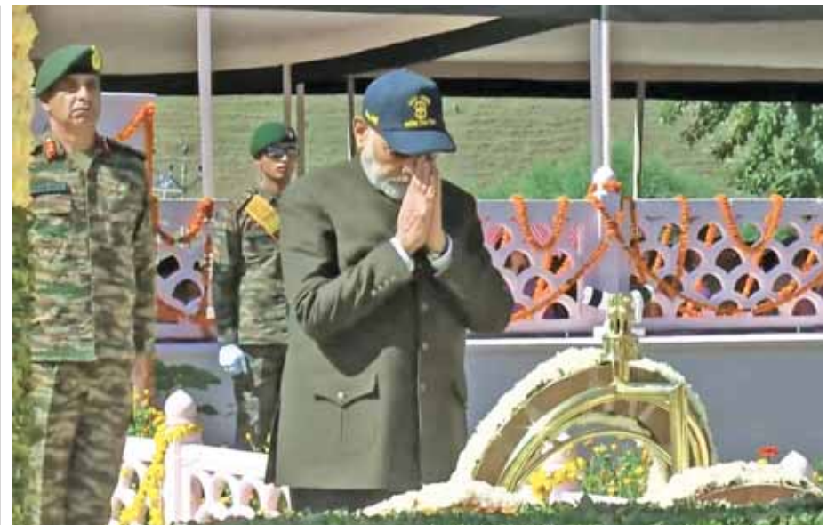
Prime Minister Narendra Modi pays homage at the Kargil War Memorial on the occasion of the 25th anniversary of the 'Kargil Vijay Diwas', in Dras, on Friday