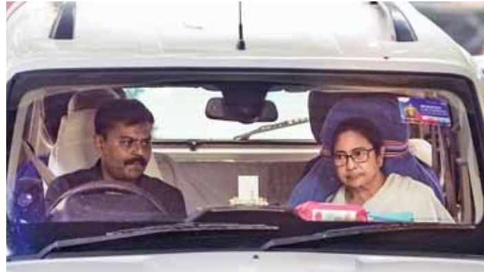
West Bengal Chief Minister Mamata Banerjee arrives at Banga Bhawan, in New Delhi, on Friday

The first meeting of NITI Aayog in the third tenure of Narendra Modi as Prime Minister is to see a "boycott call" by several non-BJP ruled Chief Ministers on Saturday. The meeting to be chaired by Modi will, however, be attended by West Bengal Chief Minister Mamata Banerjee who albeit has called for scrapping of the NITI Aayog and replace it by Planning Commission. Apart from Congress and its alliance-ruled States like Jharkhand, which are part of the INDIA Bloc, declining to attend the crucial meet in the national Capital, Delhi, Punjab, and Kerala have also announced they will not be part of the meeting. Karnataka CM Siddaramaiah, Himachal Pradesh CM Sukhvirinder Singh Sukhu and Telangana's Revanth Reddy have announced they will not attend the meeting over alleged bias against their States in the Union Budget. Tamil Nadu Chief Minister and DMK leader MK Stalin, Kerala's CM and CPI(M) leader Pinarayi Vijayan as well as Aam Aadmi Party (AAP)-led Delhi and Punjab Governments too called to boycott the meeting. "NITI Aayog should be scrapped and Planning Commission should be brought back. Thought it's my duty to raise our voice on common platform even though I know NITI Aayog has no financial power," Mamata said and confirmed to take part in the meeting. She said she will use the opportunity to register her protest against a "discriminatory Budget" and the