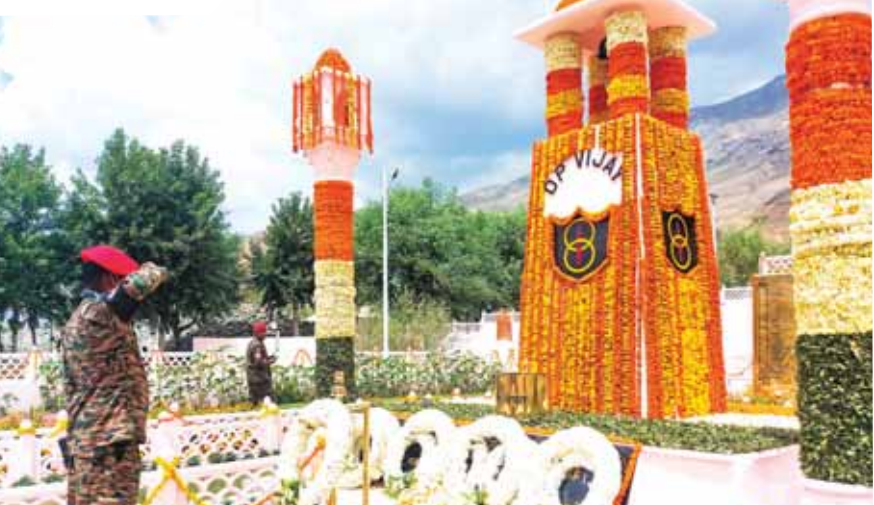
A soldier pays homage at the Kargil War Memorial on the 'Kargil Vijay Diwas', in Drass