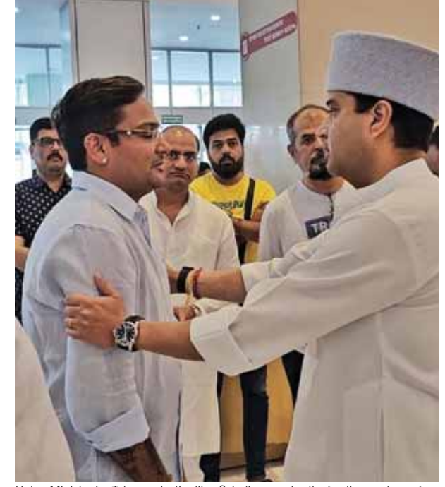
Union Minister for Telecom Jyotiraditya Scindia consoles the family members of senior BJP leader and former Rajya Sabha MP Prabhat Jha, who died after prolonged illness at Medanta hospital in Gurugram on Friday.