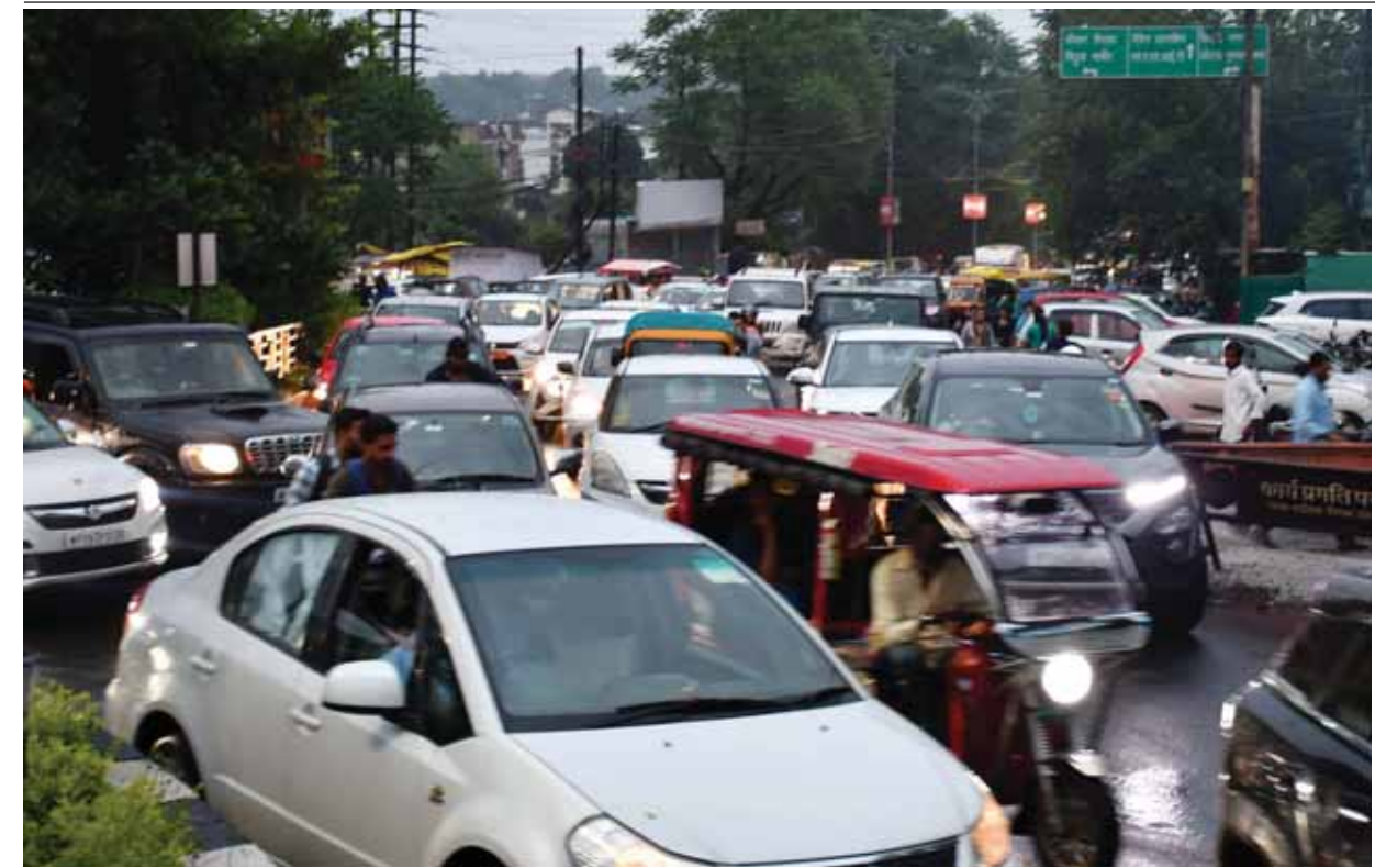
A view of a traffic jam at Mata Mandir square in Bhopal on Friday.