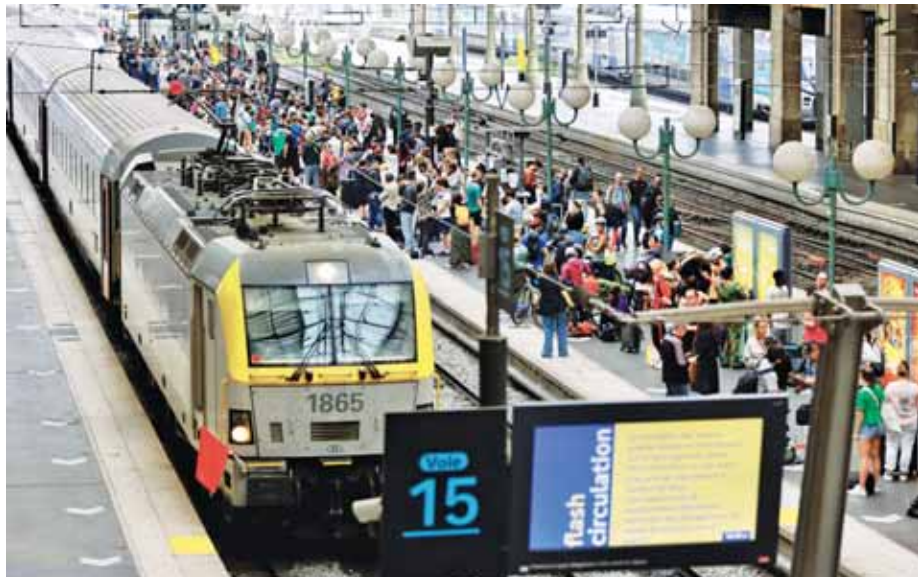
Stranded passengers wait inside Gare du Nord station in Paris, France, on Friday. France's high speed rail network TGV was severely disrupted following a 'massive attack', according to train operator SNCF, just hours before the opening ceremony of the Paris 2024 Olympic games. Around 800,000 passengers are expected to be affected over the weekend

France's high-speed rail network was hit on Friday with widespread and "criminal" acts of vandalism, including arson attacks, paralysing travel to Paris from across the rest of France and Europe only hours before the grand opening ceremony of the Olympics. French officials condemned the attacks as "criminal actions," and prosecutors in Paris opened a national investigation, saying the crimes could carry sentences of 15 to 20 years. As Paris authorities geared up for a spectacular parade on and along the Seine River, three fires were reported near the tracks on the high-speed lines of Atlantique, Nord and Est, causing disruptions that affected hundreds of thousands of travellers.