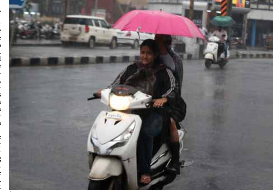
Commuters move on the road amid rain in Bhopal on Thursday.