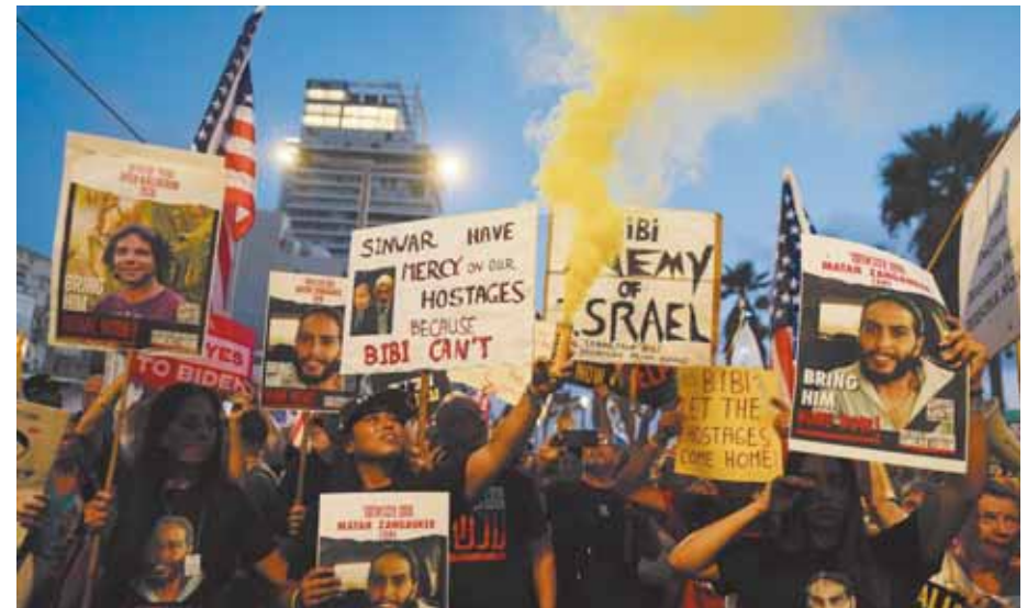
Relatives and supporters of the hostages held captive by Hamas in the Gaza Strip take part in a protest to demand their immediate release outside of the U.S. Embassy Branch Office in Tel Aviv, Israel, Wednesday.

could be taking shape after nine months of war, but durthey are sleeping in the streets. ing his fiery speech to The Health Ministry in Gaza Congress, he vowed to press says more than 39,100 Palestinians have been killed in