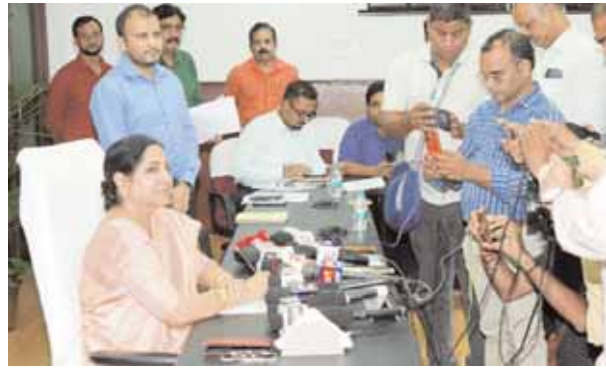
Madhya Pradesh gets budget allocation of Rs 14738 crore Ashwini Vaishnav, Railway Minister...