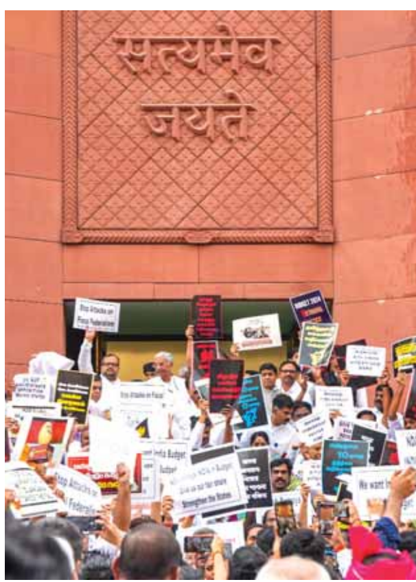
INDIA Bloc MPs stage a protest in Parliament premises over alleged discrimination in the Union Budget 2024, during the Monsoon Session, in New Delhi, on Wednesday

Opposition parties resorted to vehement protest in and out of Parliament on Wednesday over the alleged discrimination against Opposition-ruled States in the Union Budget. MPs belonging to the INDIA Bloc staged protest in Parliament premises during the day and also walked out from the Rajya Sabha while heated exchange of words between the ruling benches "outrageous" and said all the States never found a mention in any of the previous Budgets, including those presented by the Congress. Leader of the Opposition in the Lok Sabha Rahul Gandhi said the Budget is an "assault on the sanctity of India's federal structure". Ruling BJP dismissed the Congress charge of the Union Budget being "discriminatory" towards Opposition-ruled States and asserted that every