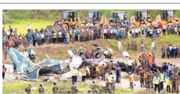
Rescue operations are underway at the site of a plane crash at Tribhuvan International Airport in Kathmandu, Nepal, on Wednesday