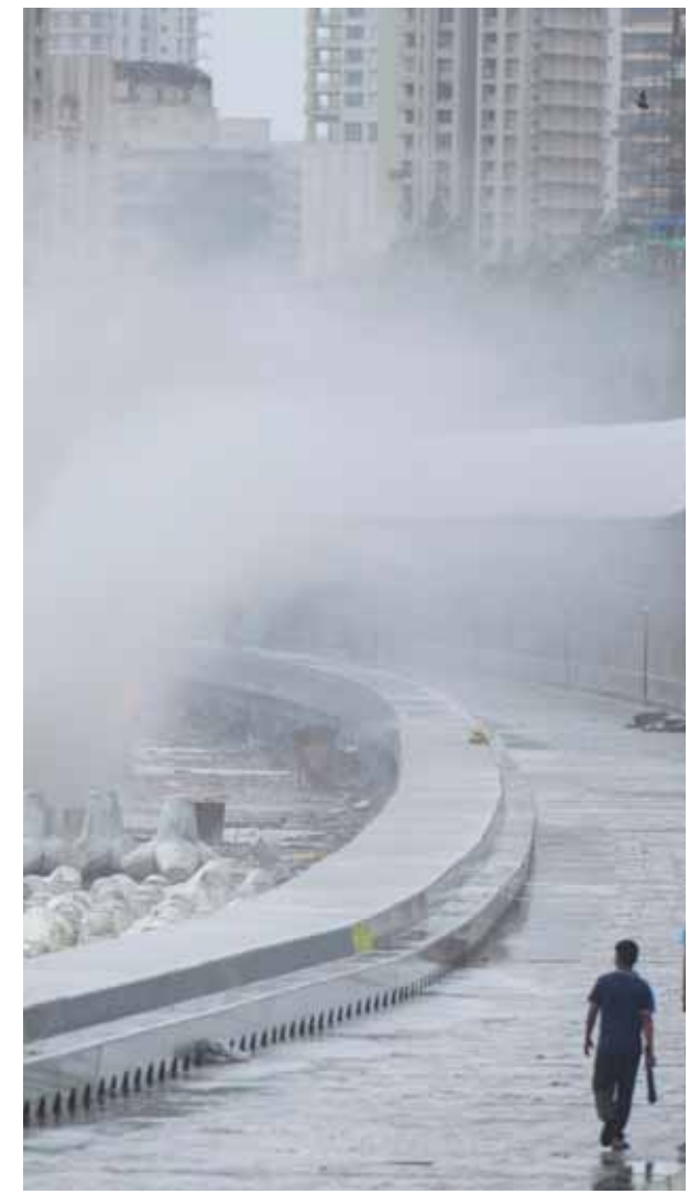
People walk past as sea waves crash against the promenade during high tide, at Marine drive, in Mumbai, on Wednesday

issues such as import duties on automobiles and scotch whisky and visas for business people. The British readout said Lammy will highlight the importance of a new partnership with India that focuses on economic, domestic and global security. Economic, domestic and global security will be at the heart of the Foreign Secretary's first visit to India as he travels to New Delhi to unlock the full potential of the UK-India partnership. He will tell his Indian counterpart that he wants to drive forward greater growth for both countries, it said. The Foreign Secretary will underscore the importance of the "living bridge" between the UK and India. It represents the 1.7 million people with Indian heritage that have made their home in the UK and make an exceptional contribution to British life, the readout released by the UK high commission in New Delhi said. "In a visit to India's third largest technology company, the Foreign Secretary will meet business leaders to highlight how the UK and India are working together on shared ambitions such as cutting-edge science to encourage innovation, boost trade, and improve the livelihoods of working people in both countries," it said.