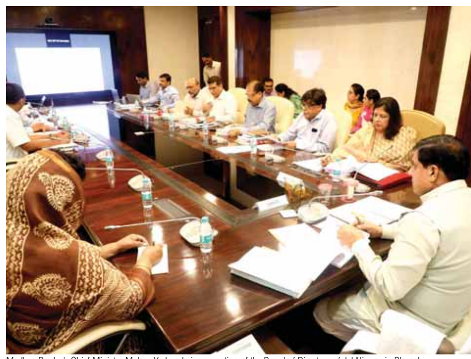
Madhya Pradesh Chief Minister Mohan Yadav chairs a meeting of the Board of Directors of Jal Nigam, in Bhopal on Wednesday.