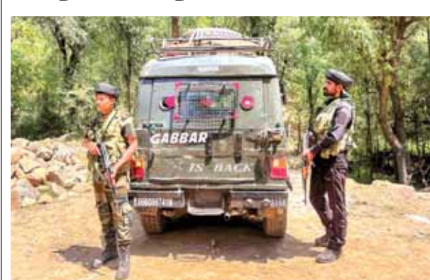
Security personnel stand guard during an encounter with terrorists in Trimukha area of Sopore in North Kashmir, on Wednesday