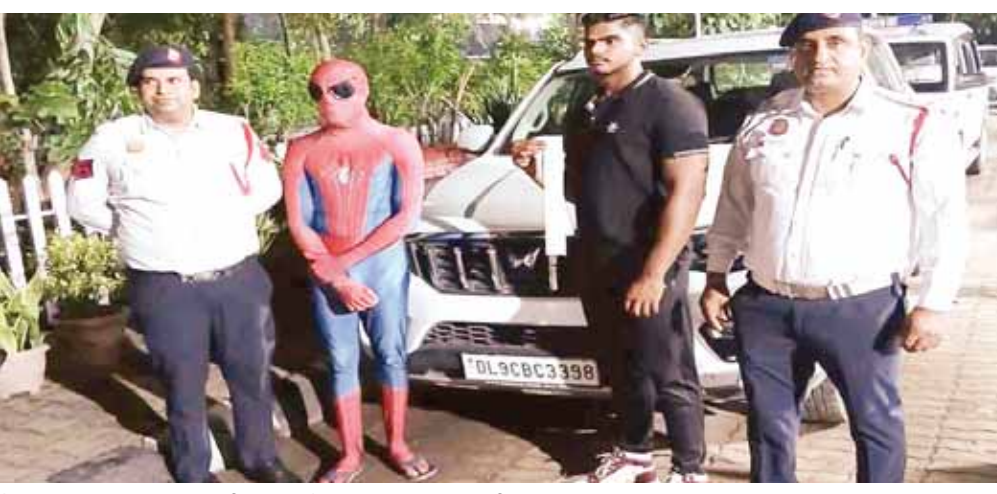
A 20-year-old man, sitting on a Scorpio car's bonnet and dressed as Spiderman landed in the police net on Wednesday

In an era where fleeting moments of fame on social media have become the obsession, many youngsters are resorting to dangerous stunts and rule-breaking to impress their followers on platforms like Instagram and Twitter. One such incident involved a 20-year-old "Spiderman" in Delhi, who was caught sitting on the bonnet of a car while making videos, showcasing the perilous lengths some will go for digital notoriety. According to officials on Wednesday, a fine of ₹ 26,000 was imposed for dangerous driving and other violations in the matter.