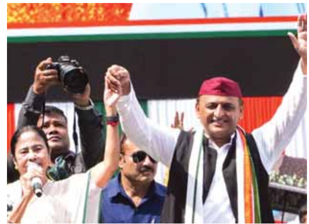
West Bengal Chief Minister and TMC chief Mamata Banerjee with Samajwadi Party (SP) National President Akhilesh Yadav during TMC 'Martyr's Day' rally in Kolkata, on Sunday

After major allies like JD (U) and LJP, BJP's another significant ally in the NDA --the Rashtriya Lok Dal -- on Sunday demanded the Uttar Pradesh Government roll back its order that eateries along the Kanwar route must display the names of their owners, saying the pilgrimage does not belong to any one religion or caste. Union Minister Jayant Chaudhary said Kanwaris ask no-one their religion when they seek any service from them, neither should the matter (the pilgrimage) be linked to any religion. Chaudhary also wondered if one should wear a name tag on one's clothes to identify one's religion. "Where all one would be made to place these identifiers! Should we now wear name tags too? So that one knows who to shake hands with?" he said. "It seems that the order was taken without much thought and the Government is adamant on it because the decision has been taken," Rajya Sabha member Chaudhary told reporters here.