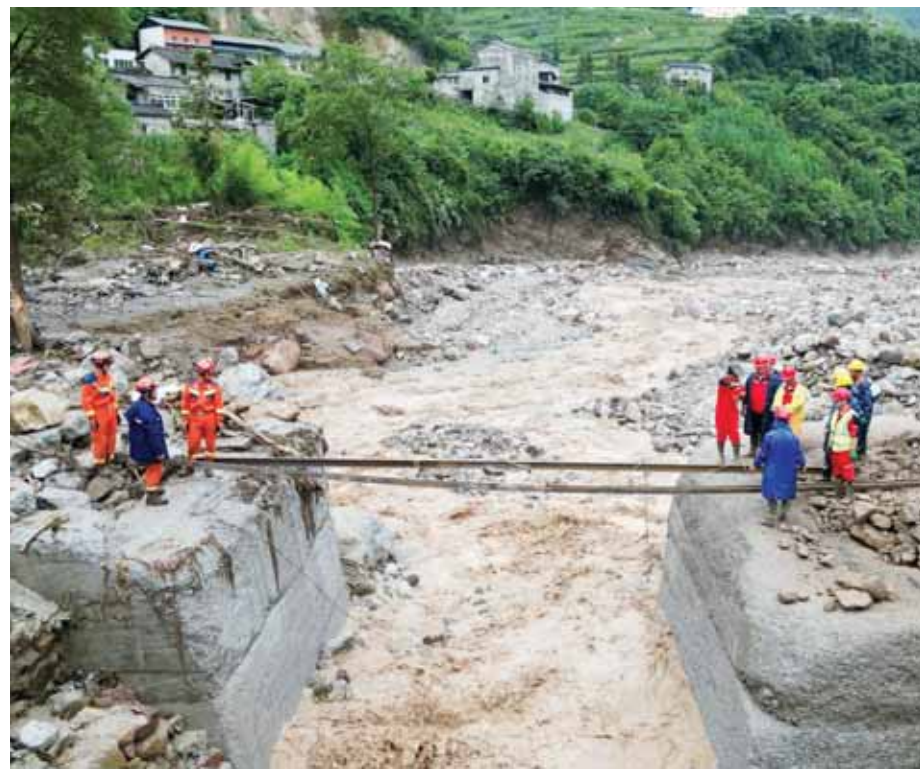
In this image made from video released by Xinhua News Agency, rescue workers set up a temporary crossing in the aftermath of floods in Xinhua Village of Hanyuan County, Ya'an City, southwest China's Sichuan Province, July 20

Department said, adding, "The department allowed for the voluntary departure of non-emergency US government employees and family members." "The Government of Bangladesh has declared a curfew throughout Bangladesh, ordering everyone to stay indoors. The Bangladeshi Army has been deployed throughout the country to reinforce the police. Telecommunications have been interrupted in Dhaka and across the country. Due to the security situation, there may be a delay in provision of routine consular services," the advisory stated. The US State Department said crimes such as muggings, burglaries, assaults, and illegal drug trafficking constitute the majority of criminal activity in Bangladesh's major cities, but there are no indications foreigners are being targeted because of their nationality. These crimes tend to be situational, based on time and location, it said.