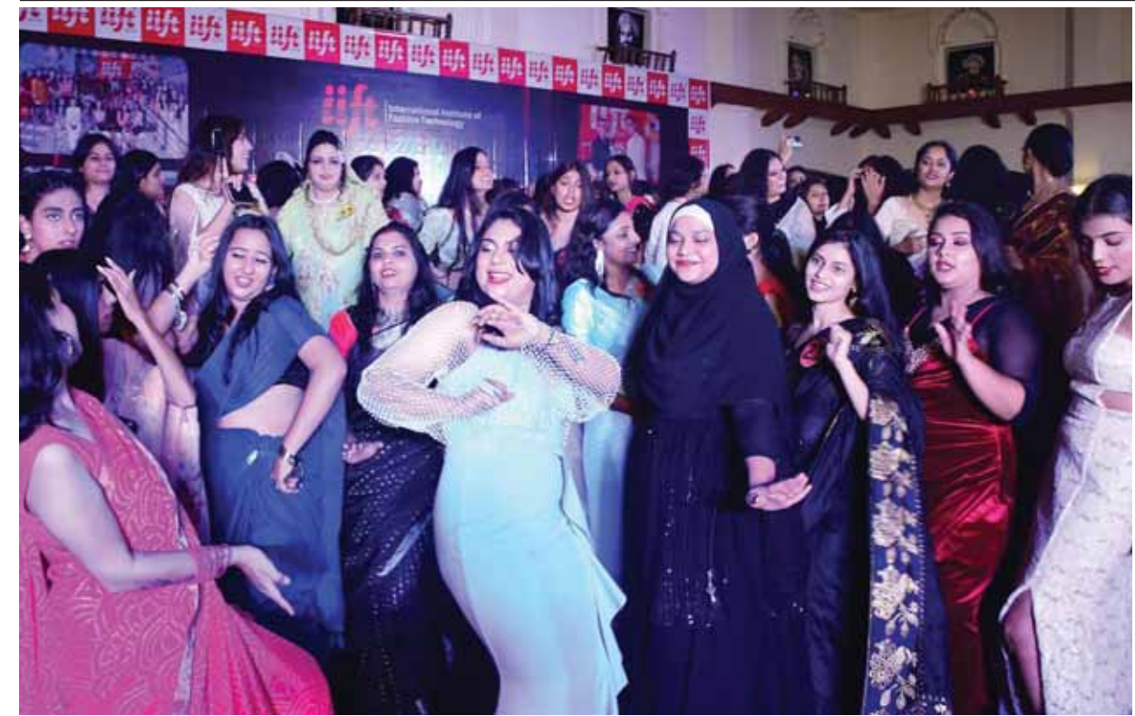
Students of International Institute of Fashion Technology (IIFT) during a Bollywood Bash party, at Hotel Noor-Ul-Sabah Palace in Bhopal on Sunday.