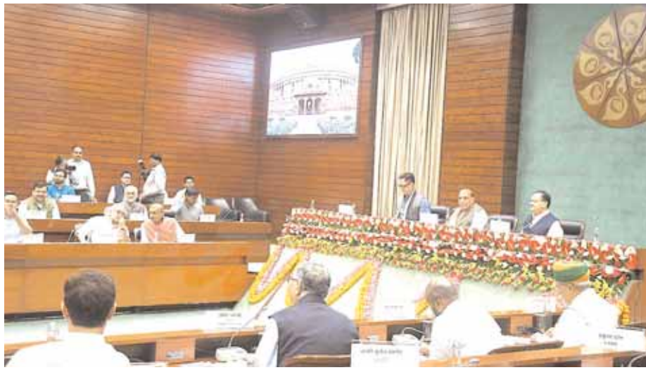
Defence Minister Rajnath Singh, Union Minister for Parliamentary Affairs Kiren Rijiju and Union Minister Jagat Prakash Nadda during the all-party meeting ahead of the Budget session of Parliament, in New Delhi on Sunday

The Monsoon Budget session will have 19 sittings till August 12 when the