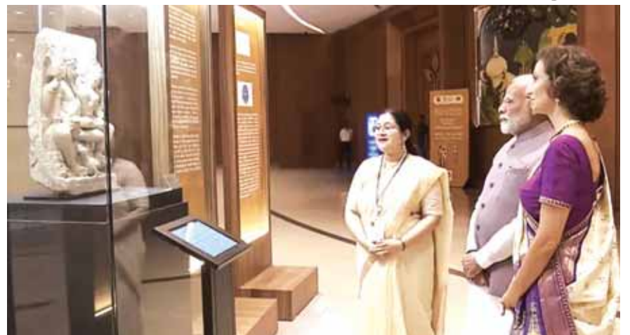
Prime Minister Narendra Modi watches exhibition during the inauguration of the 46th Session of World Heritage Committee, at Bharat Mandapam, in New Delhi, Sunday