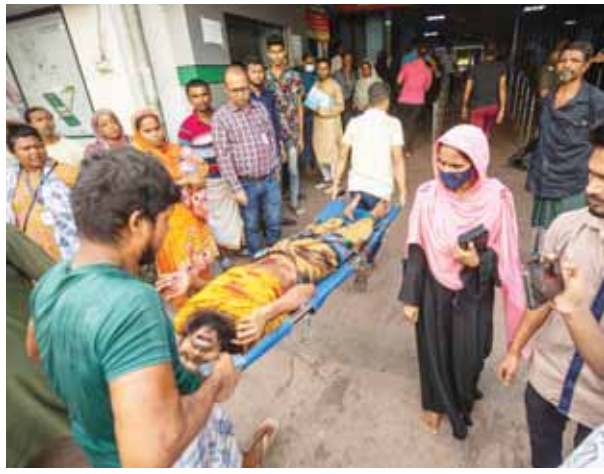
An injured student is carried on a stretcher as students clash with police over the quota system in public service brought to a hospital, in Dhaka, Bangladesh, on Saturday, July 20

Saturday that at least 103 people have died so far. Sporadic clashes in some parts of Dhaka, the capital, were reported on Saturday but it was not immediately clear whether there were any fatalities. Ahead of the Supreme Court hearing, soldiers patrolled cities across the South Asian country. Home Minister Asaduzzaman Khan said the stay at home order will be relaxed from 3 pm to 5 pm on Sunday for people to run essential errands. Meanwhile, the government has declared Sunday and Monday as public holidays, with only emergency services allowed to operate. Protesters argue the quota system is discriminatory and benefits supporters of Hasina, whose Awami League party led the independence movement, saying it should be replaced with a merit-based system. Hasina has defended the quota system, saying that veterans deserve the highest respect for their contributions in the war against Pakistan, regardless of their political affiliation. Representatives from both sides met late Friday in an attempt to