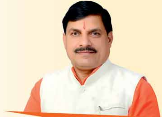
Dr. Mohan Yadav Chief Minister

REGIONAL INDUSTRY CONCLAVE 20th July, 2024, Jabalpur Netaji Subhash Chandra Bose Cultural and Information Centre