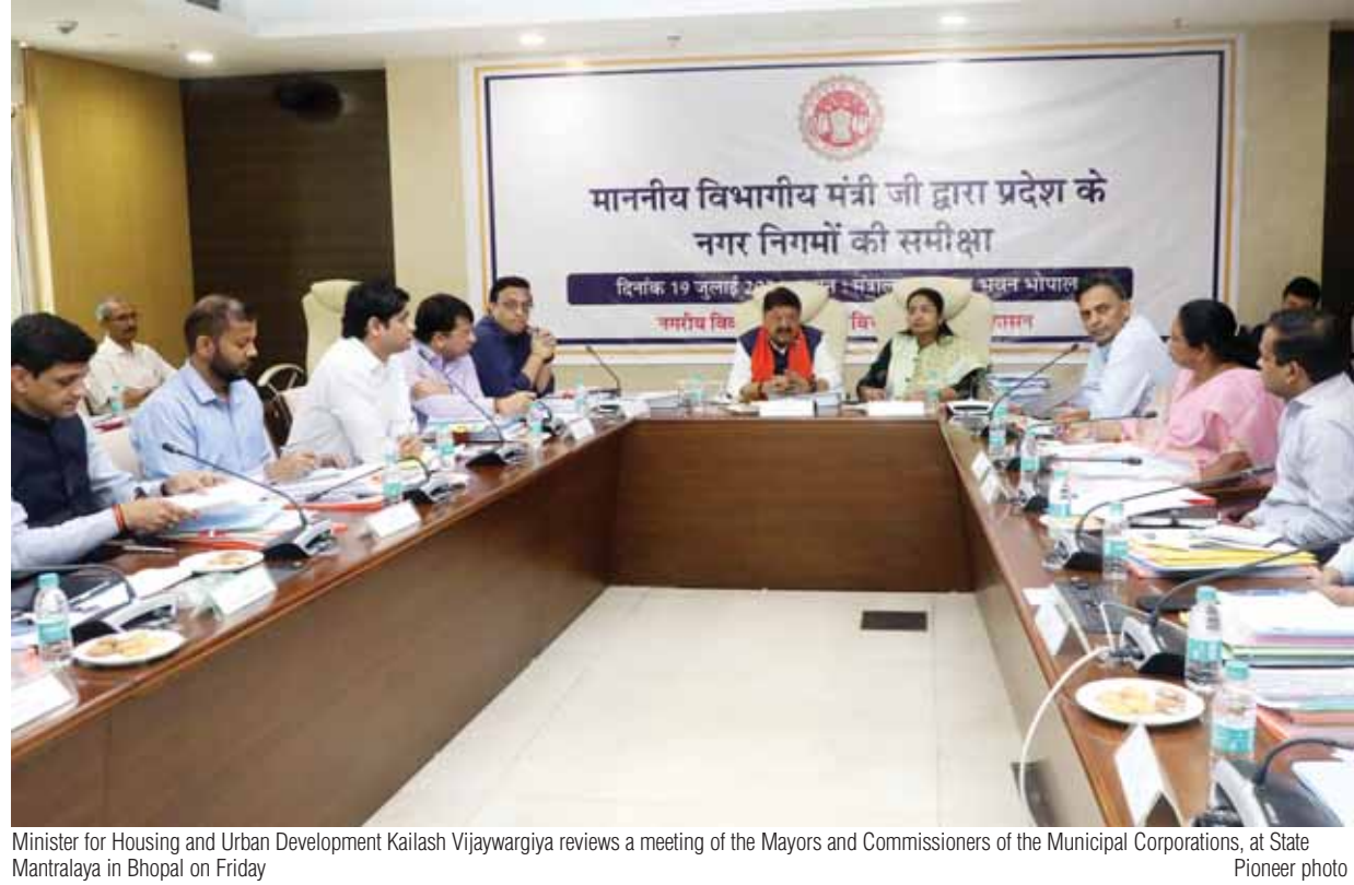
Minister for Housing and Urban Development Kailash Vijaywargiya reviews a meeting of the Mayors and Commissioners of the Municipal Corporations, at State Mantralaya in Bhopal on Friday