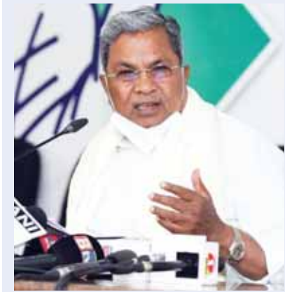
The criticism from business and industry forced the Karnataka government to put the contentious reservation bill for