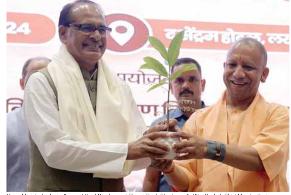
Union Minister for Agriculture and Rural Development Shivraj Singh Chouhan with Uttar Pradesh Chief Minister Yogi Adityanath during a Regional Conference on 'Science of Natural Farming' in Lucknow, Uttar Pradesh on Friday.