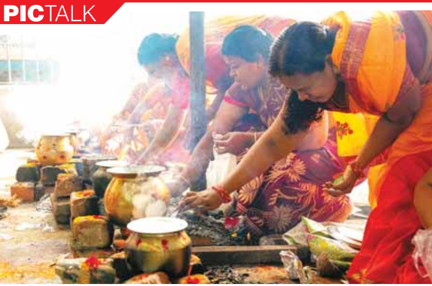
Devotees perform rituals at Amman temple during the Tamil month of 'Aadi', in Chennai

The deployment strategy will concentrate on several key areas. Firstly, there will be an emphasis on enhanced surveillance and intelligence gathering to preempt and disrupt terrorist activities before they occur. Secondly, security forces will establish increased patrolling in vulnerable areas to deter potential threats and provide reassurance to the local population. Lastly, efforts will be made to engage with local communities to gather vital information and build trust, which is essential for effective counter-terrorism operations.