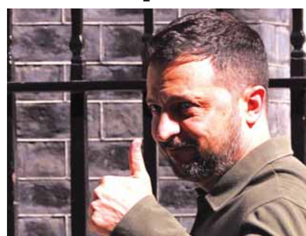
Ukraine's President Volodymyr Zelensky leaves Downing Street after meeting with Britain's Prime Minister Keir Starmer in London on Friday

weapons to strike Russian territory because of concerns that the West could be drawn into direct conflict with Russia. The British government has said it's up to Ukraine how to use missiles supplied by the UK, as long as international law is upheld.