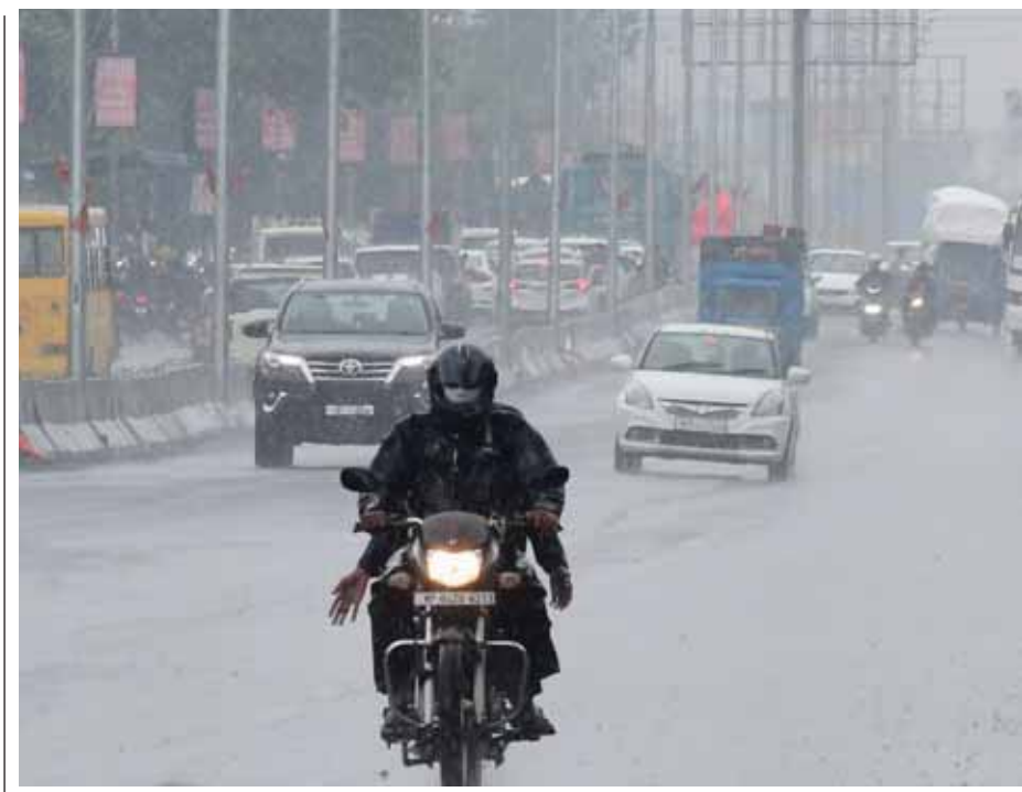
Vehicles ply on the road amid rain in Bhopal on Friday.

year to the Delhi government that spent it in on providing facilities like 24-hour free electricity, free treatment at hospitals, building and maintaining roads and flyovers. Alleging step-motherly treated with Delhi, she said out of the total Rs 2.32 lakh crore Delhi people gave to the Centre, it did not spend a single rupee on Delhi. The minister said that no other city of the world like New York, Tokyo or London would have faced such injustice as the BJP-led Central government is doing to Delhi.