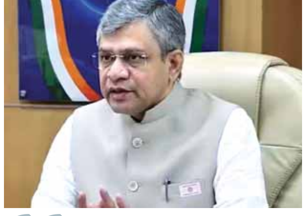
MEITY is in touch with Microsoft and its associates regarding the global outage

Microsoft users globally, including several in India, reported massive outages in services, with the outage tracking website Downdetector showing users flagging disruptions across various services. A new update from CrowdStrike, a cybersecurity software firm, is being cited as the cause of the outage, which has impacted Windows-based desktops and laptops. Globally, long queues formed at airports in the US, Europe, and Asia, including India, as airlines lost access to check-in and booking services at a time when many travellers are heading away on summer vacations. News outlets in Australia — where telecommunications were severely affected — were pushed off air for hours. Hospitals and doctor's offices had problems with their appointment systems, while banks in South Africa and New Zealand reported outages to their payment system or websites and apps. Some athletes and spectators descending on Paris ahead of the Olympics were delayed as was the arrival of their uniforms and accreditations, but games organisers said