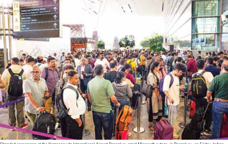
Stranded passengers at the Kempegowda International Airport Bengaluru amid Microsoft outage, in Bengaluru, on Friday. IndiGo, Air India Express, SpiceJet and Akasa at the Bengaluru airport began checking in passengers manually on Friday, issuing handwritten boarding passes, after a global Microsoft outage led to the Navitaire Departure Control System stalling

minimising inconvenience and ensuring well-being of all travellers. The airports and airline operations, whose systems were based on Microsoft, faced significant disruptions since about 10.40 am on Friday. IndiGo, SpiceJet, Air India and Akasa saw disruptions in their online check-in and boarding processes across their networks, forcing them to