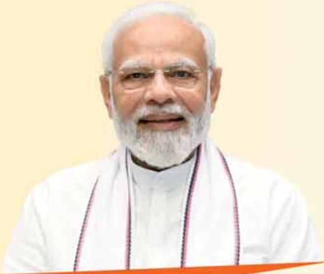
Narendra Modi Prime Minister