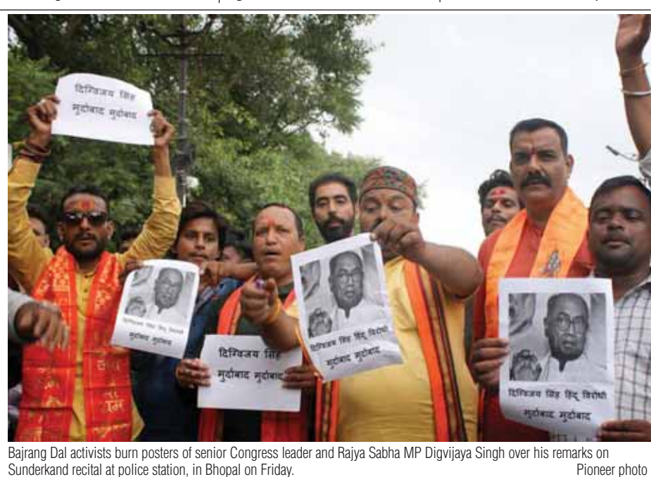
Bajrang Dal activists burn posters of senior Congress leader and Rajya Sabha MP Digvijaya Singh over his remarks on Sunderkand recital at police station, in Bhopal on Friday.

other income rose by 16.52% YOY. The cost to income ratio for the quarter was 47.20%, while the return on assets (ROA) and return on equity (ROE) were 1.70% and 17.33%, respectively.