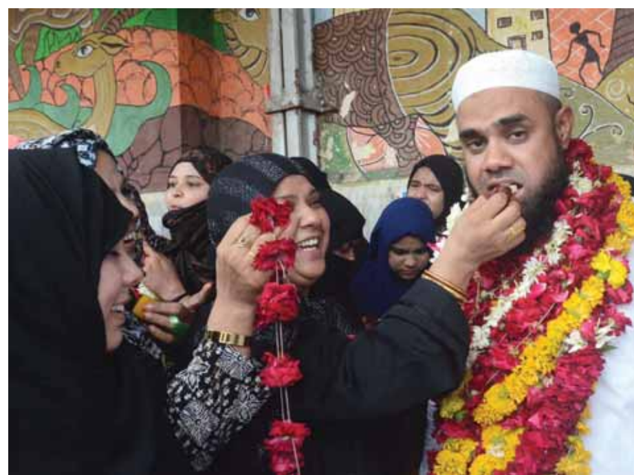
Hajj pilgrims being welcomed by their family members and relatives on their return from the Mecca shrine after completion of their annual journey, at railway station in Bhopal on Thursday.

Neemuch, Harda, Ashoknagar, Narsinghpur, Shahdol, Balaghat, Betul and Dhar. Madhya Pradesh is making efforts to contribute more to India's merchandise exports. Products like pharmaceutical products, cotton, nuclear reactors, boilers, machine tools, textiles, organic foods, chemicals, aluminium, metals, grains, electrical machinery equipment, plastics have found way to global market. Maximum pharmaceutical products were exported. The value of drug products stood at Rs 13,158 crore. Doubling export A target has been set to double the exports from Madhya Pradesh in the next three years. Indore is the top ranking district, which exported items worth Rs 20,256 crore.