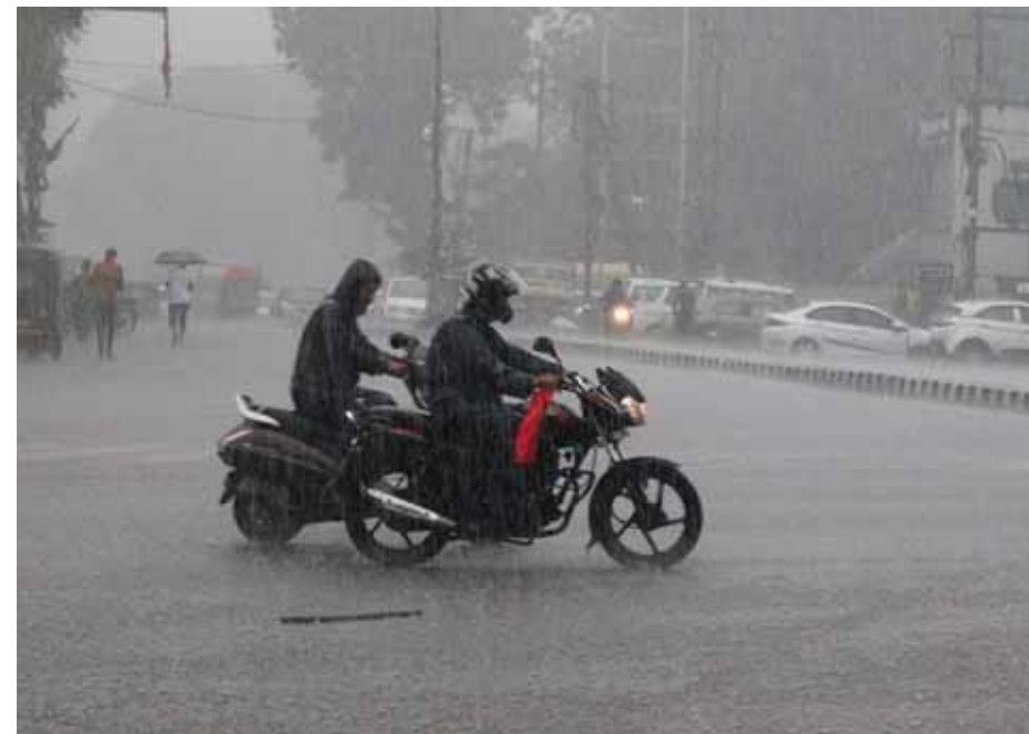
Commuters move on the road amid heavy rain in Bhopal on Thursday.

This troubled the students and teachers a lot. Earlier on Thursday afternoon, the Kolans river flowed 3 feet above the level. Its water is coming into the big pond. Due to which the level is increasing. According to the Meteorological Department, a total of 420 mm i.e., 16.5 inches of water has fallen in Bhopal this season, which is 35% of the quota of rain. Here, after the intense humidity, the weather changed at 3 pm and heavy rain started. The road at MP Nagar intersection was filled with water up to one and a half feet. Light rain continues in the evening as well. Water filled at Alpana Tiraha due to heavy rain. This led to a traffic jam. Due to the rains in the past few days, there was a traffic jam for 2 hours. Waterlogging also occurred in Harshvardhan Nagar in Ward-30. Many houses were flooded here. Roads also became ponds in many areas like Jahangirabad, Karond. Waterlogging occurred in many houses in Tulsinagar. This situation arose due to overflowing of drains. In Sant Hirdaram Nagar, the area behind Shikhar Hotel near Sehore Naka was flooded with one to two feet of water.