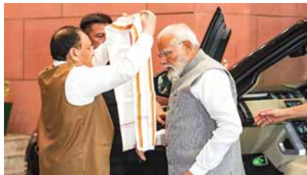
Prime Minister Narendra Modi being welcomed by Union Minister and BJP President JP Nadda as he arrives to meet party workers at the BJP headquarters, in New Delhi, on Thursday