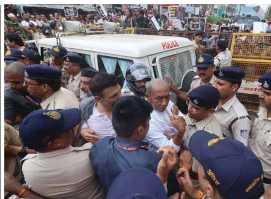
Congress State President Jitu Patwari, senior party leader Digvijaya Singh and party workers during a rally demonstration demanding an FIR against Minister Vishwas Kailash Sarang and his resignation for allegedly being involved in nursing colleges scam, at Ashoka Garden police station in Bhopal on Thursday.

from GSI, the Forest Department, ASI, NVDA, Chief Municipal Officer Bedhaghat and WII. It is noteworthy that Bhedaghat-Lametaghat, Jabalpur is a geological marvel of Madhya Pradesh included in the tentative list of UNESCO World Heritage Sites in the natural category. The Madhya Pradesh Tourism Board is taking the initiative to prepare the nomination dossier of Bhedaghat-Lametaghat in Narmada Valley, Jabalpur, and Madhya Pradesh. The WII and Madhya Pradesh Tourism Board are working on the dossier which will be completed by the end of this year. Post completion the dossier will be sent to UNESCO for review and further process.