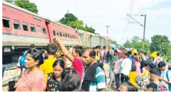
Local residents gather after Chandigarh-Dibrugarh Express derails in Uttar Pradesh on Thursday

order. "We want the identity of students be masked. You can have dummy roll numbers. But let us see it centre-wise what is the marks pattern," the bench said. The call for city-and centre-wise results underlines the focus this hearing has taken a deep-dive into data about the precise number of students who sat for the exam and passed, as well as the number who have asked for a re-test or for results to be scrapped, and those opposing any intervention. The bench noted the counsel for the petitioners have submitted that it would be appropriate if the result of NEET-UG 2024 examination was published on the NTA website so as to bring about transparency with regard to centre-wise marks obtained by candidates. It also said material collected by the Bihar Police and the report of its Economic Offences Wing (EOW), before the investigation was taken over by the CBI, shall be filed in the court by 5 pm on July 20. At the outset, the bench said it has prioritised the hearing on the pleas over other cases as these have "social ramifications" and lakhs of students are waiting for the outcome.