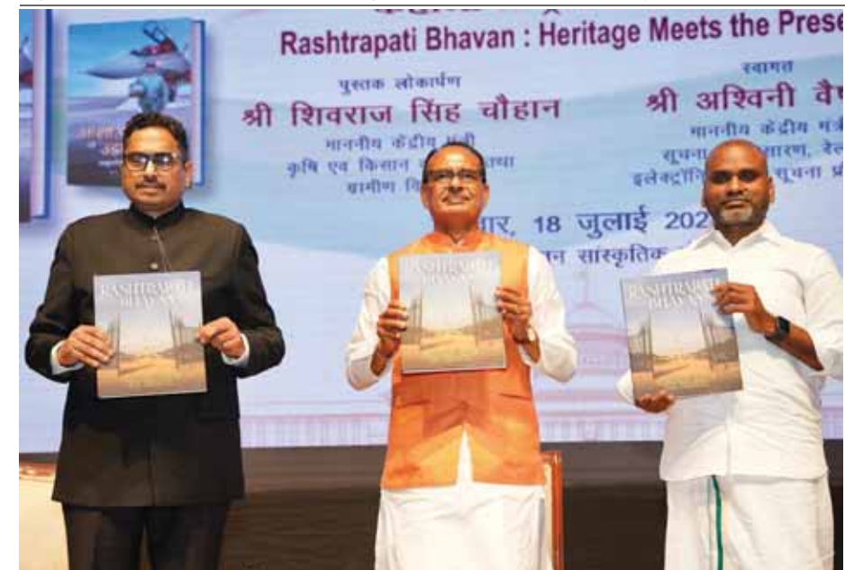
Union Minister for Agriculture and Rural Development Shivraj Singh Chouhan releases a book 'Rashtrapati Bhavan Heritage Meets the Present' at Rashtrapati Bhavan in New Delhi on Thursday.