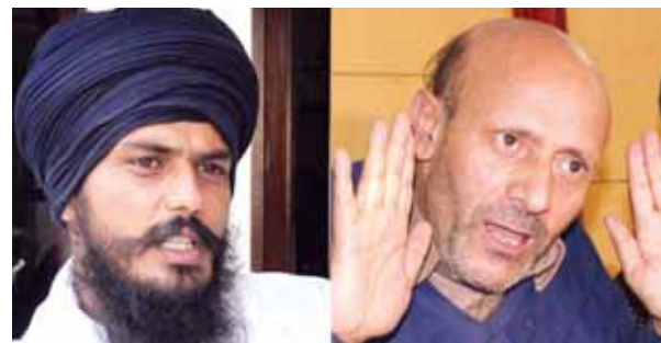
Sikh preacher Amritpal Singh and Kashmiri leader Sheikh Abdul Rashid

Jailed radical Sikh preacher Amritpal Singh and Kashmiri leader Sheikh Abdul Rashid, who were granted parole to take oath as members of the Lok Sabha, were sworn in as MPs on Friday, amid heavy deployment of security personnel in and around the Parliament complex. While Rashid, popularly known as Engineer Rashid, is in Delhi's Tihar jail in a terror-funding case registered under the Unlawful Activities (Prevention) Act, Singh is lodged in a prison in Assam's Dibrugarh district for offences under the National Security Act. They were brought to the Parliament complex by