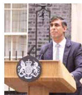
Britain's Labour Party leader Keir Starmer reacts on stage as he is elected for the Holborn and St Pancras constituency, in London (l). Britain's outgoing Conservative Party Prime Minister Rishi Sunak speaking outside 10 Downing Street before going to see King Charles III to tender his resignation in London, on Friday.