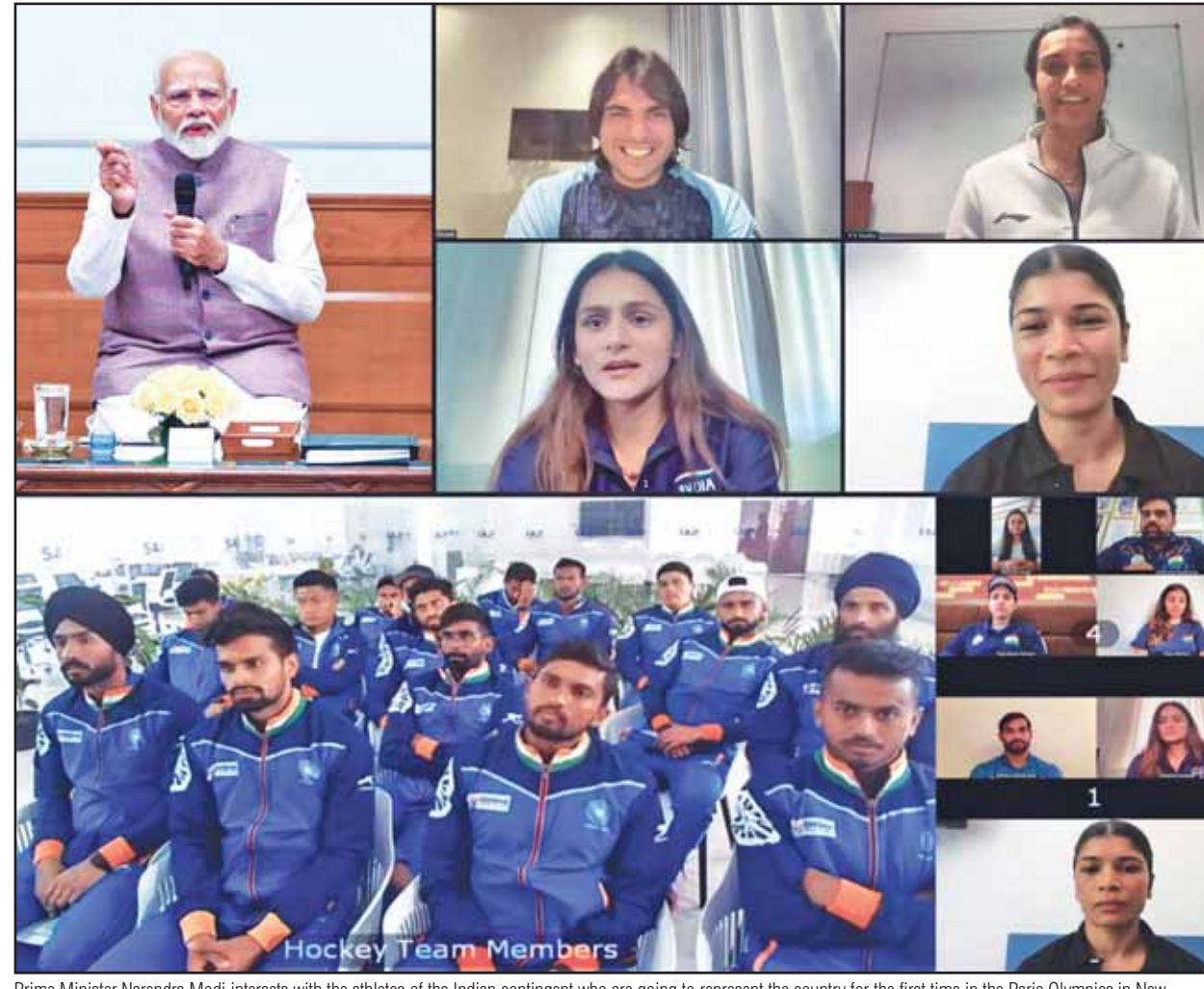
Prime Minister Narendra Modi interacts with the athletes of the Indian contingent who are going to represent the country for the first time in the Paris Olympics, in New Delhi, Thursday, July 4, 2024

PTI ■ NEW DELHI Confident that India's bid to host the 2036 Olympics will be successful, Prime Minister Narendra Modi has urged athletes bound for this month's Paris Games to share their views on the arrangements in the French capital to help his government's ambitious plan to bring the quadrennial showpiece here. In an interaction with Paris-bound athletes, conducted both in person and online on Thursday, Modi said those travelling to the French capital would do the country a huge service by providing inputs from their experience. "We are hoping to host the Olympics in 2036, it will help in creating a sporting atmosphere (in the country). Work is in progress to prepare infrastructure for it," he said in the interaction, which was attended by the national men's hockey team, the shooting contingent, boxers and track-and-field stars such as Neeraj Chopra among others. The complete video of the PM's light-hearted conversation with the athletes was shared by his office on Friday. The meeting with the contingent was also attended by sports minister Mansukh Mandaviya and Indian Olympic Association (IAO)