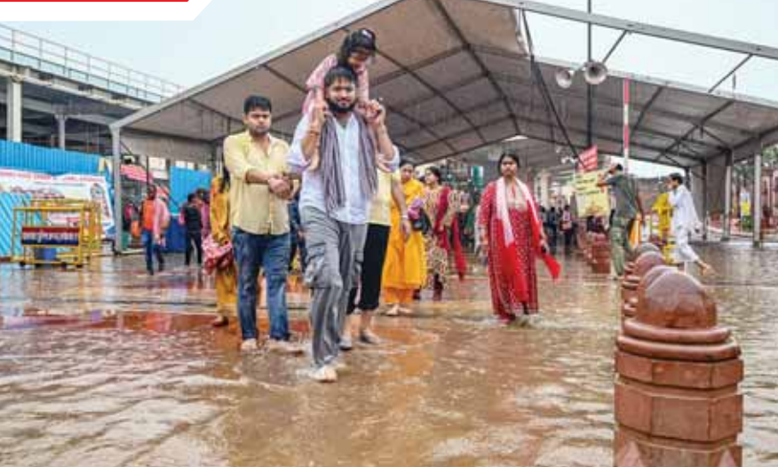
Devotees wade through a waterlogged area at Dharm Path in Ayodhya