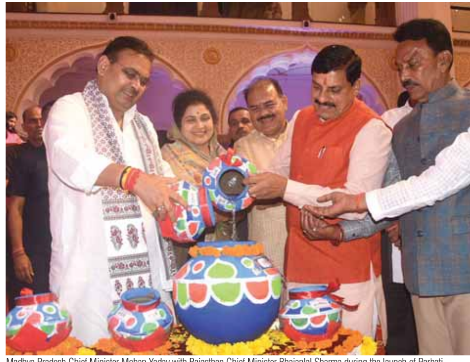
Madhya Pradesh Chief Minister Mohan Yadav with Rajasthan Chief Minister Bhajanlal Sharma during the launch of Parbati-Kalisindh-Chambal interstate river linking project, in Bhopal on Sunday.

Furthermore, he expressed a commitment to joint wildlife conservation efforts and promoting tourism and employment-oriented industries. Rajasthan Chief Minister Bhajanlal Sharma praised Chief Minister Dr. Yadav for advancing the joint initiative of Madhya Pradesh and Rajasthan, aligning closely with Prime Minister Modi's vision. He emphasized their shared commitment to advancing both states together, anticipating significant progress upon the completion of this project. Shri Sharma underscored the collaborative efforts between the state and the Centre to propel this project forward, noting the changed landscape from earlier times with now expanded resources.