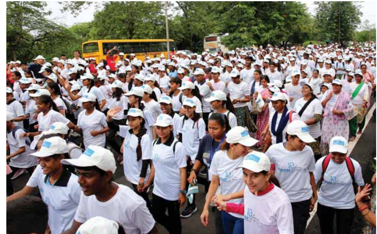
Citizens take part in a 'Shakti Run' for gender justice and women's safety organised by ActionAid and other NGOs in Bhopal on Sunday.

Mandla on Sunday evening. Clouds were there since Sunday morning and the weather remained cool due to drizzle in between. But in the evening, the city got drenched due to heavy rain for about half an hour. One and a quarter inch rain was recorded here. The month of June was passing and the farmers were eagerly waiting for the monsoon rain. Shajapur was the coldest city in the state. The day temperature here was 25.4 degrees, while 22.4 degrees was recorded at night. The mercury remained below 30 degrees in Pachmarhi, Umaria, Naugaon, Malajkhand, Sagar and Seoni. Talking about big cities, Bhopal recorded 30.2 degrees, Indore 31.6 degrees, Gwalior 34.6 degrees, Jabalpur 30.5 degrees and Ujjain recorded 32.2 degrees.