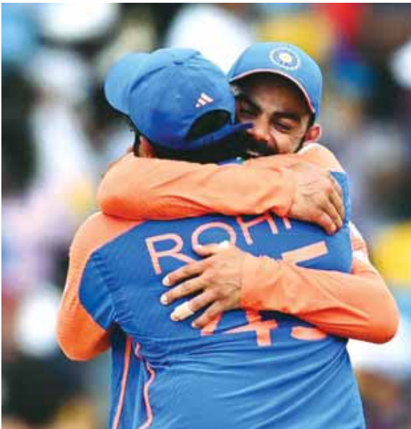
Rohit Sharma embraces Virat Kohli after India's T20 World Cup 2024 win

The confetti shimmered like a thousand dreams realized, raining down on Virat Kohli and Rohit Sharma as they held aloft the T20 World Cup trophy gleaming under the floodlights of Kensington Oval in Barbados. Virat and Rohit walked up to the microphone to give their victory speeches and a different kind of farewell on a night where billions of emotions were high after the triumph final. While receiving the Man of the Match award for his crucial innings of 76 of 39 balls, Virat said, "This was my last T20 World Cup, this is exactly what we (Indian Cricket Team) wanted to achieve, now it's time for the next generation to take over." After receiving the medals and awards, Rohit Sharma also announced his retirement officially. While addressing the post match conference Sharma said, "That was my last game as well. Honestly I have enjoyed it since the time I started playing this format. There's no better time to say good bye to this format, winning the World Cup is what I wanted." India's star all-rounder Ravindra Jadeja also hung up his boots from T20 Internationals. Kohli has always been the star performer for India from his debut 2012 World Cup.