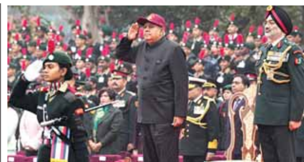
Vice President Jagdeep Dhankhar receives the Guard of Honour during the NCC Republic Day Camp 2024 in New Delhi on Friday.