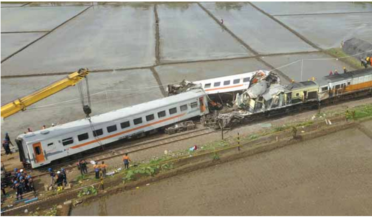
A crane tries to remove the wreckage after the collision between two trains in West Java, Indonesia, on Friday. The trains collided on Indonesia's main island of Java on Friday, causing several carriages to buckle and overturn, officials said.

Over the years, the Sri Lankan government has been aggressive against Tamilian groups following its war with LTTE which collapsed in 2009 after the Sri Lankan Army killed its supreme leader Velupillai Prabhakaran.