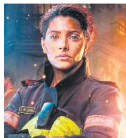
Saiyami Kher- Agni

As 2024 comes to an end, a defining trend in Bollywood has been the rise of female actors taking on powerful roles in uniform, portraying police officers, soldiers, and other resilient characters. These performances shattered stereotypes, placing actresses at the forefront of action-packed narratives and highlighting their strength and determination. With commanding portrayals both on OTT platforms and the silver screen, these roles not only showcased their versatility but also brought inspiring stories of courage and perseverance to life, marking a significant shift in how women are represented in Indian cinema.