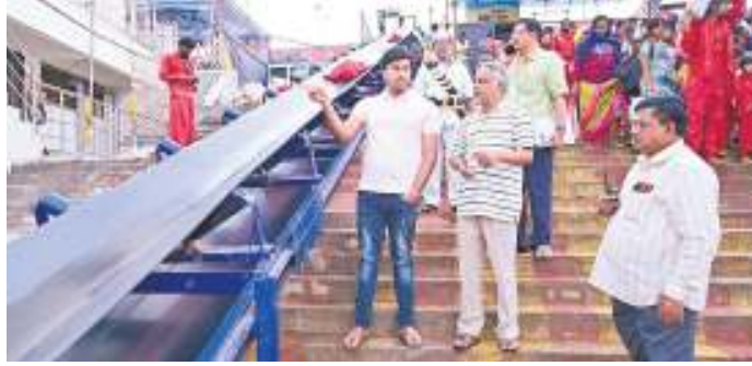
VMC Commissioner HM Dhyanaachandra inspecting the sanitation maintenance at a Ghat in River Krishna in Vijayawada (File photo)