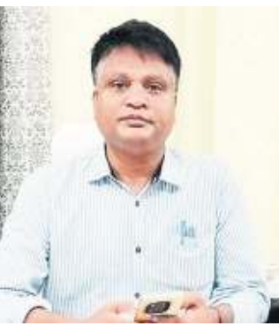
as the Voter Enrollment Officer for the Mylavaram Assembly Constituency.