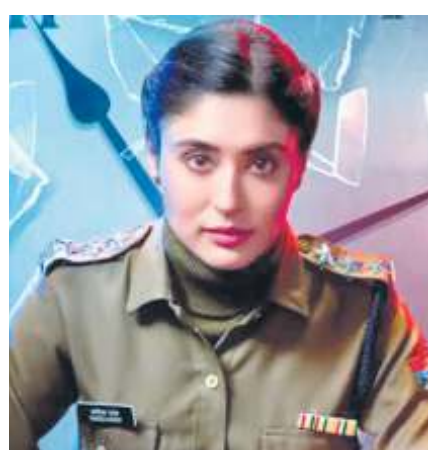
Kritika Kamra-Gyaarah Gyaarah

Kritika Kamra delivered a standout performance as a no-nonsense police officer in Gyaarah Gyaarah , a gripping time-bending thriller that unraveled a series of mysterious crimes spanning past, present and future. Renowned for her commanding screen presence, Kritika seamlessly embodied the role of a dedicated law enforcement officer, undergoing extensive combat training and a significant physical transformation to bring authenticity to her character. Her portrayal masterfully balanced the resilience and vulnerability inherent in the profession, earning her widespread acclaim. With Gyaarah Gyaarah , Kritika showcased her ability to tackle complex and challenging roles, solidifying her position as a versatile and compelling actor.