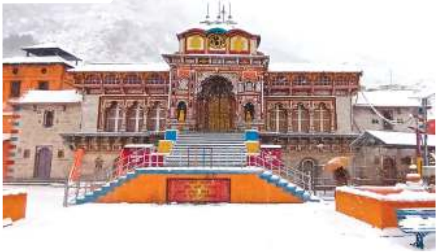
The Badrinath Dham covered with snow during fresh snowfall, in Chamoli