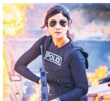
Shilpa Shetty-Indian Police Force

Shilpa Shetty made an impressive comeback as a fearless and committed police officer in Rohit Shetty's web series Indian Police Force . The action-packed series showcased her executing intense stunts and hand-to-hand combat scenes, setting a new benchmark for female actors in Bollywood's action genre. Her exceptional fitness and agility were evident, earning widespread acclaim from critics and audiences. Beyond the adrenaline-pumping sequences, Shilpa's performance captured the emotional challenges of law enforcement, making her character both relatable and inspiring. With Indian Police Force , Shilpa reaffirmed her ability to evolve and take on bold, dynamic roles, further solidifying her versatility as an actor.