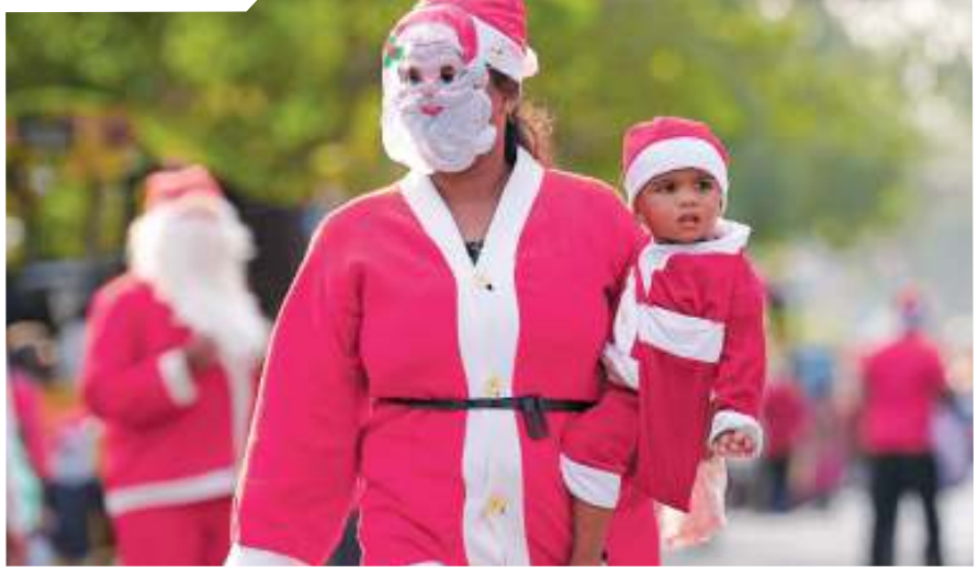
People dressed as Santa Claus during Christmas celebration, in Chennai