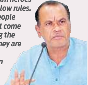
-Komatireddy Venkatreddy, TG Minister P4

I also saw the film 'Pushpa-2.' I had decided to watch only historical and Telangana movies. We can do many things in our life in the 3 hours we use to watch a movie. Youths are spoiled by movies. Film heroes should follow rules. Cinema people should not come out among the public if they are not given permission by the police