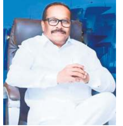
We are formulating an action plan in collaboration with zonal chairpersons and other officials to transform APSRTC into a turnaround organisation. Damaged bus stations will also be developed