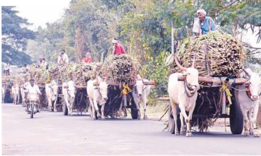
Bullock carts loaded with sugarcane head towards the Sugar Factory for crushing, in Karad