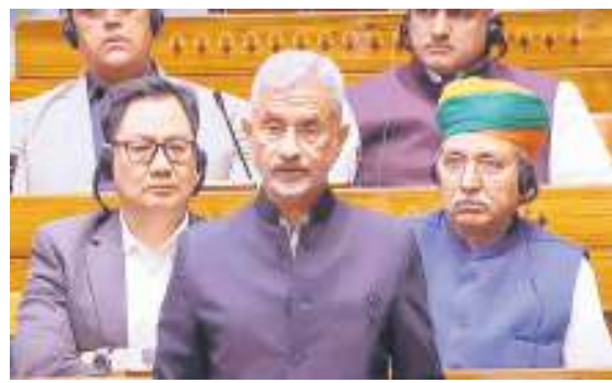
Making a statement in the Lok Sabha, the minister said India-China ties have been abnormal since 2020 when peace and tranquillity in border areas were disturbed due to Chinese actions

"The amassing of troops by China in eastern Ladakh in April-May 2020 resulted in face-offs at a number of points. After the Galwan Valley clashes, we were addressing a situation that not only saw fatalities but events that needed heavy weaponry deployment," he said. The recent developments that reflect continuous diplomatic engagements have set India-China ties in the direction of "some improvement", he said. "We remain committed to engaging with China to arrive at a fair and mutually acceptable framework for boundary settlement... The government has maintained that India-China relations cannot be normal in the absence of peace and tranquillity in the border areas, the combination of a firm and principal stance on this situation and the border areas, as well as a clearly articulated approach to the totality of our ties," Jaishankar said. "We have been very clear that the restoration of peace and tranquillity will be the basis for the relationship to move forward," he added.