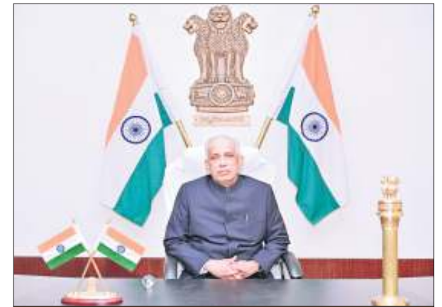
This year's Youth Festival is centred around two key goals: to bring new youth leaders into politics and to ensure meaningful youth contributions towards a developed India, or Viksit Bharat, through a transparent, democratic, merit-based selection process

The "Viksit Bharat Young Leaders Dialogue" will be held during the National Youth Festival at the Bharat Mandapam in New Delhi on 11th and 12th January 2025. The event is in line with the Prime Minister's vision of increasing youth participation in national development. The dialogue will feature an interaction between Prime Minister